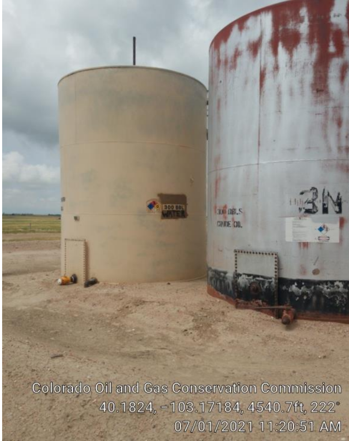
Colorado Oil and Gas Conservation Commission 40.1824, -103.17184, 4540.7ft, 222° 07/01/2021 11:20:51 AM