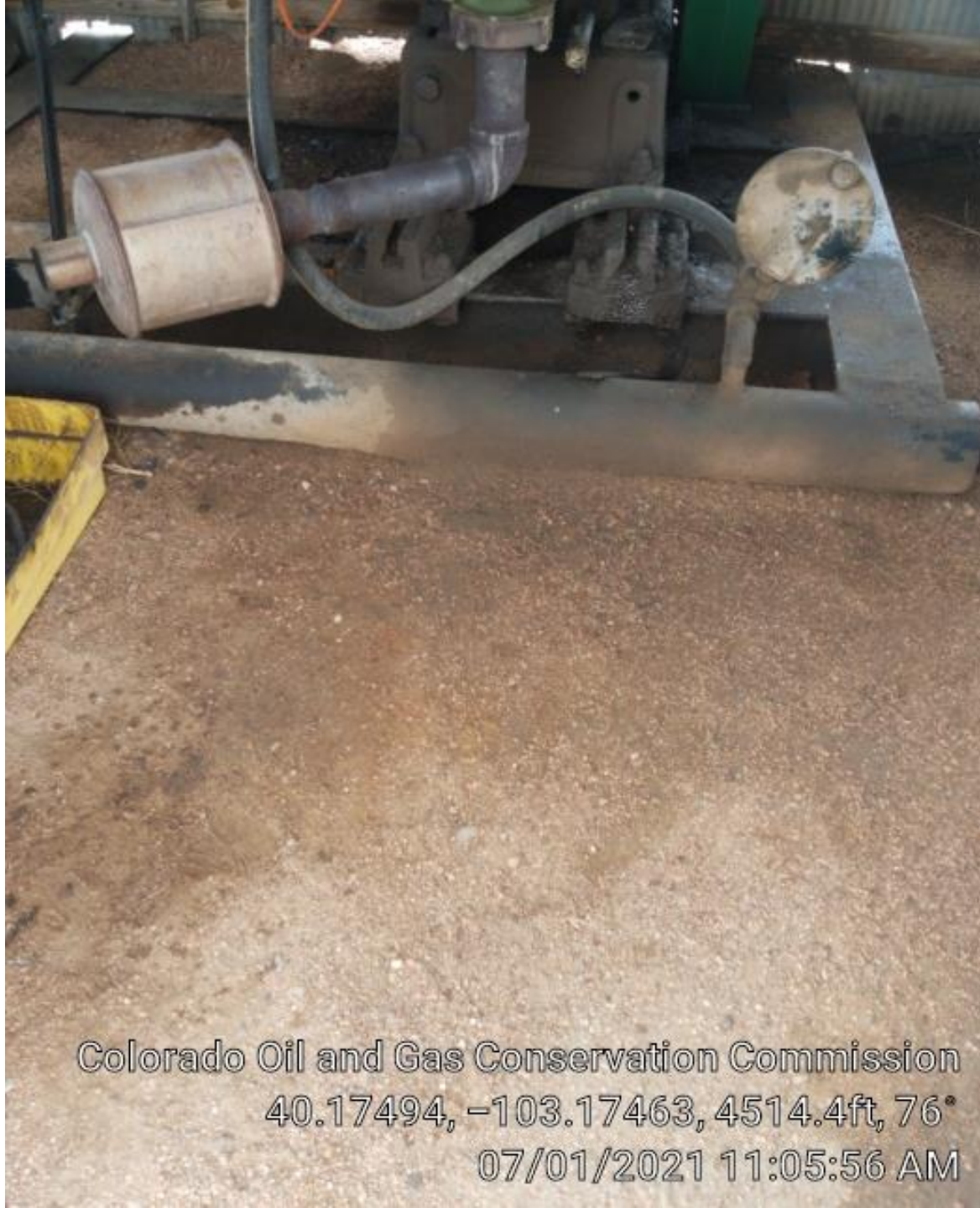
Engine oil on ground.

Colorado Oil and Gas Conservation Commission 40.17494, -103.17463, 4514.4ft, 76° 07/01/2021 11:05:56 AM