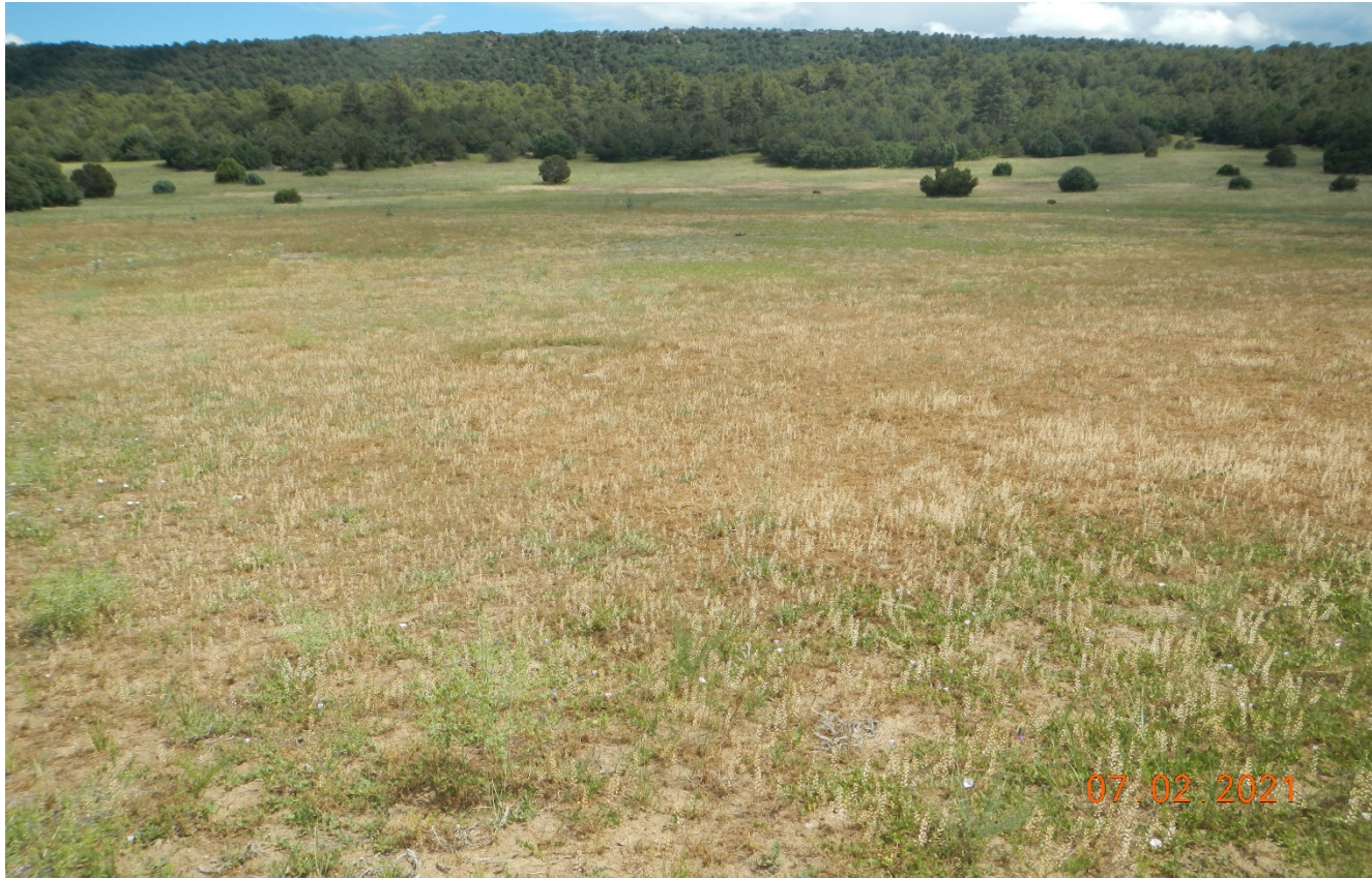
Photo 3. Facing south toward the location. The desirable vegetation has not re-established at the location and there are noxious weeds throughout the disturbed location.