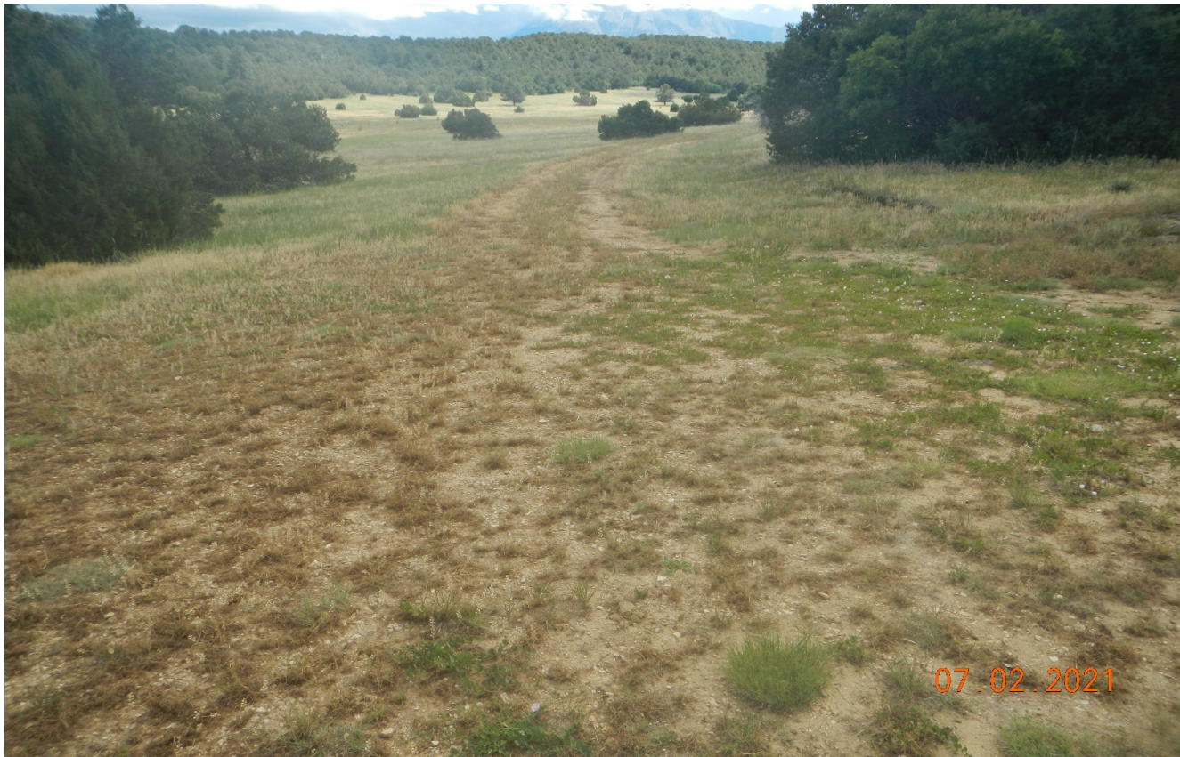
Photo 1. Facing southwest along the former access road. The road was not recontoured and reclaimed.