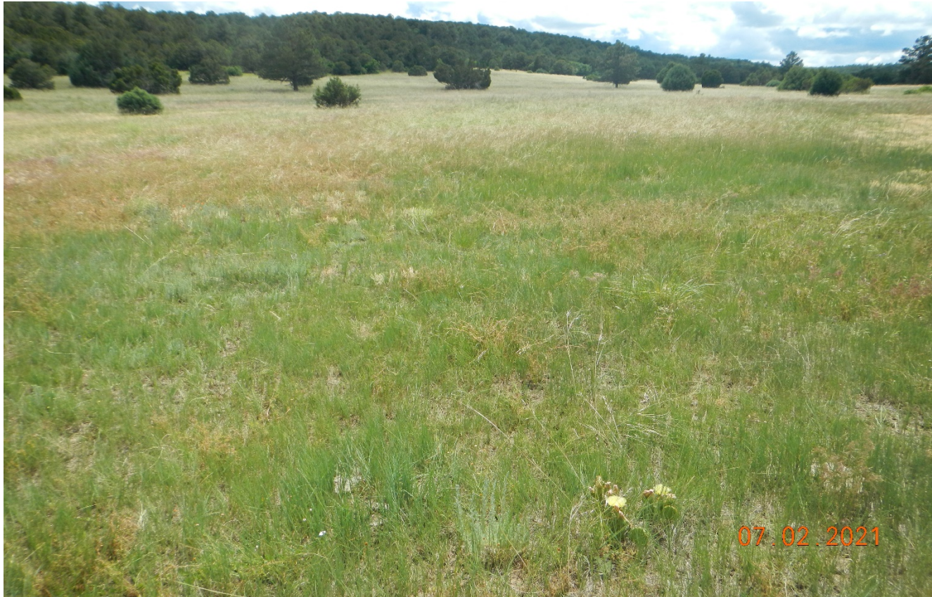
Photo 8. Facing southwest at the surrounding undisturbed vegetation which consists of Western wheat, Needle and thread grass, Sand drop seed, among other native species.