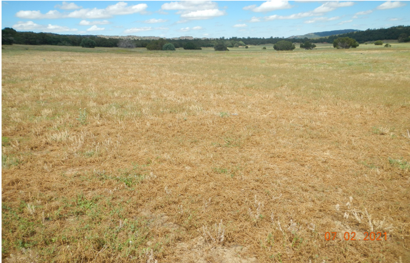
Photo 4. Facing east toward the location. The desirable vegetation has not re-established at the location and there are noxious weeds throughout the disturbed location.