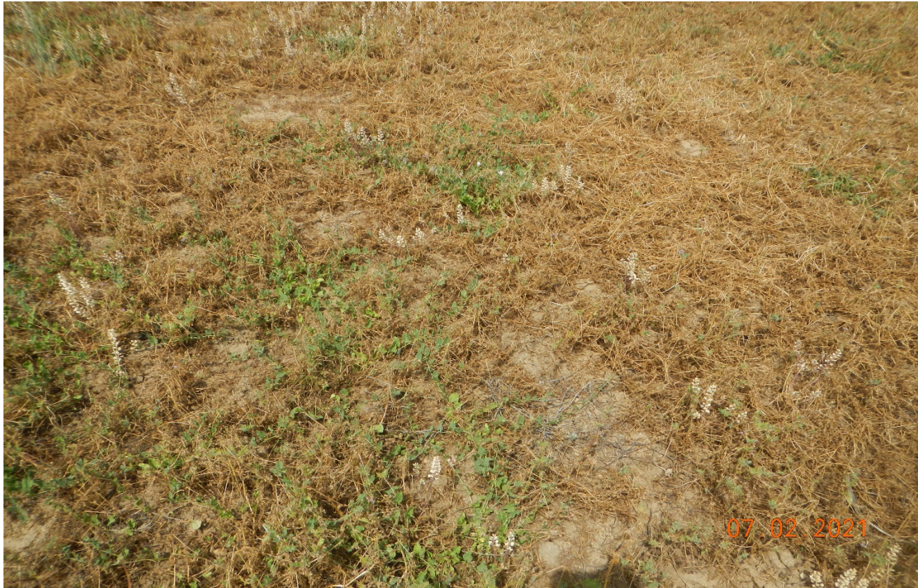
Photo 5. View of ground cover shows noxious weeds Redstem filaree and Field bindweed.