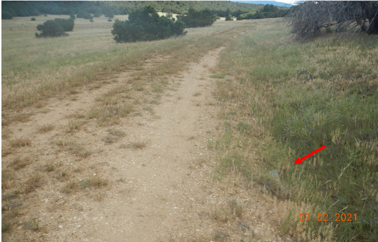
Photo 2. There is gravel and culverts that remain along the road . Arrow points to the culvert that remains.