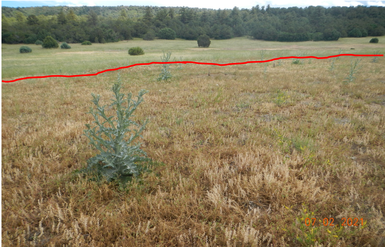
Photo 7. Facing south at the southern side of the location. Red outline shows the edge of disturbance with a change in vegetation off the location.