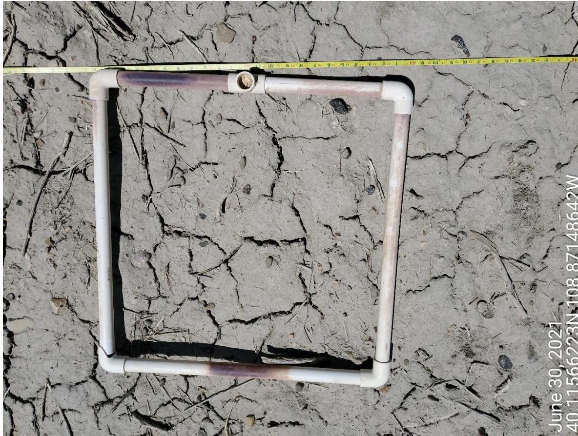
Photo 8: Photo shows soil surface for the 50 th point of the 1 st germination transect; desirable vegetative germination/establishment not observed, or negligible; approximately 1 seedling was observed for every 13 quadrats.