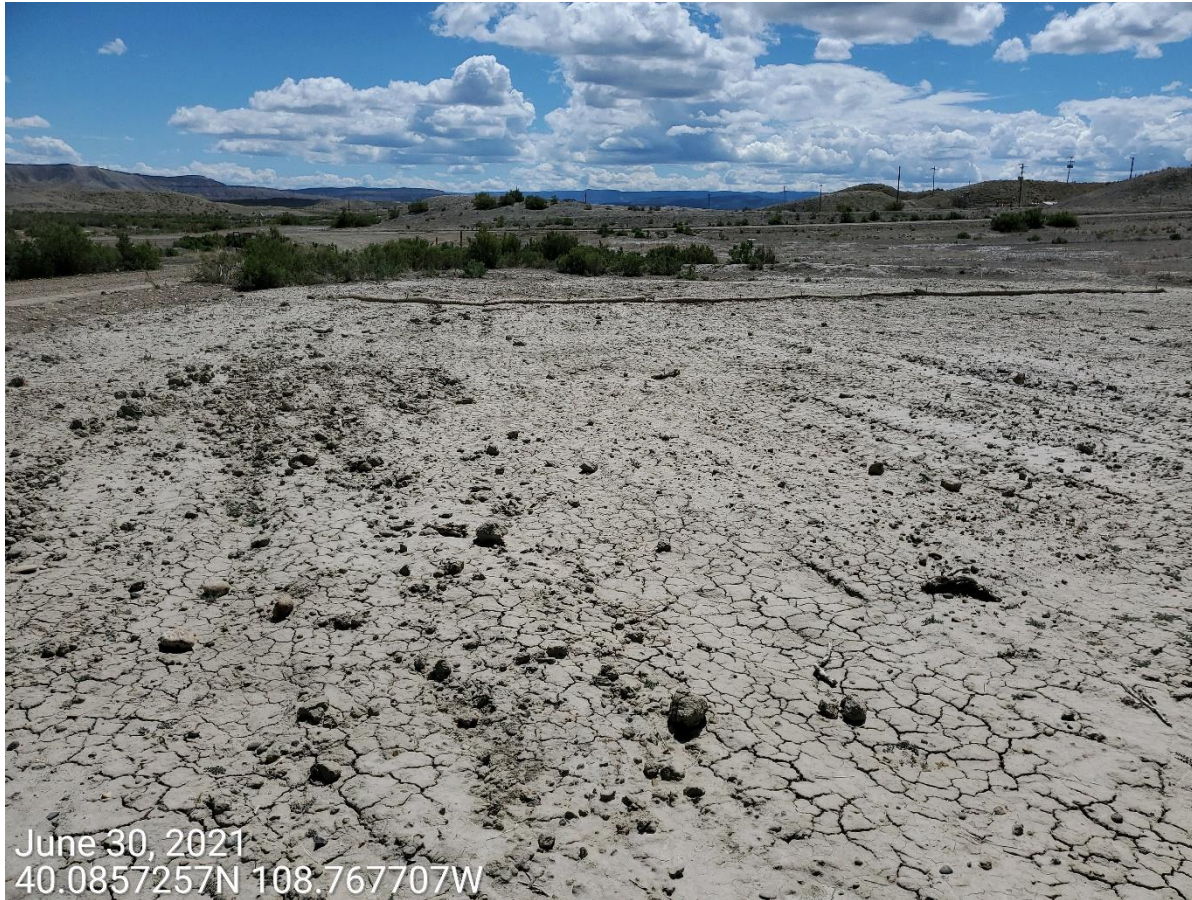
Photo 1: Photo taken from the north end of the Location, facing east. Photos 1-4 provide an overview of the Location from east, southeast, southwest to west.