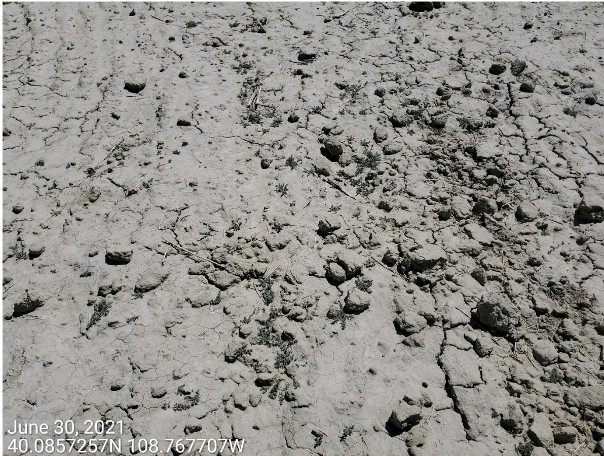
Photo 6: Photo shows example of noxious weed establishment observed on the Location.