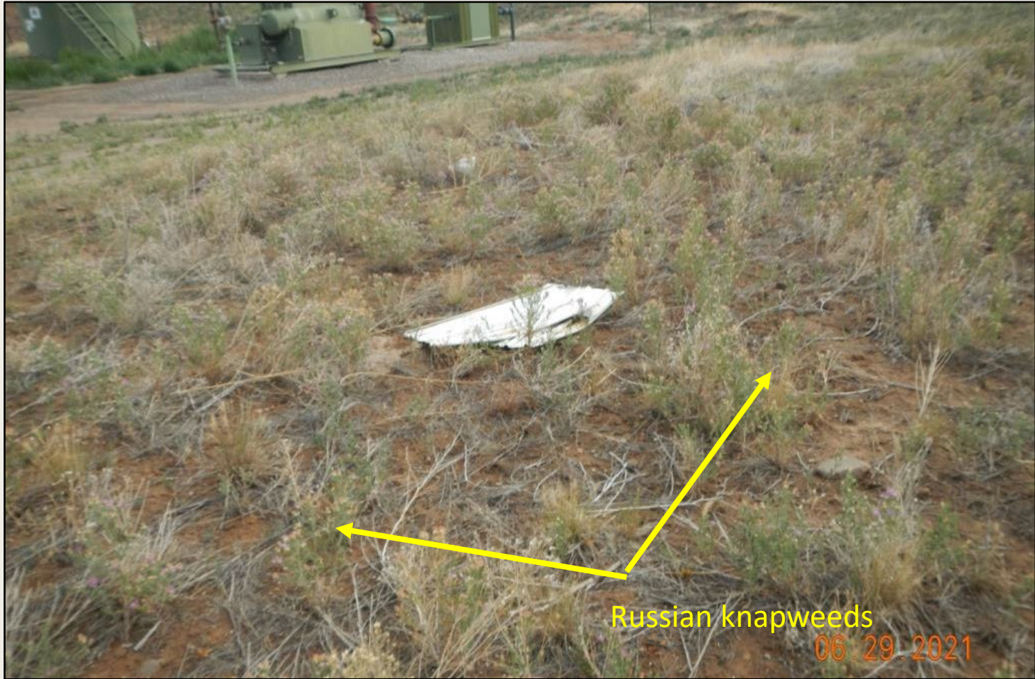
Photo 6. View of dense Russian knapweeds and debris within the southern project area. Approximately 5000 individuals observed.