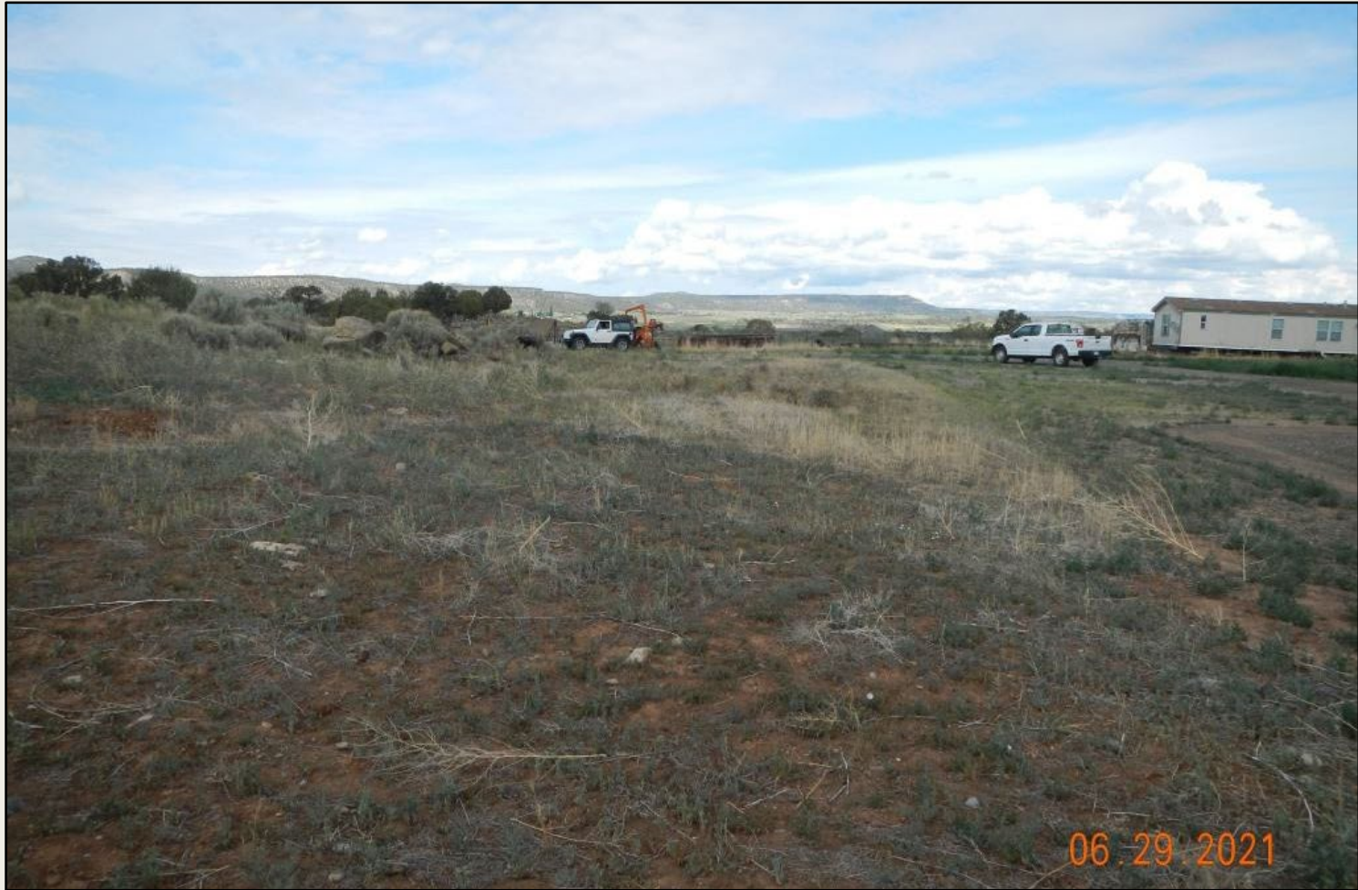
Photo 2. View of the southern project area from the southeastern corner facing westward. Vegetation here is largely comprised of weeds such as Russian knapweed, cheatgrass, and bindweed.