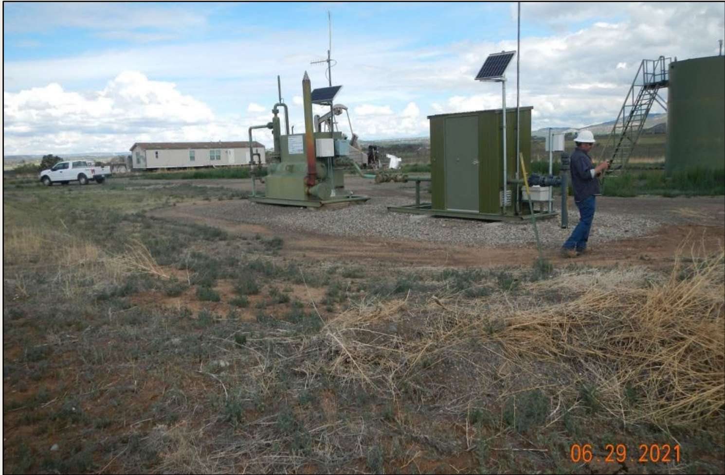
Photo 1. View the project area from the southeastern corner facing center.