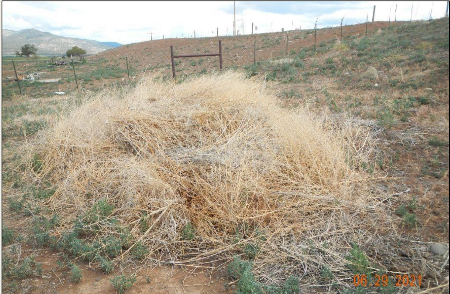
Photo 3. View of debris pile within the northeastern project area.