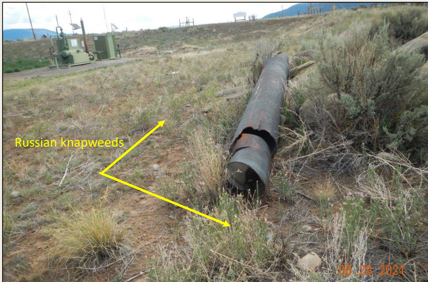
Photo 5. View of culvert debris and Russian knapweeds within the southern project area.