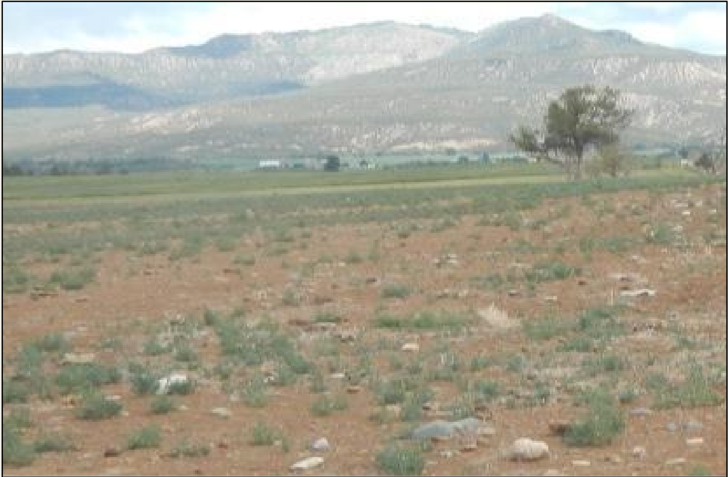
Photo 8. View of reference area comprised of open field, with grasses such as crested wheatgrass.