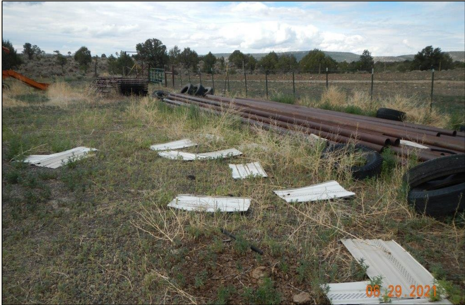
Photo 4. View of tubing, tires, and metal debris stored within the western project area.