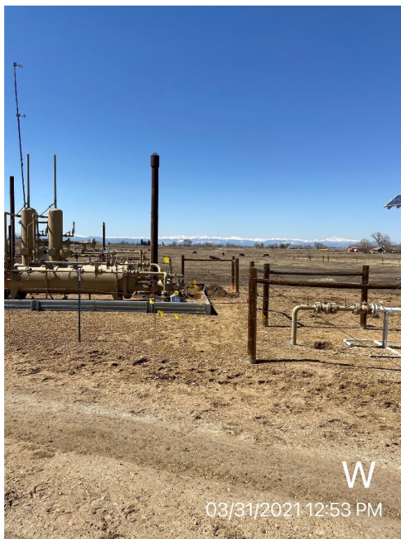
FL01 – Flowline Pothole Location