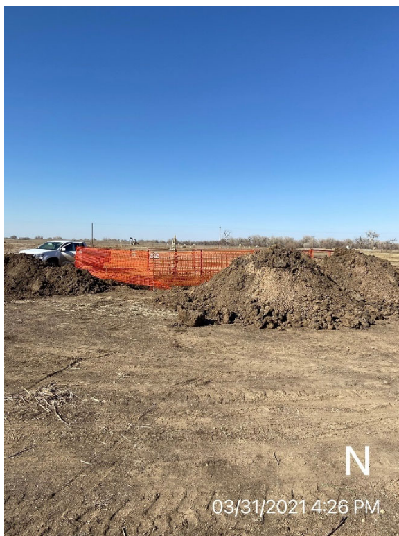
Riverbend 21-24 Wellhead Excavation