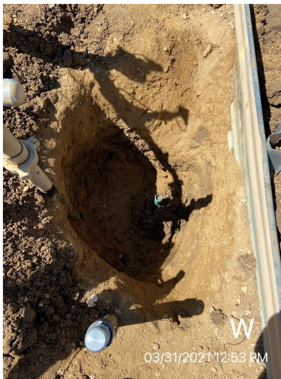
FL01 – Flowline Pothole (Close Up)