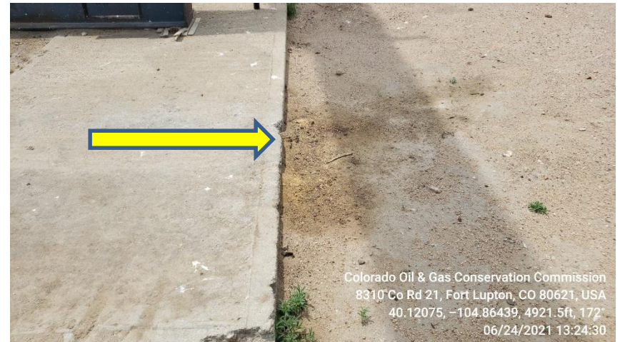
Photo 4 Stained soil by PJ concrete slab