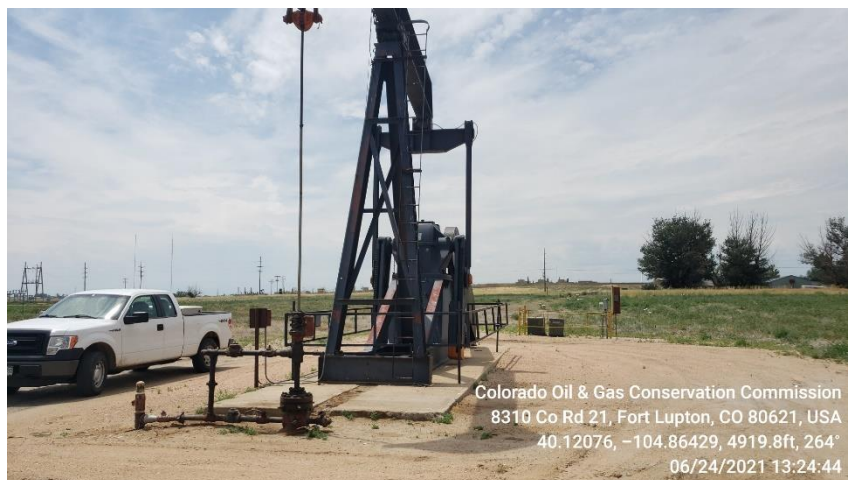
Photo 5 Pump Jack