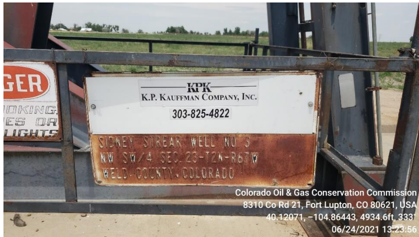
Photo 1 WH sign