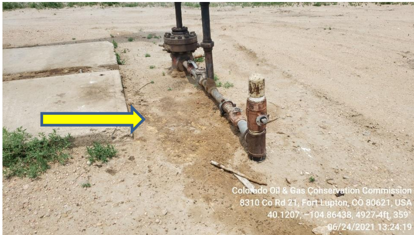
Photo 3 Stained soil