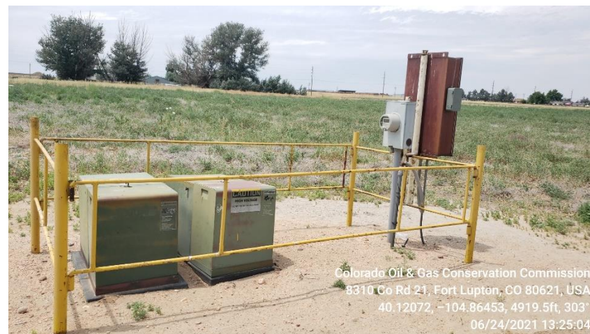
Photo 6 ancillary equipment