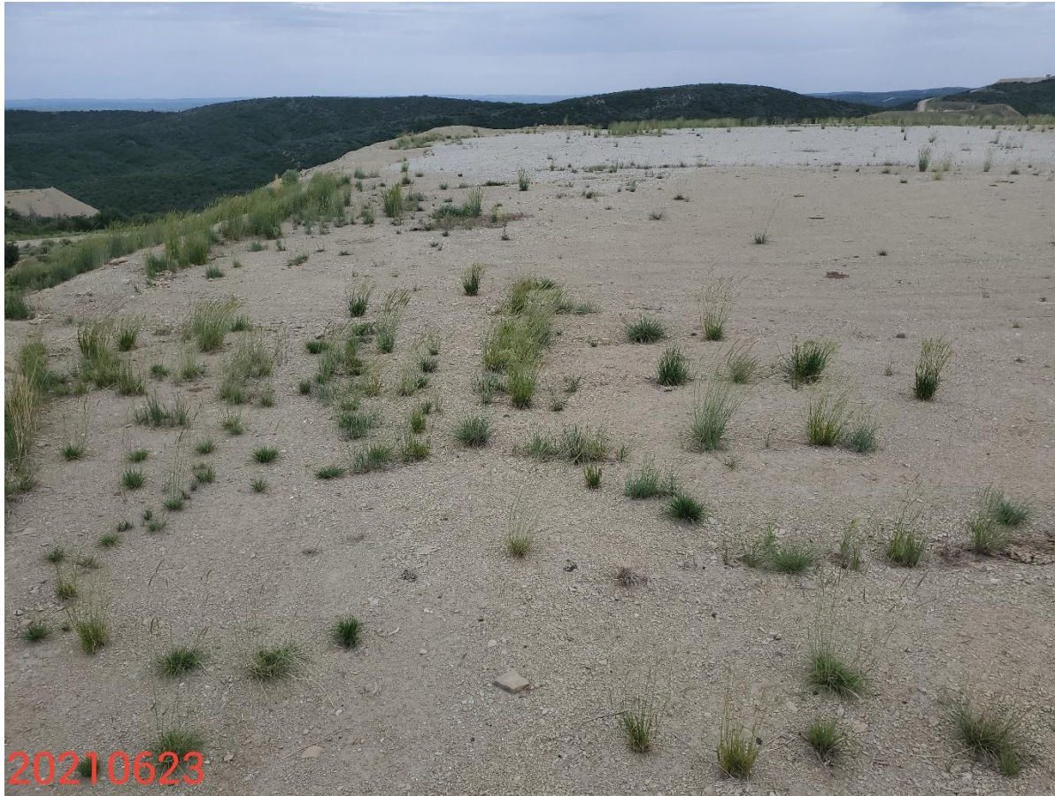
Photo 14: Photo taken from the southeast end of the Location, facing west. Photos 14-16 provide an overview of the Location from west, northwest to north. Photos show interim reclamation of areas not needed for production has not been performed in accordance with 1003 Rules and Corrective actions.