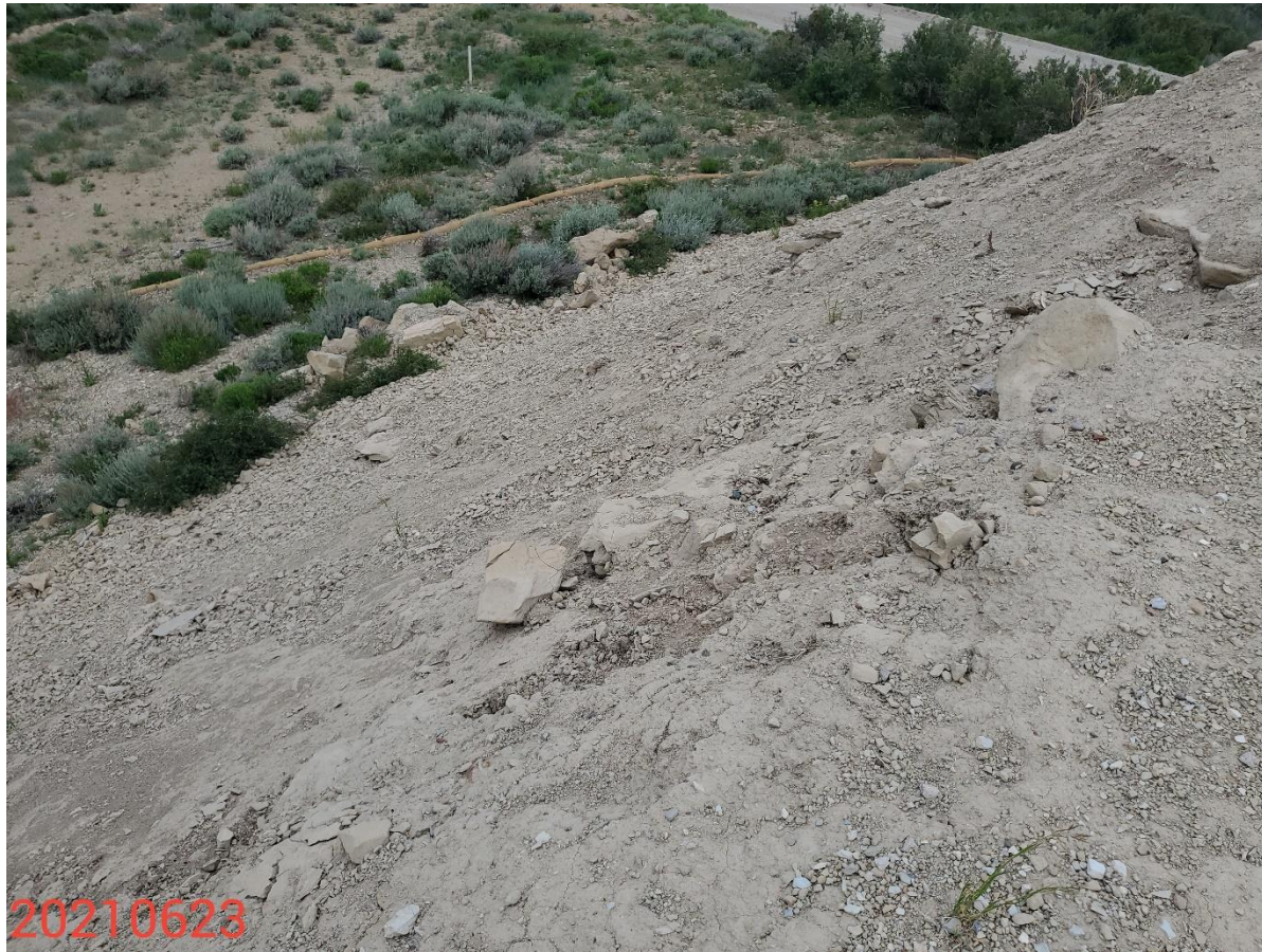
Photo 11: Photo taken from the south end of the Location, facing west. Photos shows example of slopes where BMPs remain missing or insufficient/inadequate to protect and stabilize the slopes of the Location.