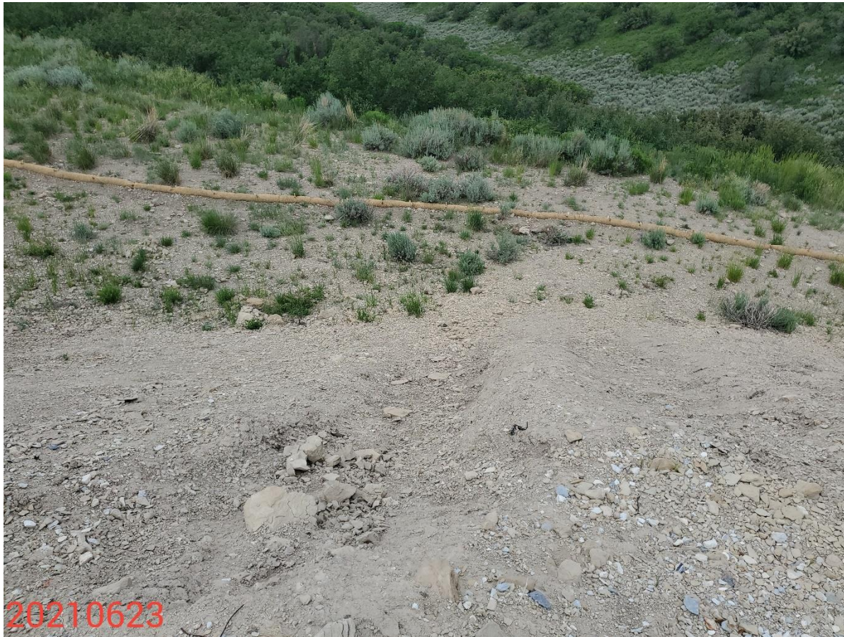
Photo 12: Photo taken from the south end of the Location, facing south. Photos shows example of slopes where BMPs remain missing or insufficient/inadequate to protect and stabilize the slopes of the Location.