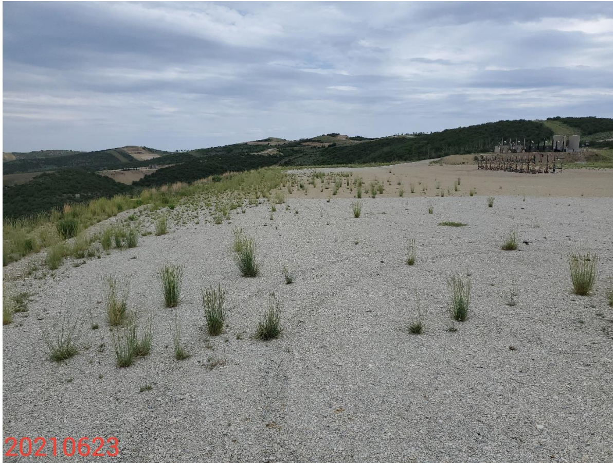
Photo 6: Photo taken from the southwest end of the Location, facing north. Photos 6-8 provide an overview of the Location from north, northeast to east. Photos show interim reclamation of areas not needed for production has not been performed in accordance with 1003 Rules and Corrective actions.