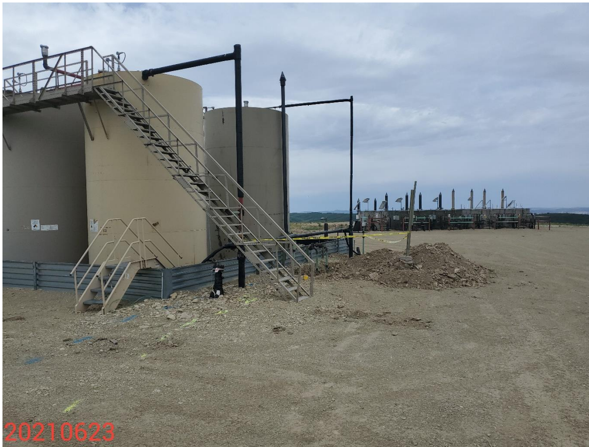
Photo 18: Photo of the tank battery on the southwest end of the Location. See inspection #701101420 for corrective actions regarding signage.