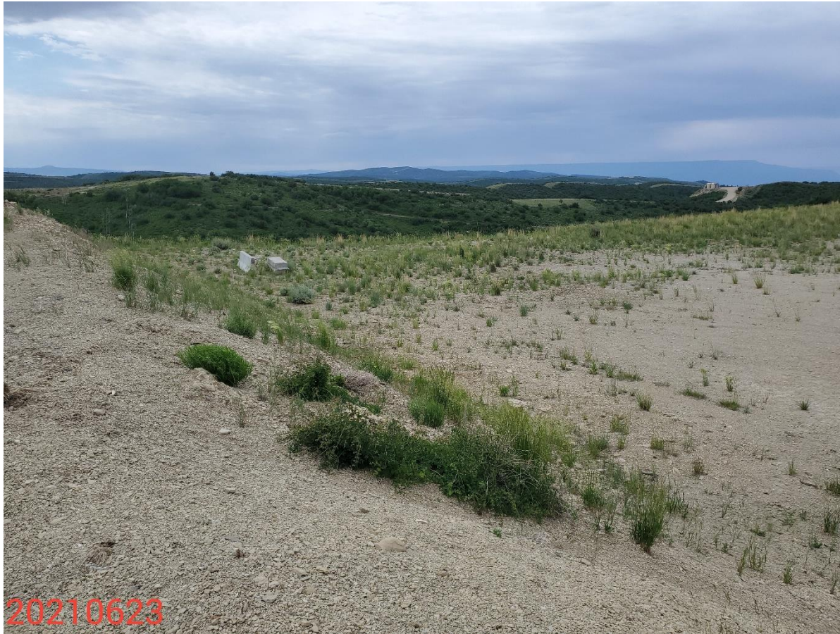
Photo 2: Photo taken from the North end of the Location facing southeast. Photos 2-5 provide an overview of the Location from southeast, south, southwest to west. Photos show interim reclamation of areas not needed for production has not been performed in accordance with 1003 Rules and Corrective actions.