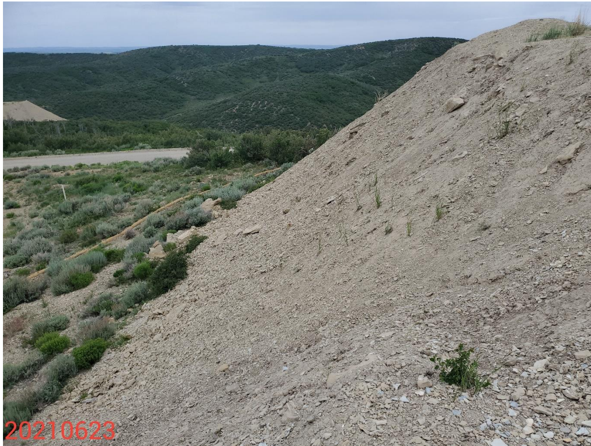
Photo 13: Photo taken from the south end of the Location, facing west. Photos shows example of slopes where BMPs remain missing or insufficient/inadequate to protect and stabilize the slopes of the Location.