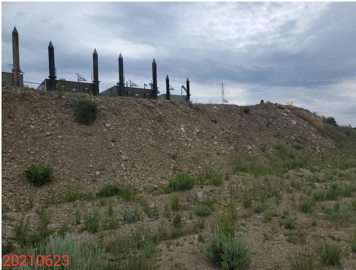
Photo 17: Photo taken from the north end of the Location, facing northeast. Photos shows example of slopes where BMPs remain missing or insufficient/inadequate to protect and stabilize the slopes of the Location.