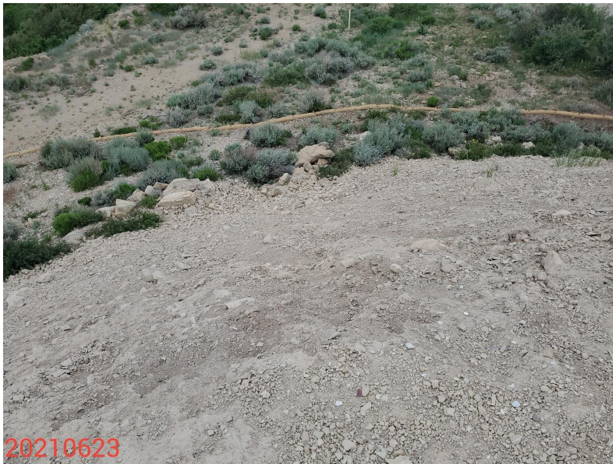
Photo 10: Photo taken from the south end of the Location, facing south. Photos shows example of slopes where BMPs remain missing or insufficient/inadequate to protect and stabilize the slopes of the Location.