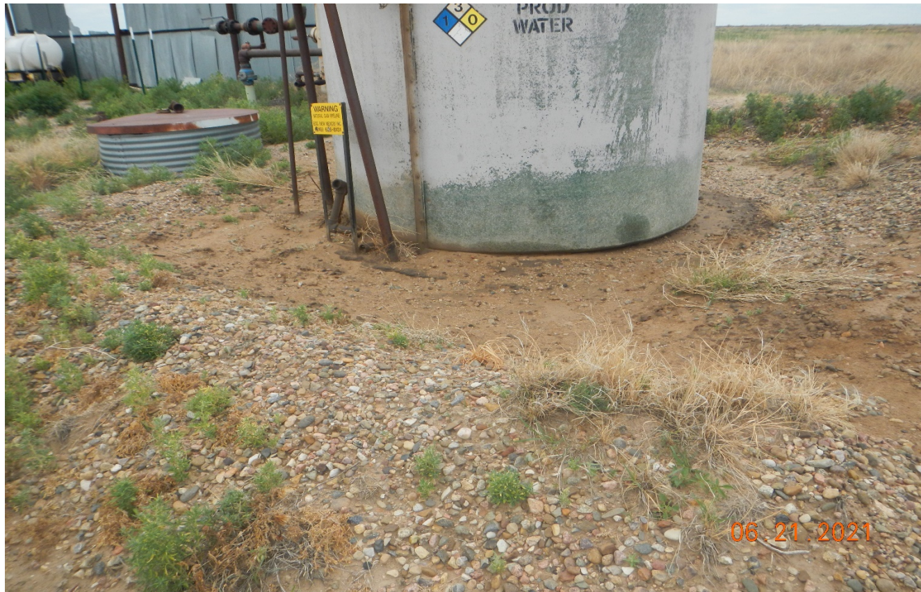
Photo 2. There is oil stained soil near the Produced Water tank. The tank is labeled produced water but appeared to contain oily fluid. Netting was over the top of tank. Additionally the berm does not appear to be sufficient to contain a spill.