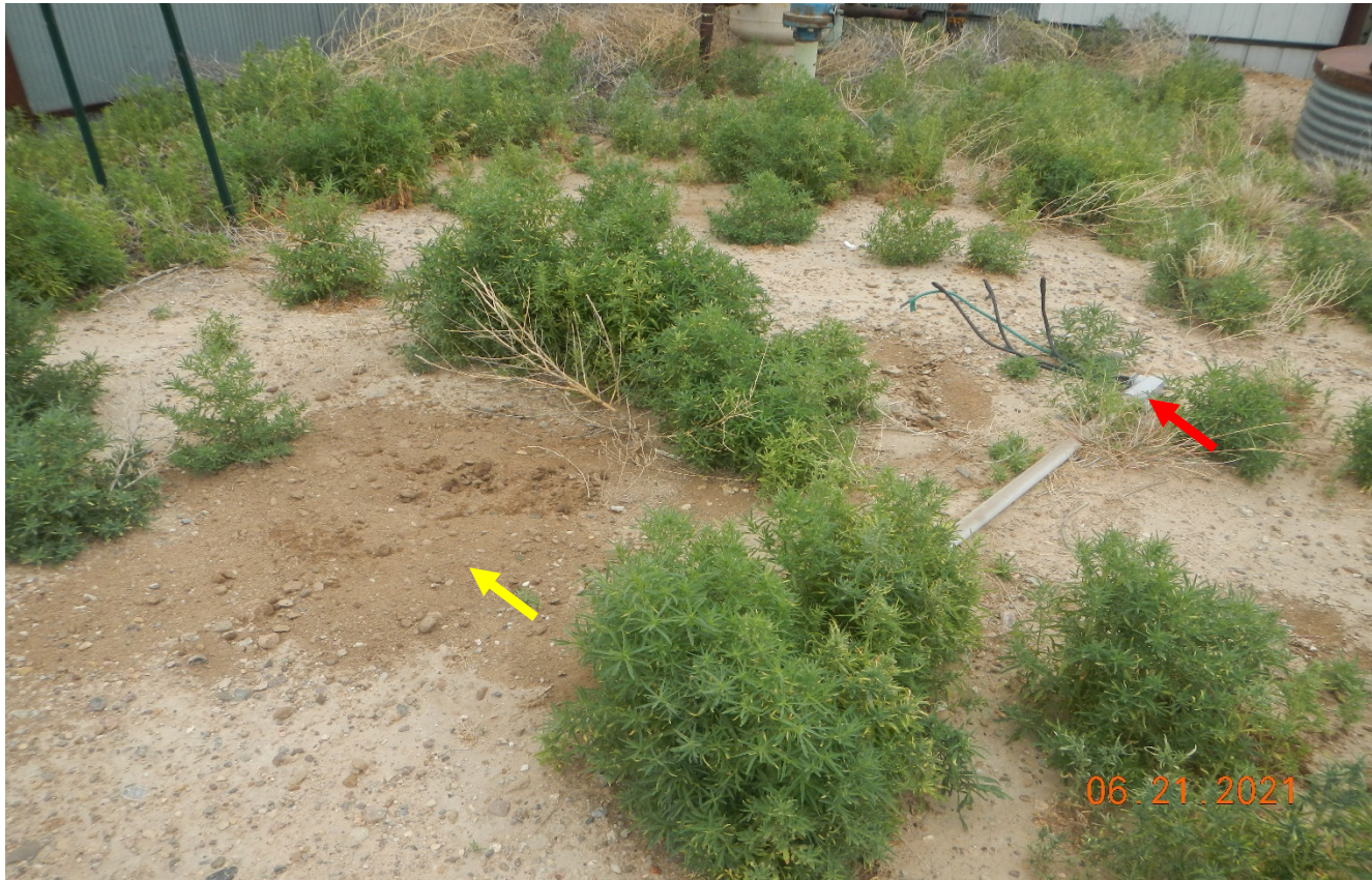
Photo 3. There is an exposed electric utility that remain at red arrow. There is oil stained soil shown at yellow arrow.