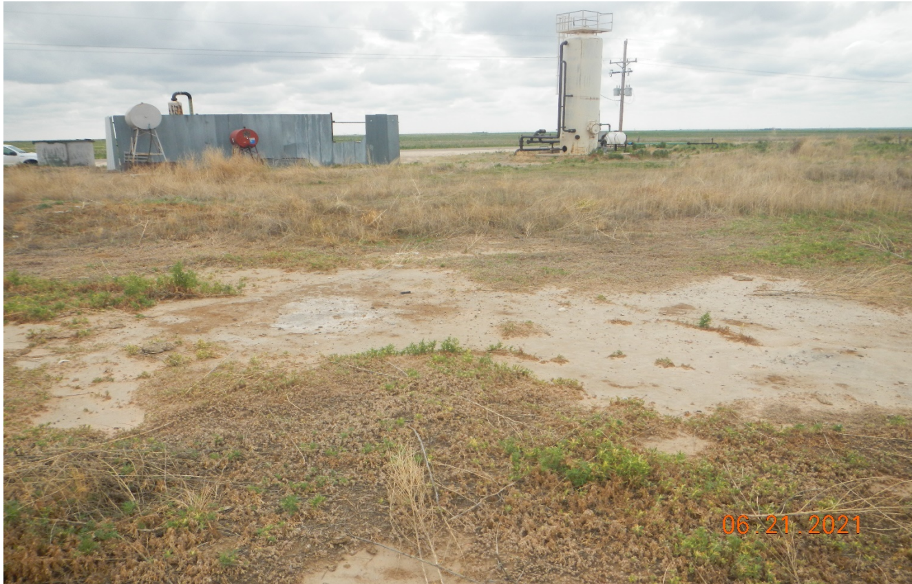
Photo 9. Facing southeast behind the compressor facility. There is undesirable weeds throughout this disturbed area which weeds will need to be controlled and the disturbance area reclaimed.