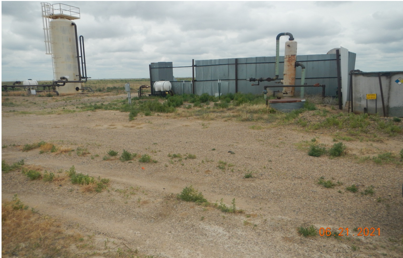
Photo 1. Facing southwest toward the location which is adjacent to County Rd. 44.