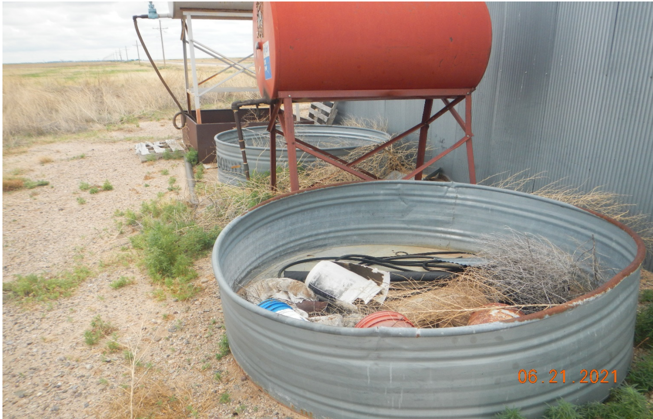
Photo 7. On the backside of the metal panels is unused equipment. There is various supplies and waste stored in the tanks. Unused equipment/supplies has not been removed. Previous corrective action was not performed.