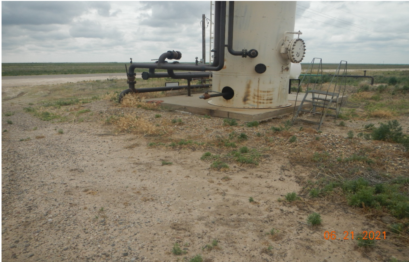
Photo 6. The berm around the tank vessel is inadequate in size and has animal burrows in it. The berm has not been repaired since previous inspection.