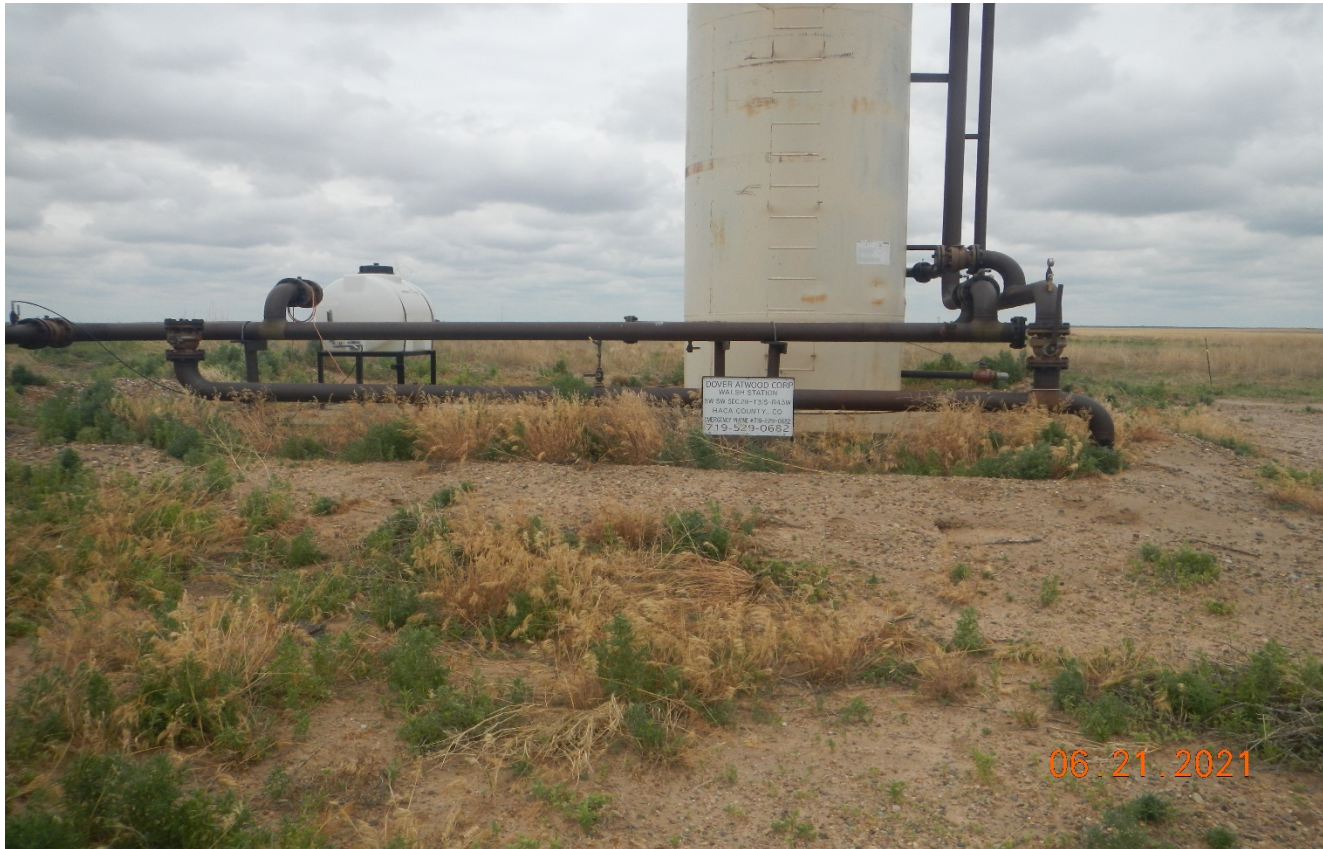
Photo 5. The facility sign is posted but contains incomplete and inaccurate information. Previous corrective action was not performed.