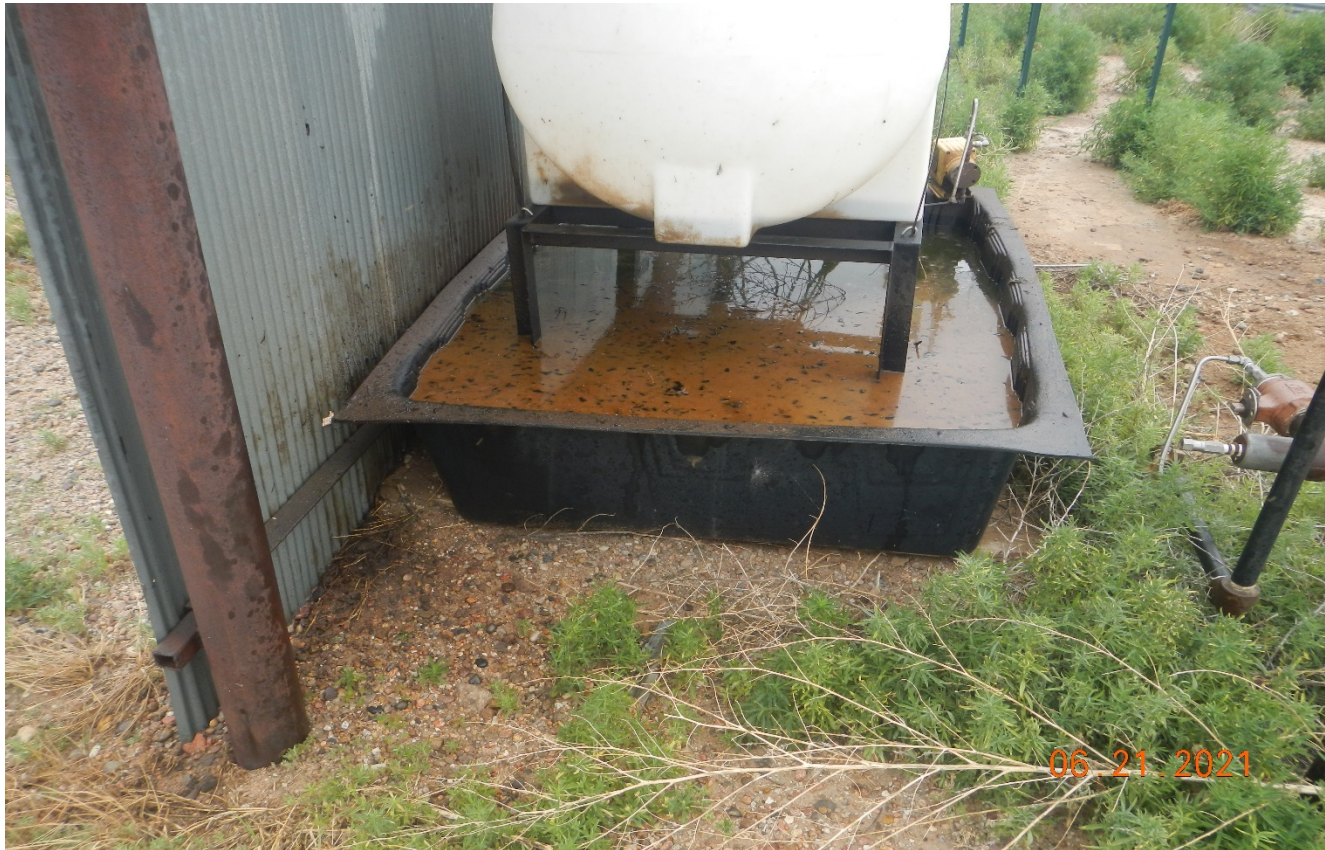
Photo 4. There is oily waste inside this containment which is near the top of the containment and appears to have spilled over. The oily waste has not been removed and properly disposed since last inspection. A dead bird was previously observed in the oily fluid.