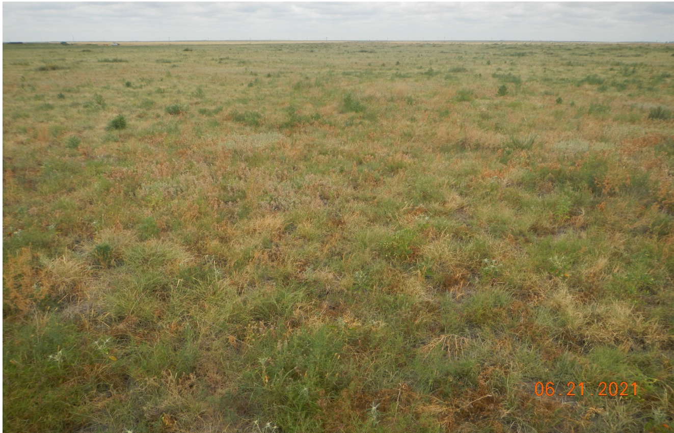
Photo 11. Facing west toward the surrounding undisturbed pasture which consists of desirable native vegetation.