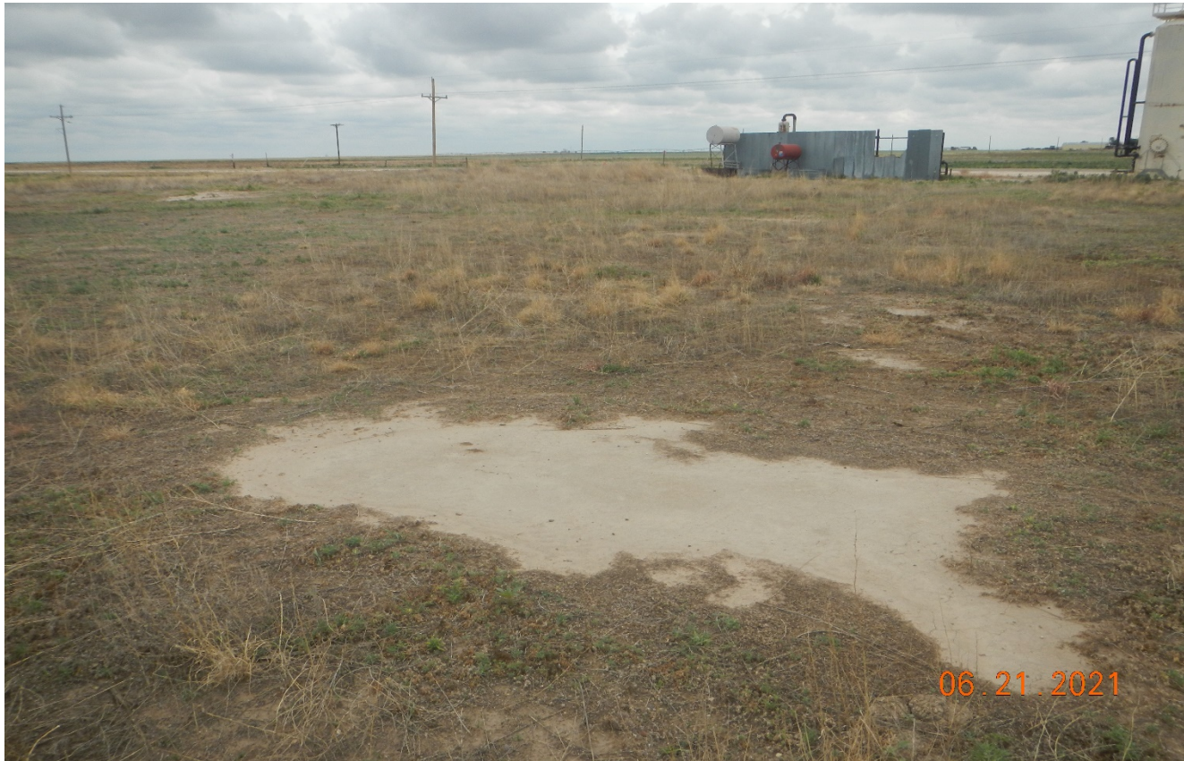
Photo 10. Facing northeast behind the compressor facility. There is undesirable weeds throughout this disturbed area which weeds will need to be controlled and the disturbance area reclaimed.