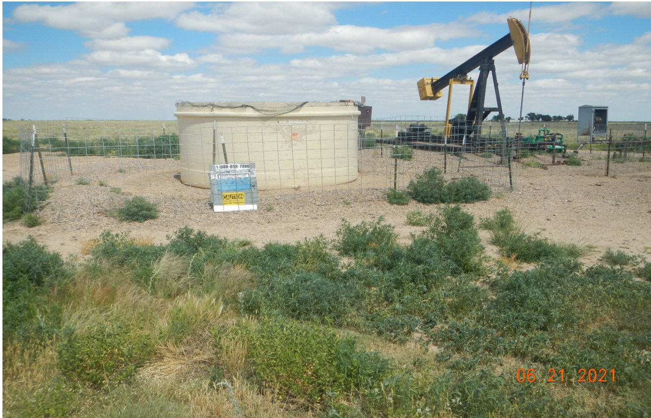
Photo 1. The well sign does not comply with 605. Incorrect Operator Emergency number and missing information. Name was updated. Missing tank NFPA labeling and INFO.