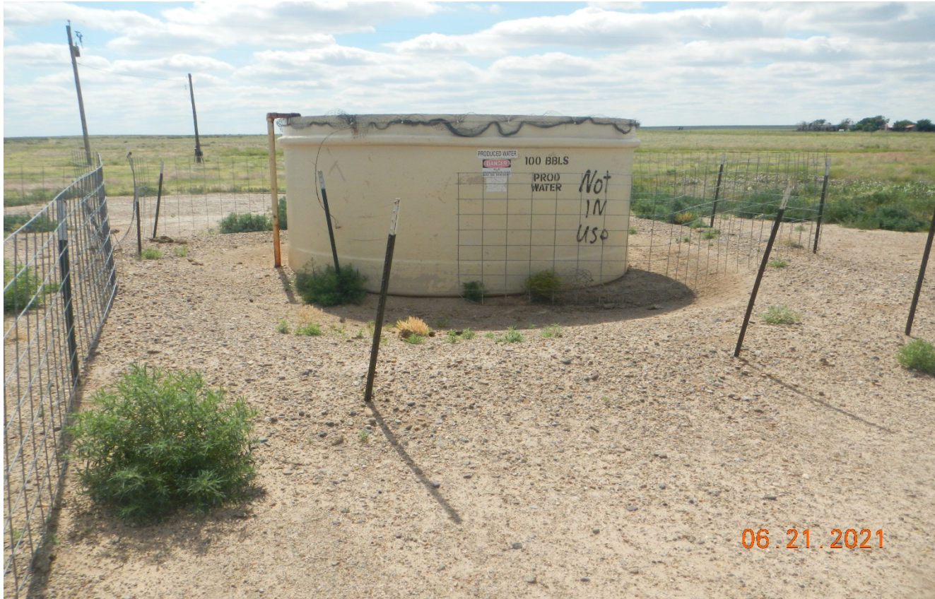
Photo 3. The tank is marked as not in use and labeled Produced Water. Next photo shows fluids inside the tank which apparently the tank is in use. Secondary containment is inadequate to contain 150% of the volume of the tank.