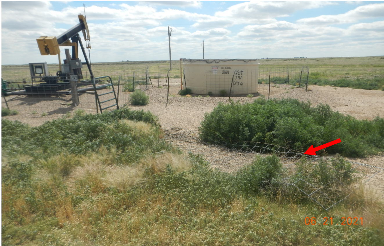
Photo 5. There is a metal panel laying on the ground.