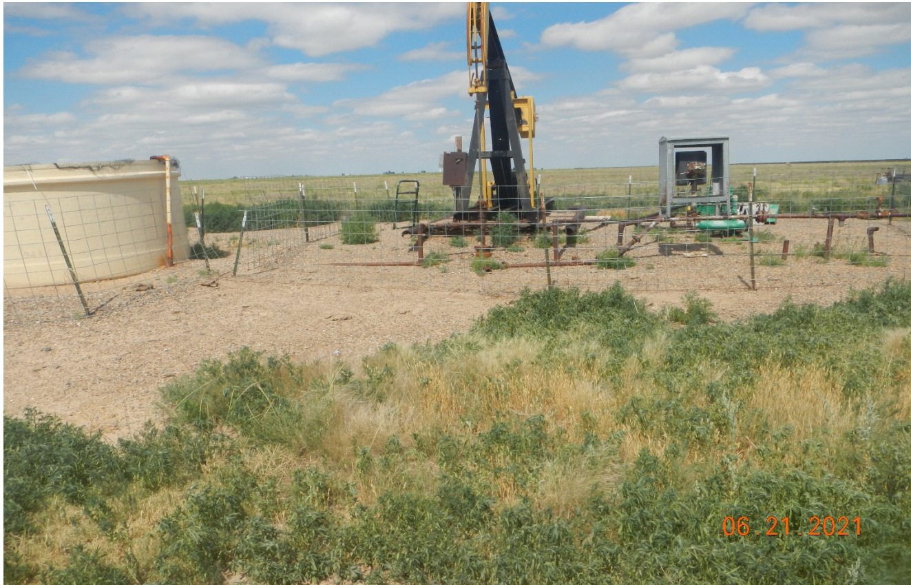
Photo 2. The fencing around the pump jack has been fixed.