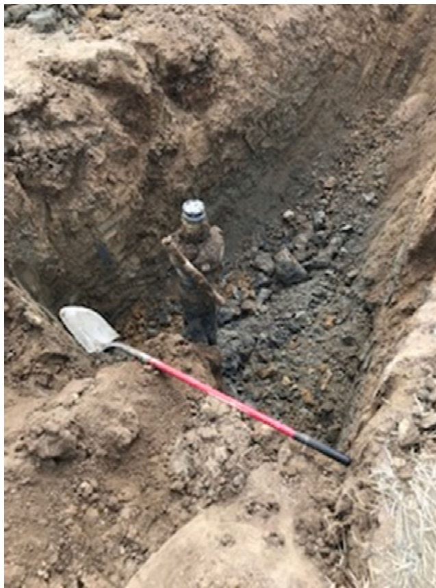
2 – Green #2 wellhead in excavation prior to cut and cap; note gray, stained soil