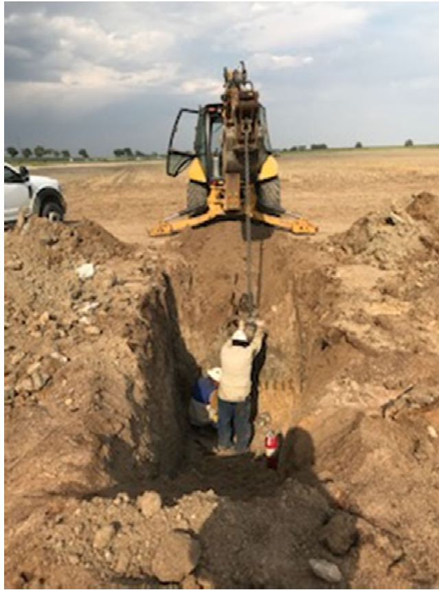
3 – Green #2 wellhead; cutting in process – looking northeast