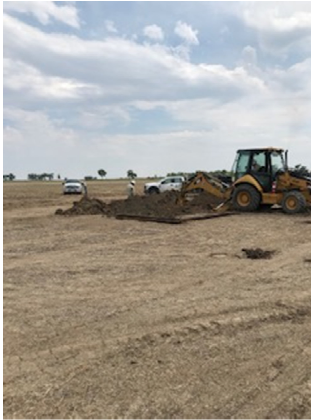
1 – Green #2 wellhead abandonment excavation – looking southeast