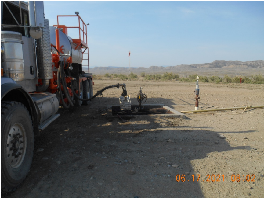
Temporarily Abandoned Producing wellhead during MIT.