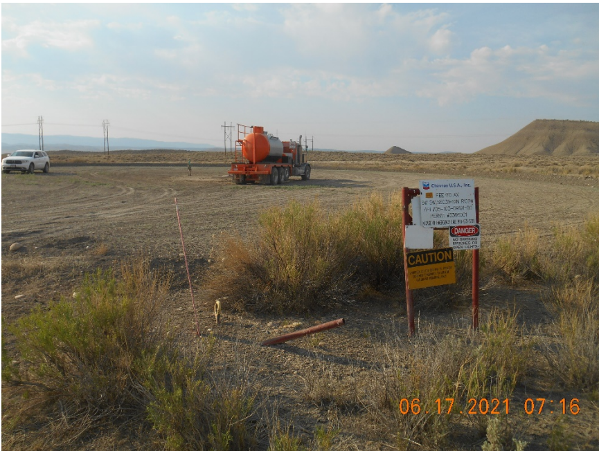
Injection wellhead during MIT. Temporarily Abandoned