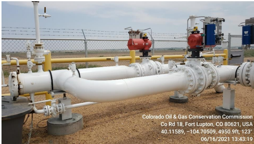
Photo 21 pig station