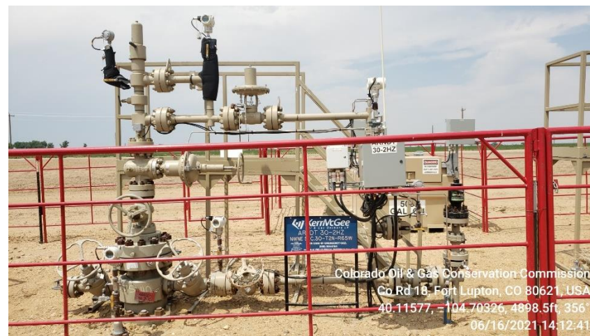
Photo 2 WH/sign