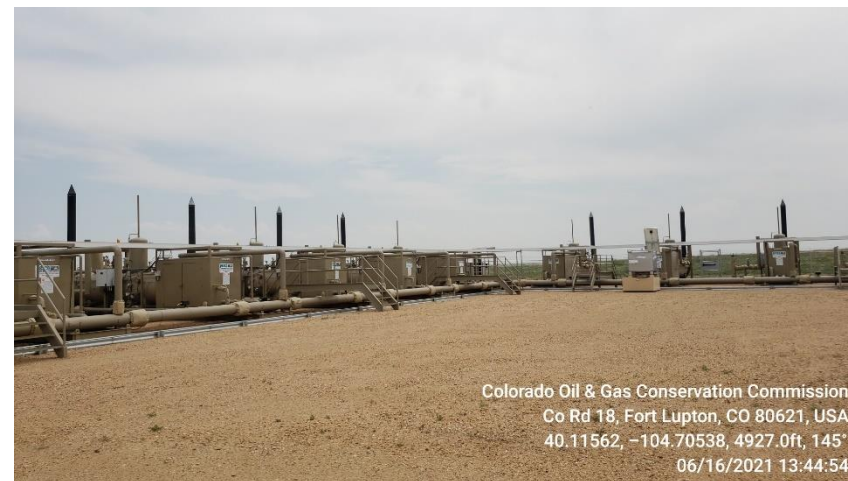
Photo 14 Horizontal Heated Separators