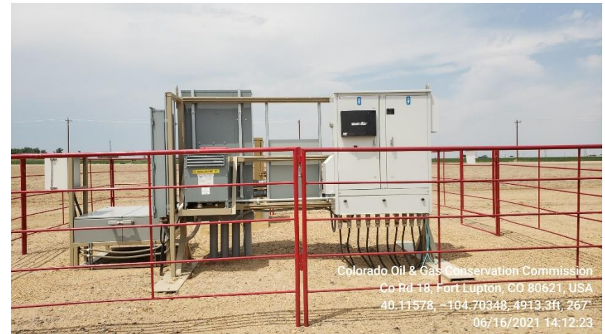
Photo 22 ancillary equipment