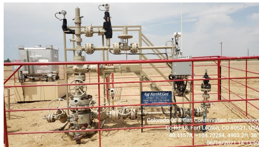
Photo 9 WH/sign