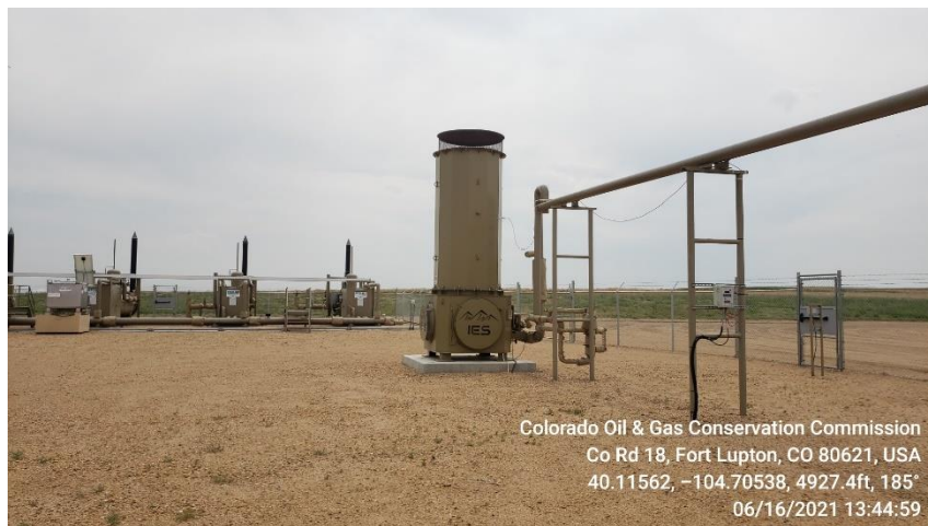
Photo 13 ECD