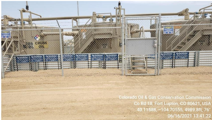
Photo 11 TB signs