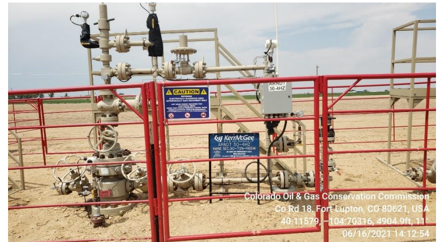
Photo 4 WH/sign