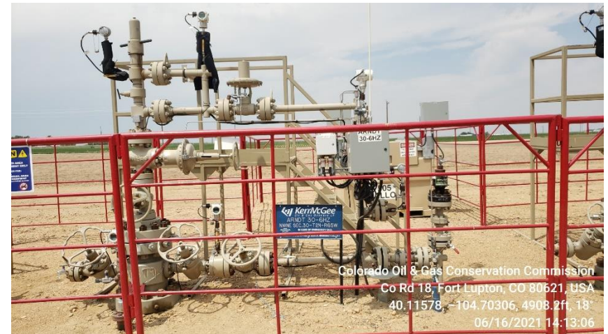
Photo 5 WH/sign