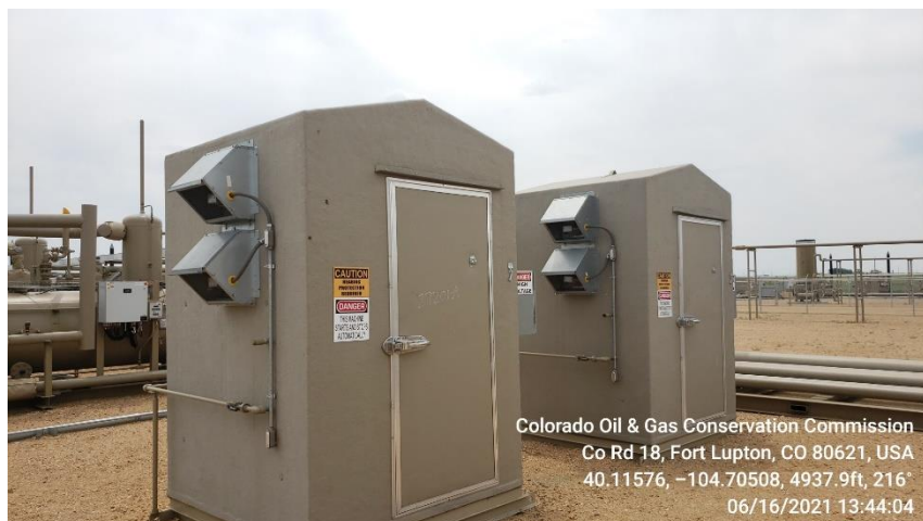
Photo 17 Compressors