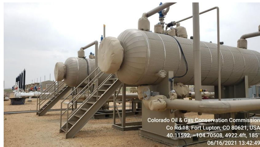
Photo 18 FWKOs