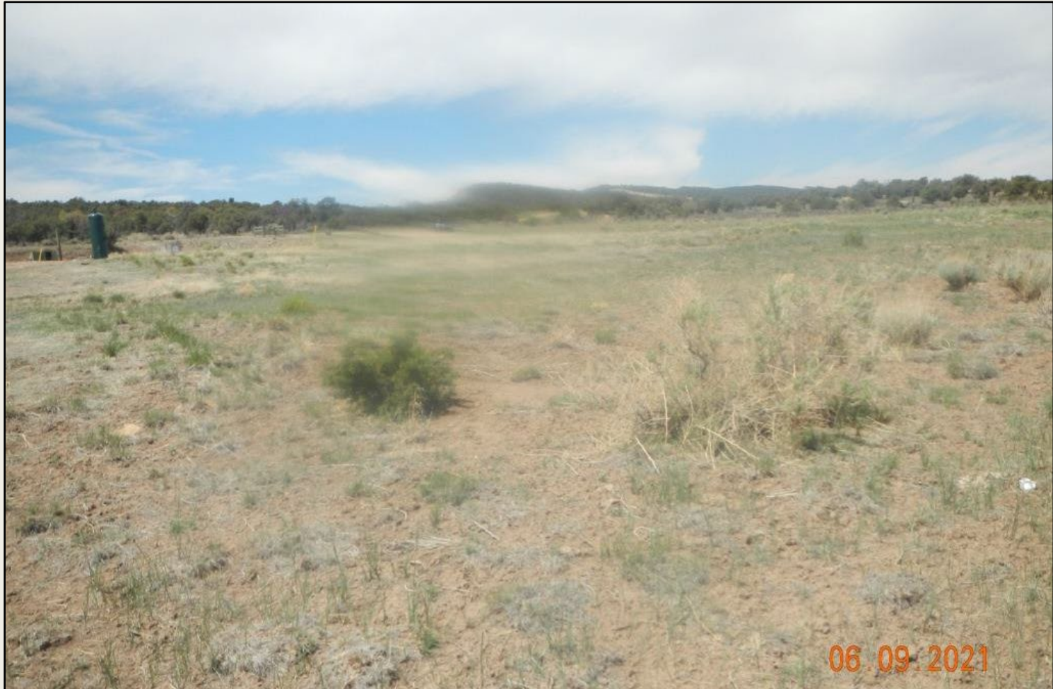
Photo 3. View of the northwestern project area from the northern edge facing westward. Revegetation is progressing within this portion of the project area with western wheatgrass, fourwing saltbush, and James galleta.