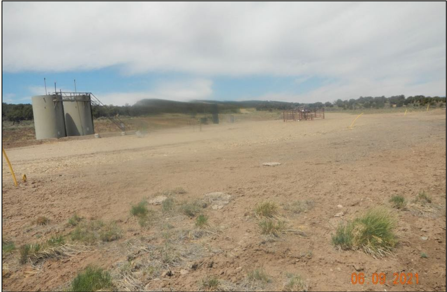
Photo 1. View the project area from the northeastern edge facing center.