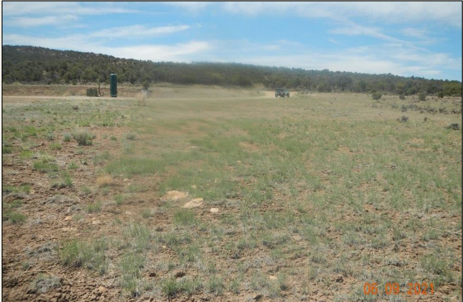
Photo 4. View of the western project area from the northwestern corner facing southward.