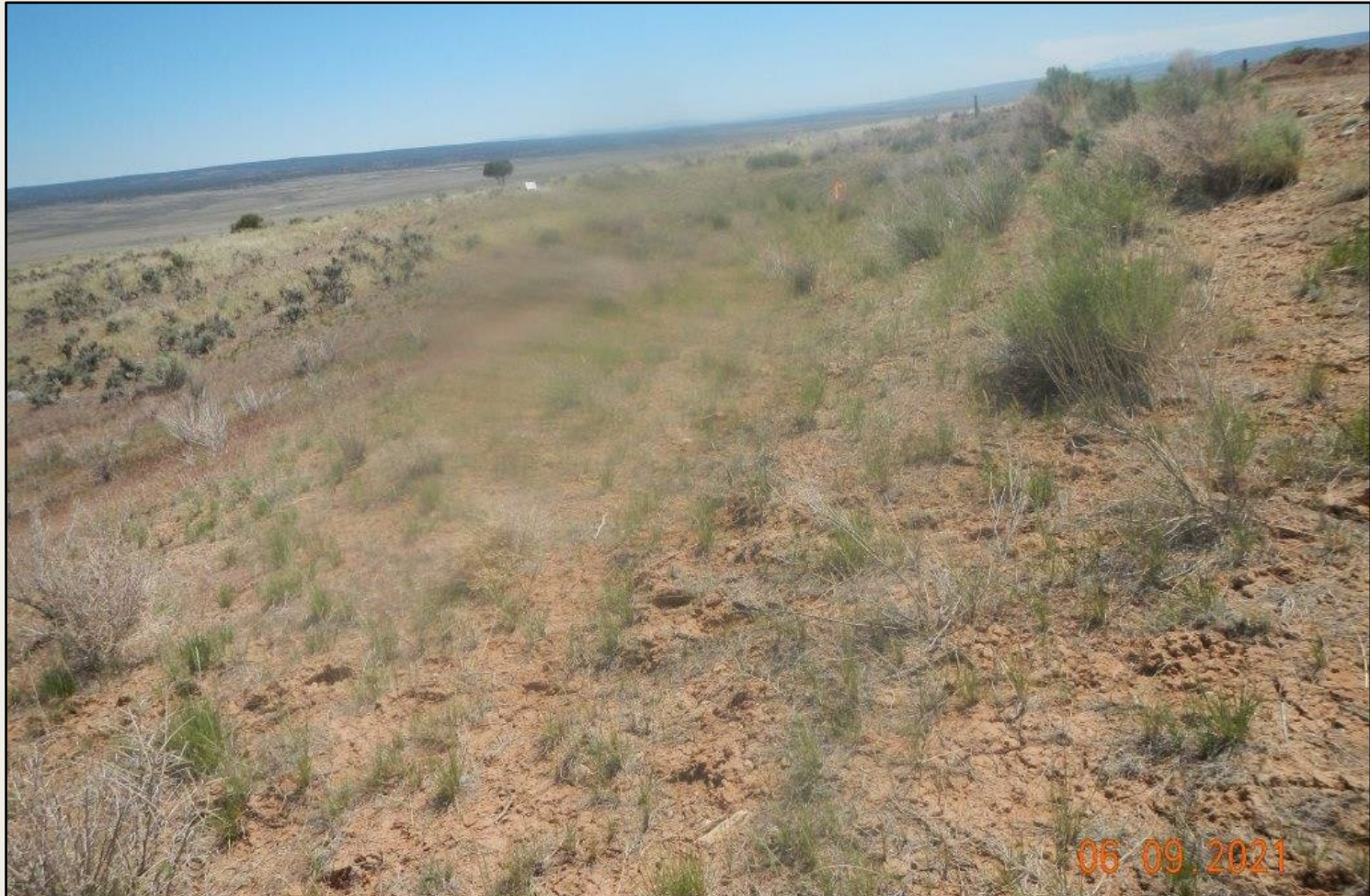
Photo 3. View of the northern project area from the northwestern corner facing eastward.