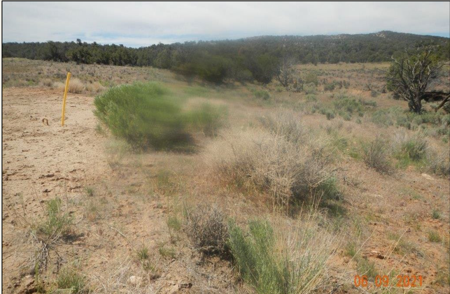
Photo 2. View of the western project area from the northwestern corner facing southward. Revegetation is progressing with western wheatgrass, rubber rabbitbrush, fourwing saltbush, and squirreltail.