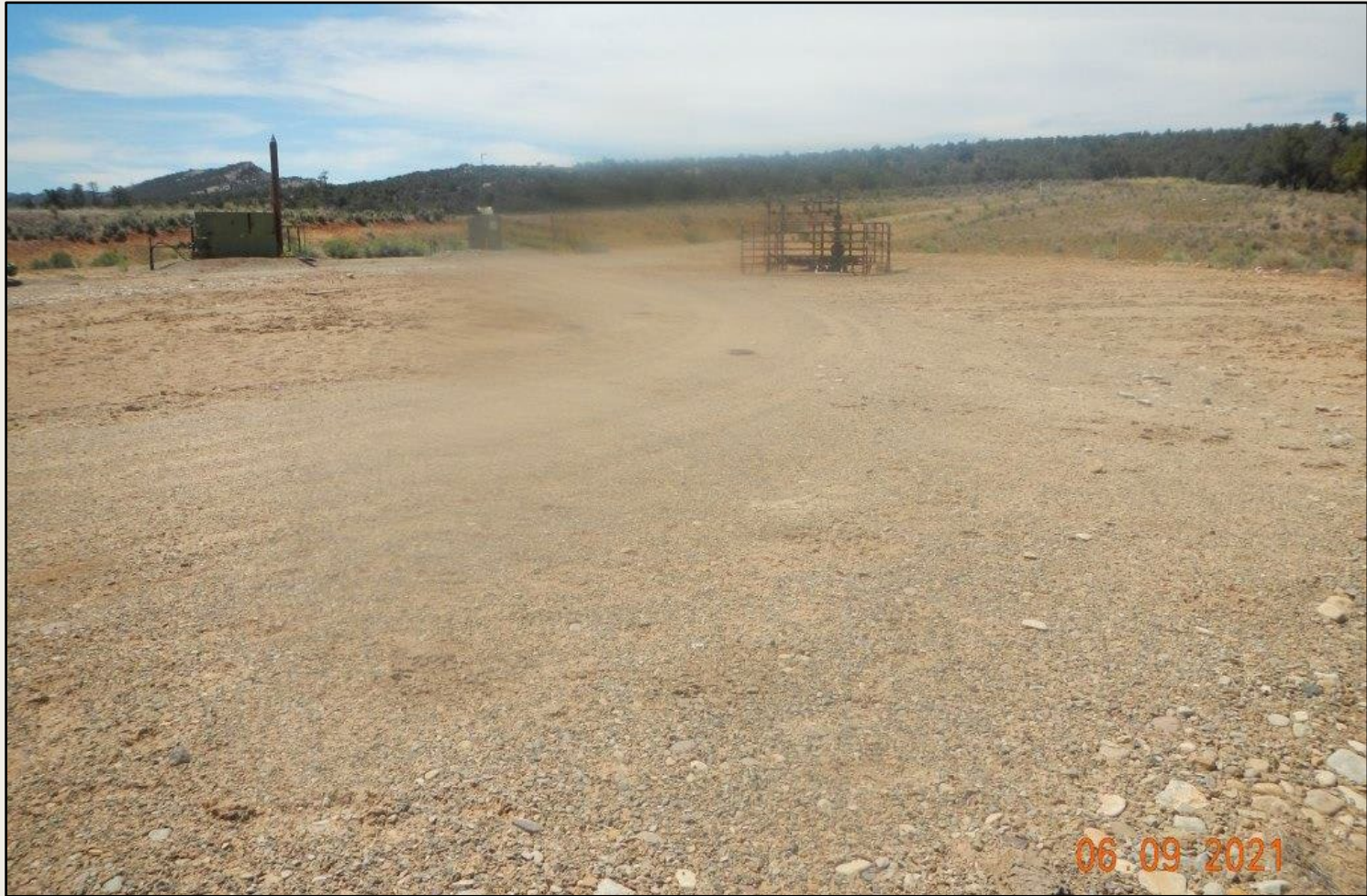
Photo 1. View the project area from the northern project area facing center.