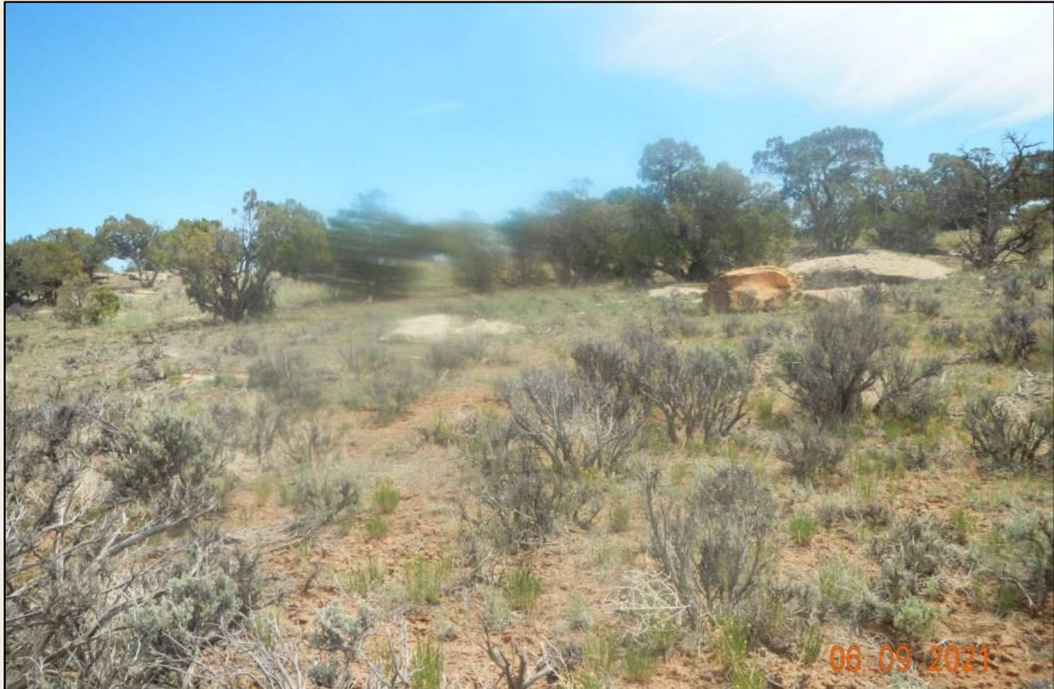
Photo7. View of reference area comprised of pinyon and juniper woodland mixed with sagebrush, James galleta, snakeweed, and goldenasters.