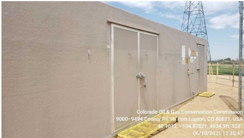
Photo 9 LACT house