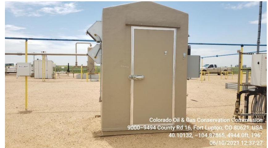
Photo 12 Compressor