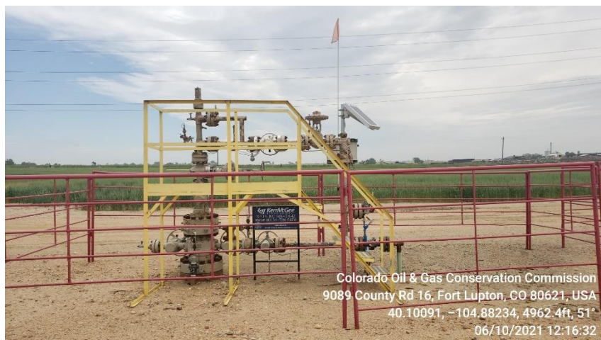
Photo 5 WH/sign