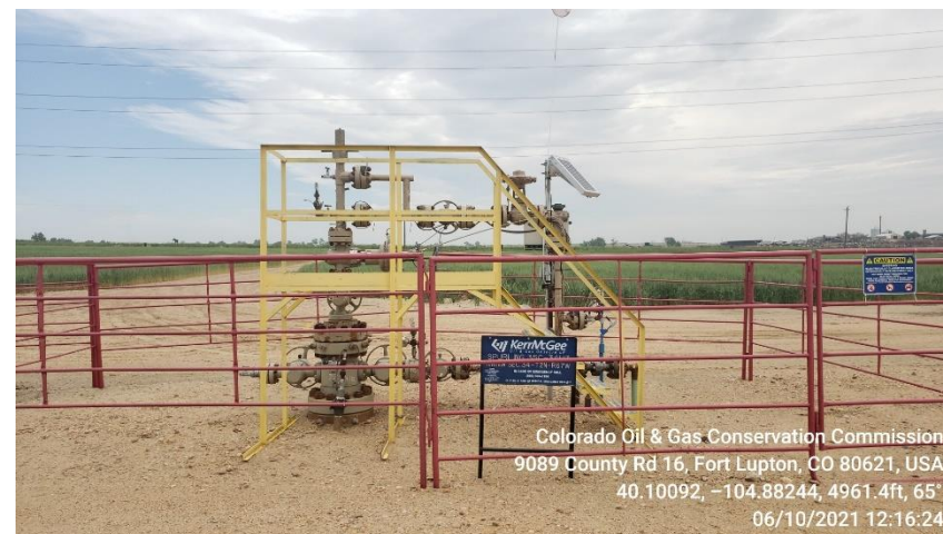
Photo 4 WH/sign