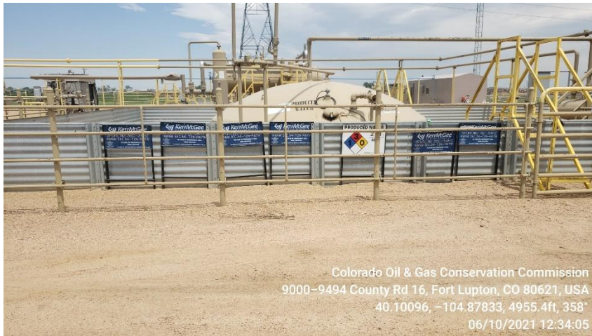
Photo 7 TB signs