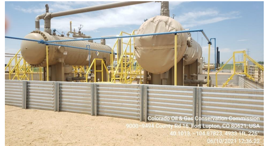
Photo 10 FWKOs