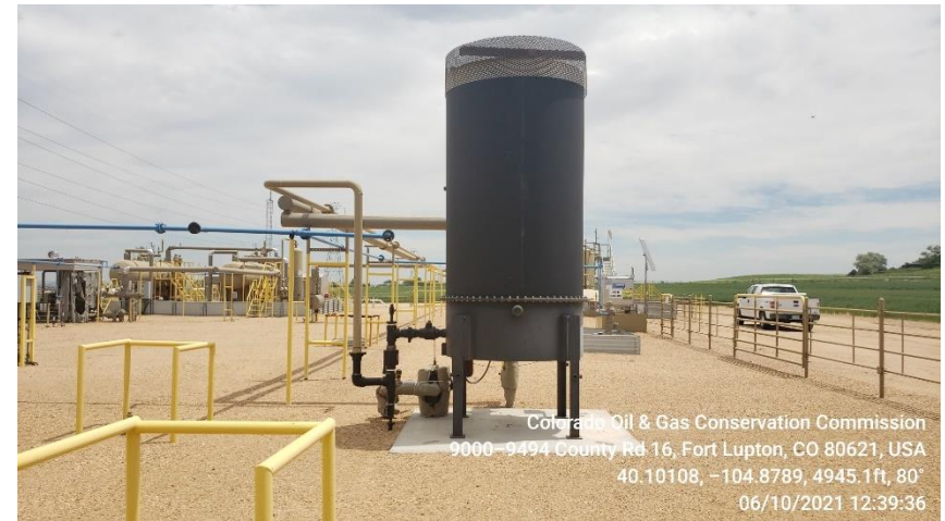
Photo 14 ECD