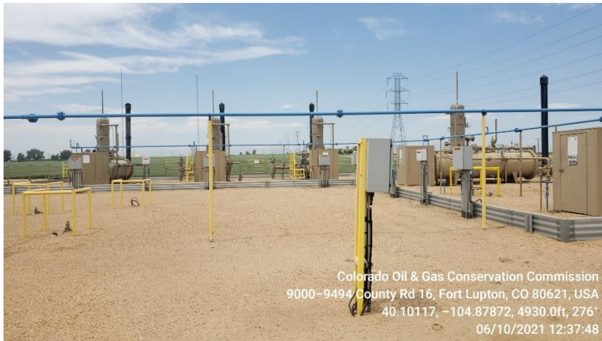
Photo 13 Horizontal Heated Separators