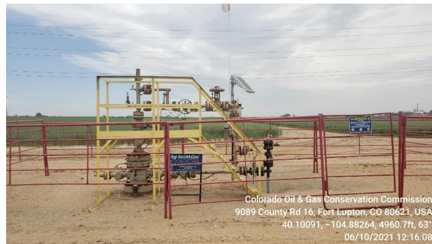
Photo 2 WH/sign