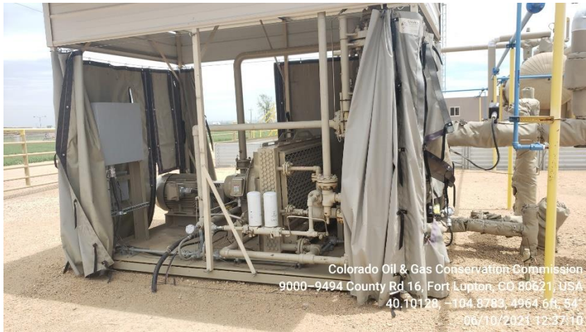
Photo 11 VRU