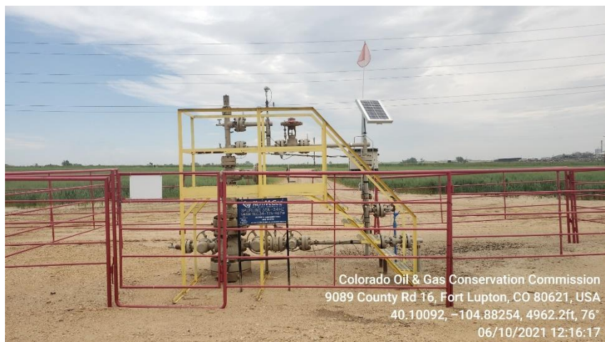
Photo 3 WH/sign