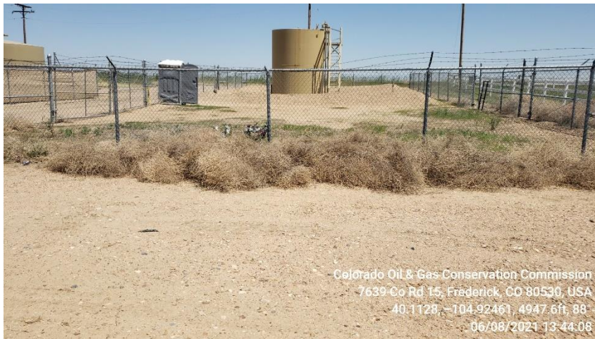
Photo 15 Dead weeds around TB fencing