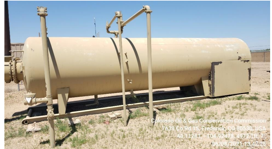
Photo 8 Heater treater