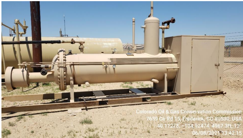
Photo 7 Horizontal Heated Separator