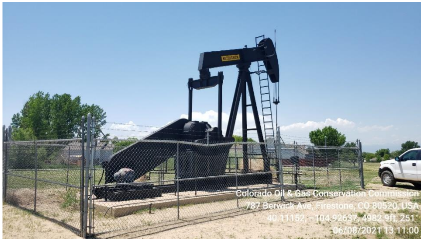
Photo 3 Pump Jack