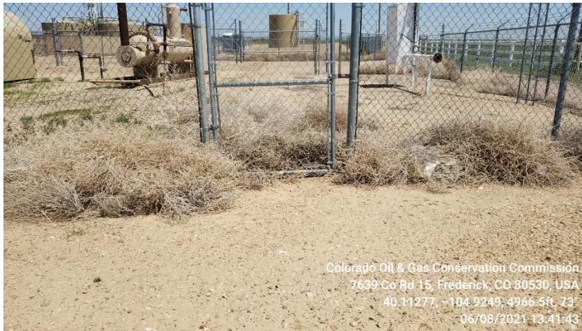
Photo 13 Dead weeds throughout ROW