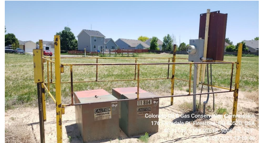
Photo 4 ancillary equipment