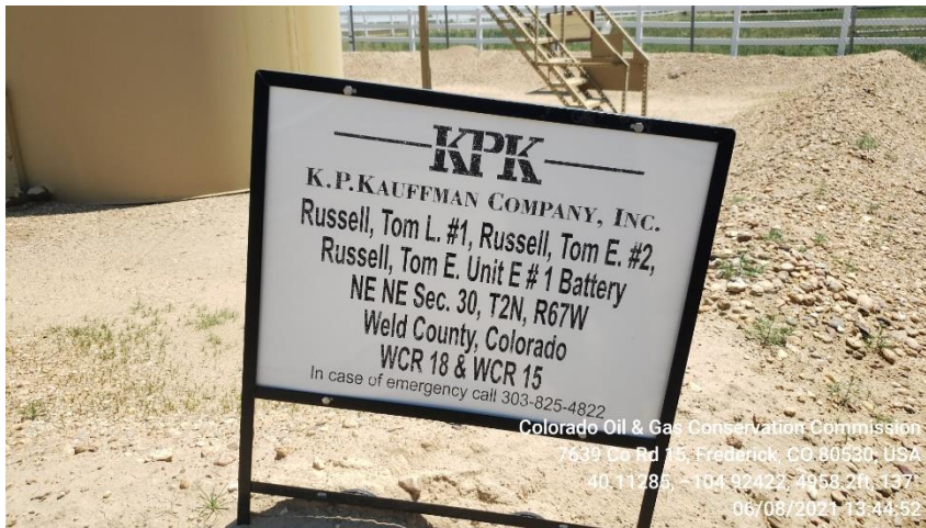
Photo 5 TB sign