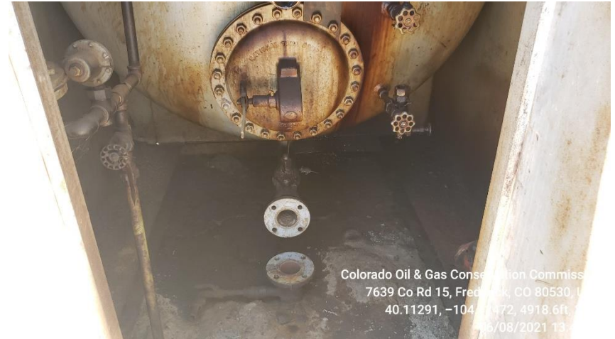
Photo 10 Stained soil inside of Heater treater housing