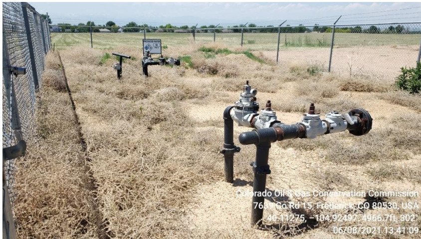
Photo 11 Dead weeds throughout PW/flow line area