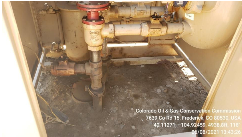
Photo 9 stained soil inside Horizontal Heated Separator housing