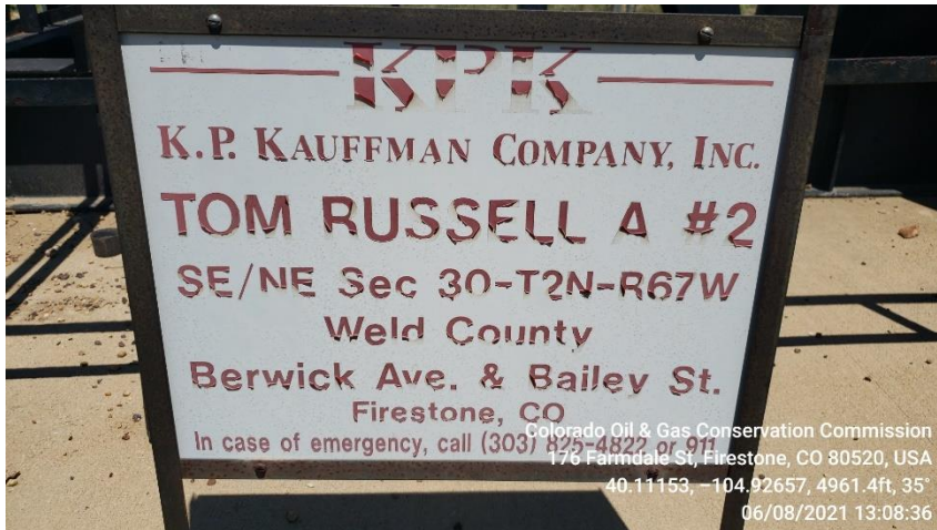
Photo 1 WH sign