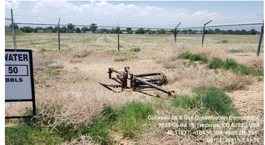
Photo 12 Dead weeds throughout PW/flow line area