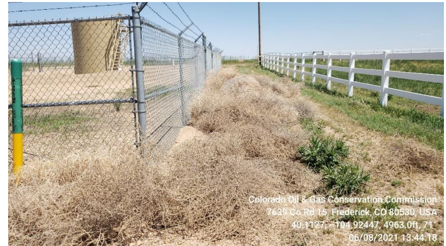
Photo 16 Dead weeds around TB fencing