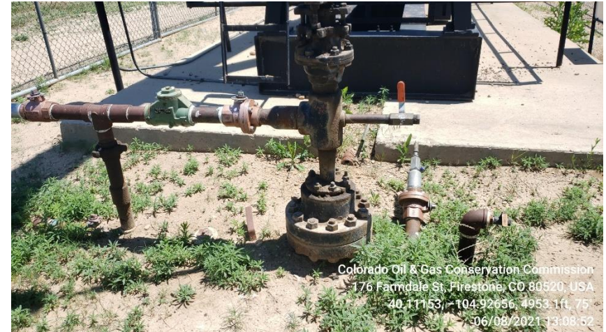
Photo 2 WH