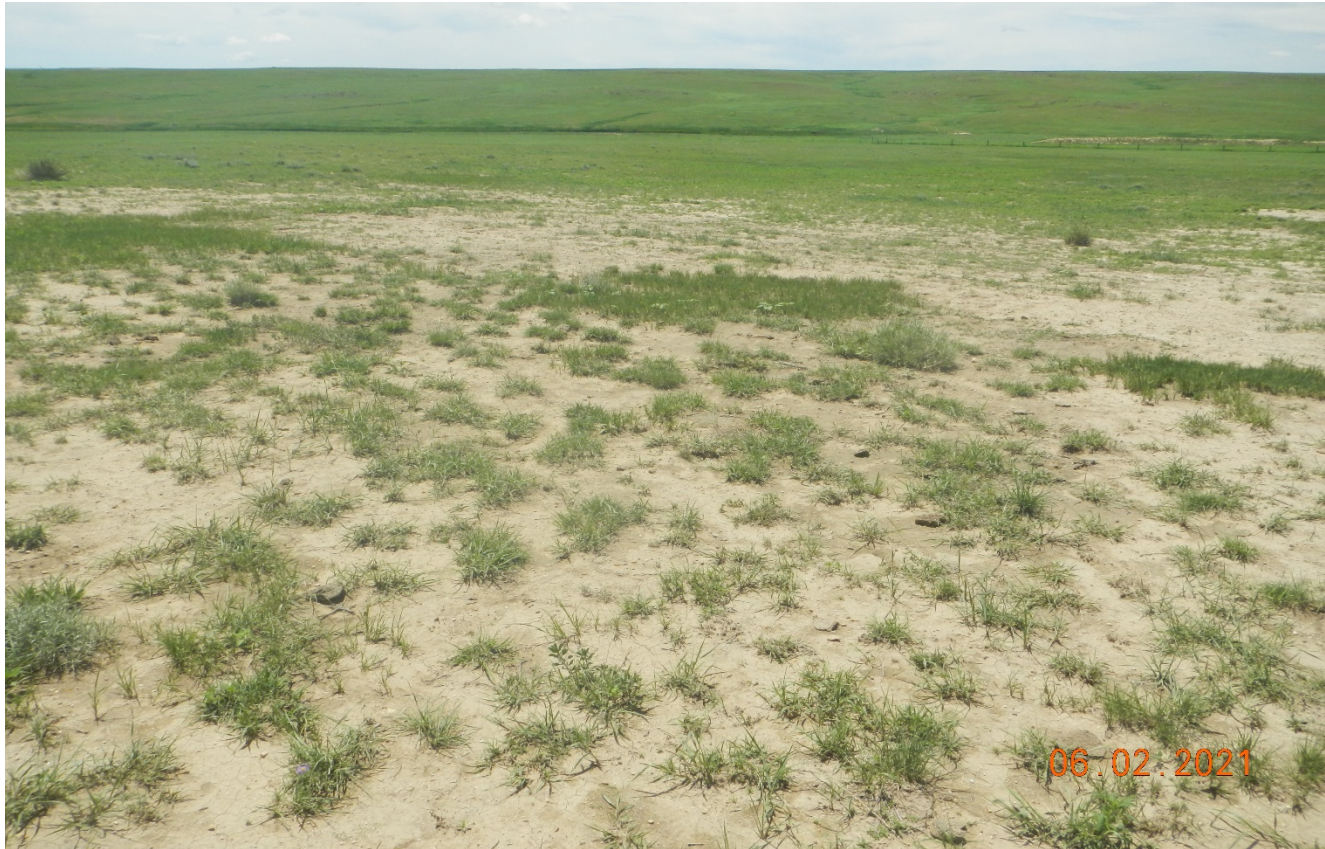
Photo 5. Facing south at the center of the location. The vegetation has not adequately established at the location.