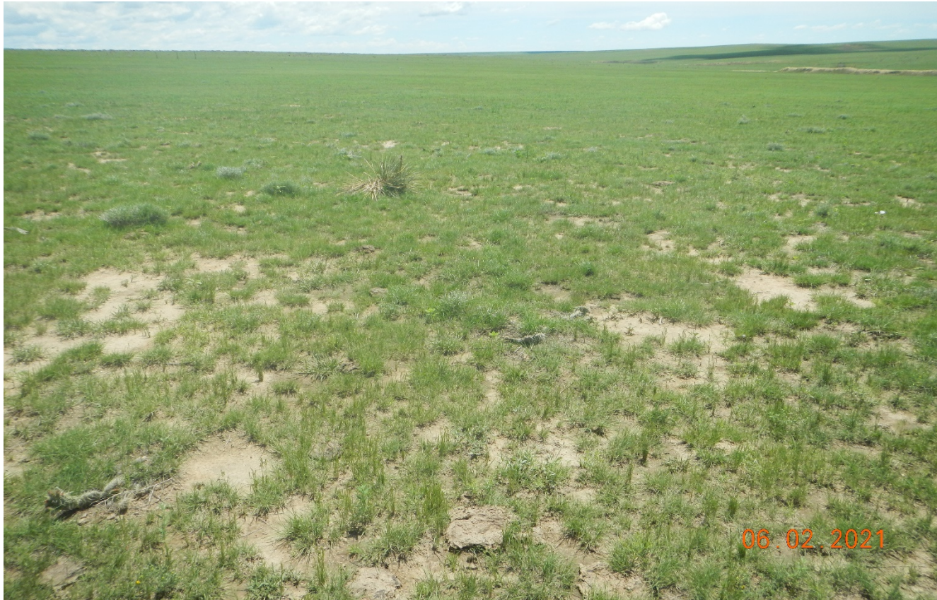
Photo 7. Facing southeast toward the undisturbed surrounding area.