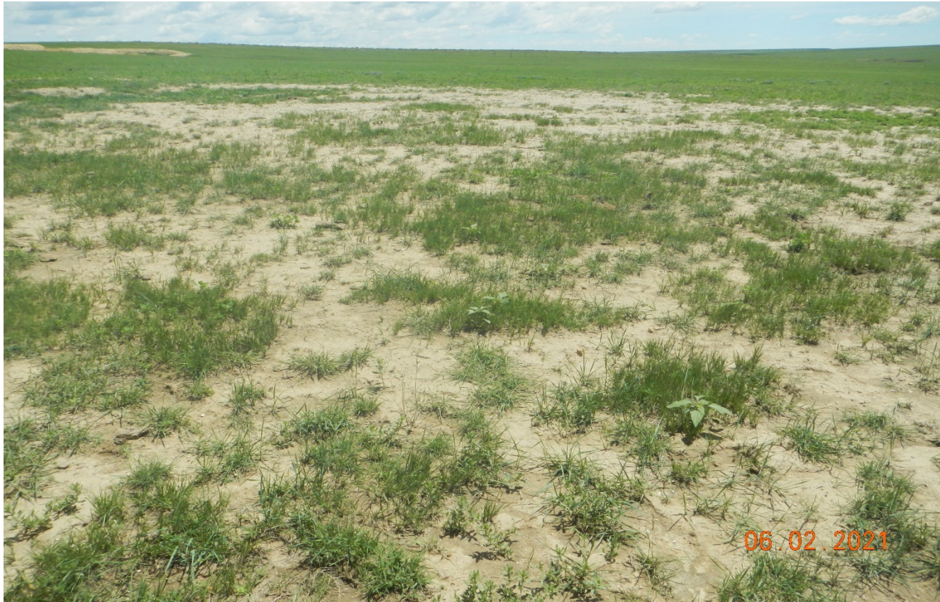
Photo 6. Facing east at the center of the location. The vegetation has not adequately established at the location.