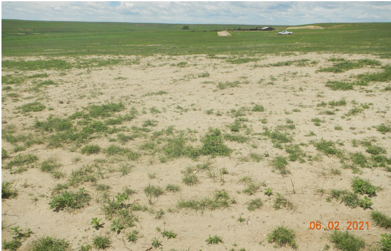
Photo 4. Facing west at the center of the location. The vegetation has not adequately established at the location.