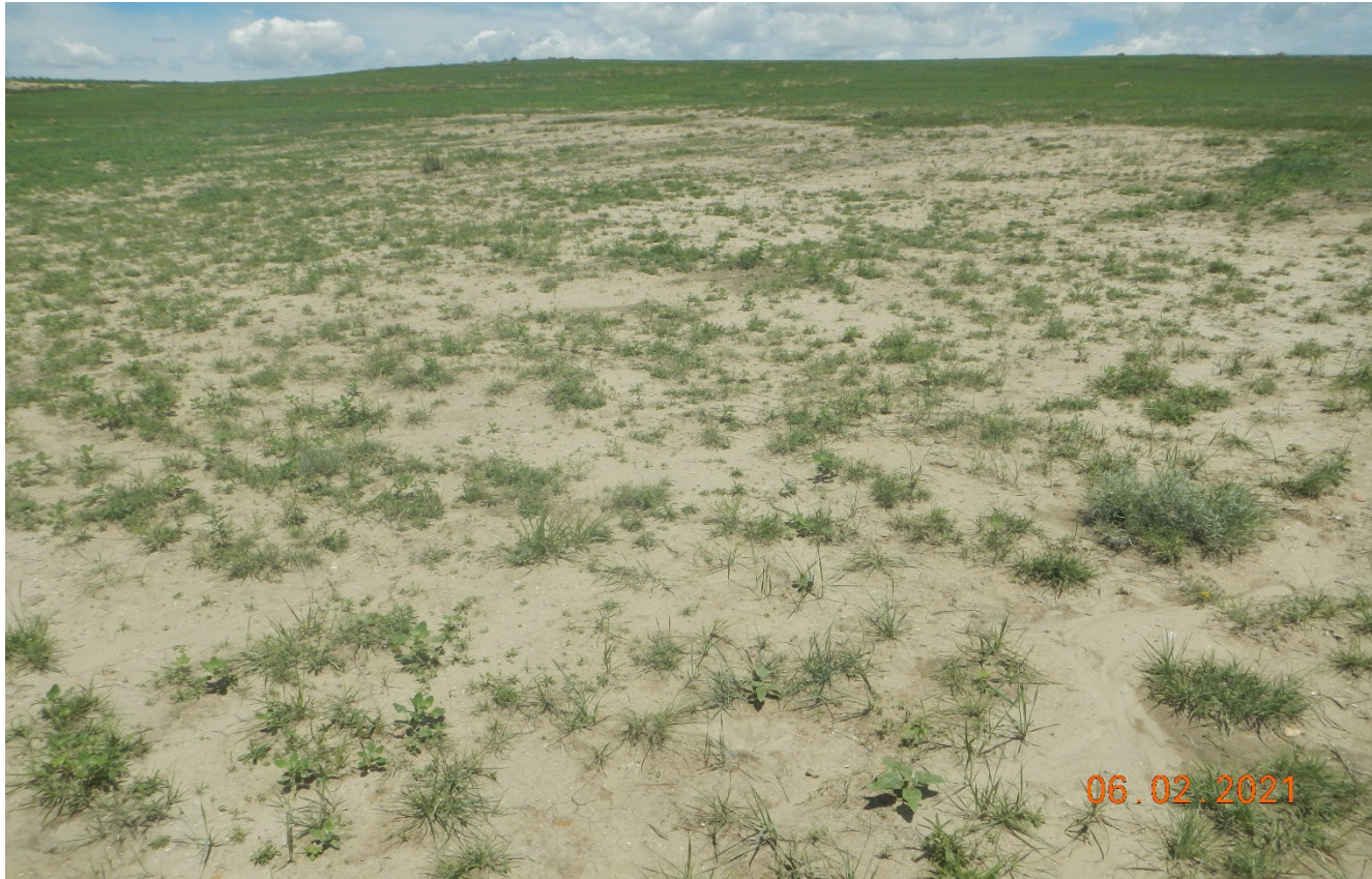
Photo 3. Facing north at the center of the location. The vegetation has not adequately established at the location.