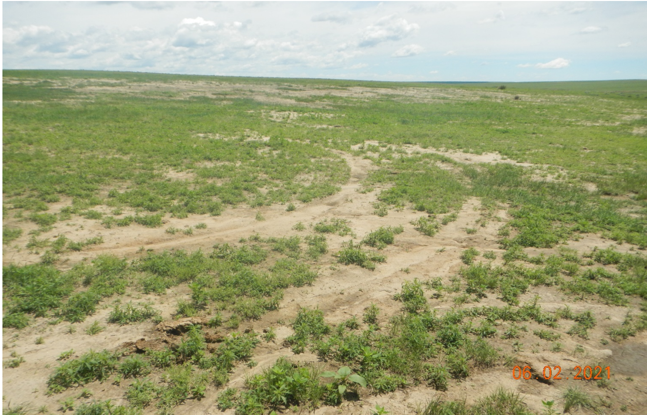
Photo 2. Facing northeast at the location. There is undesirable weeds (Kochia) growing throughout this southwest portion of the location.