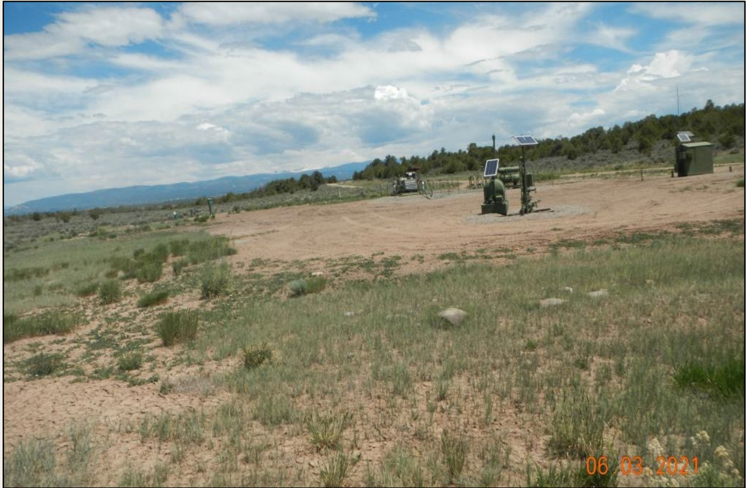
Photo 1. View of project area from the northwestern corner facing center.