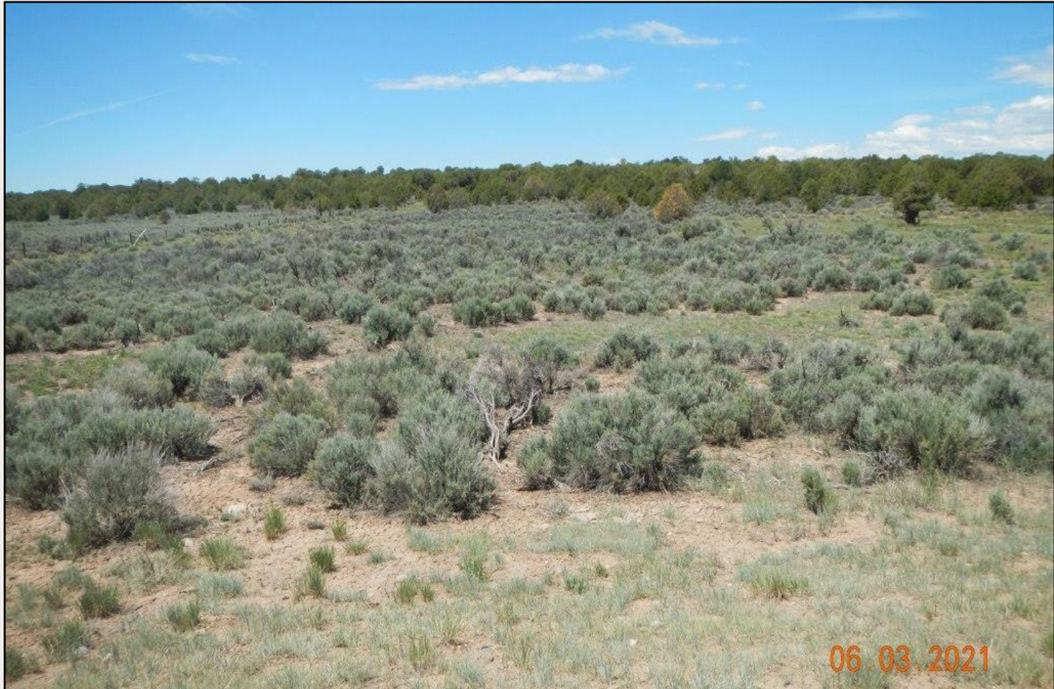
Photos 5. View of reference area comprised of big sagebrush and black sagebrush shrubland with scattered pinyon and juniper trees, and squirreltail, western wheatgrass, mat penstemon in the understory.