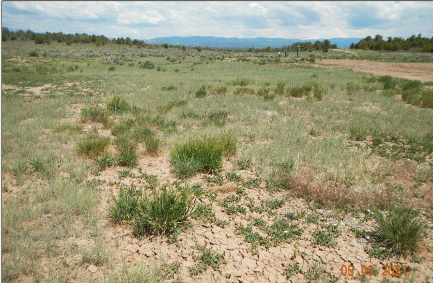
Photo 2. View of the northern project area from the northwestern corner facing eastward. Revegetation is progressing with western wheatgrass, smooth brome, and crested wheatgrass. Revegetation at final reclamation will need to use a native seed mix representative of the reference area.