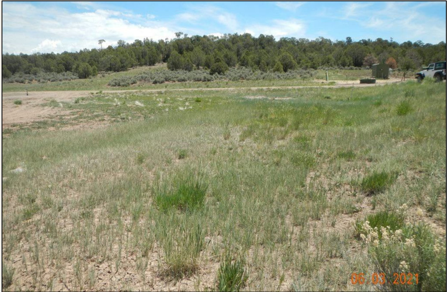
Photos 3. View of the southern project area from the southwestern corner facing eastward.