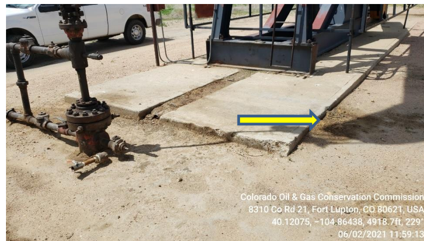
Photo 4 Stained Soil by PJ concrete slab