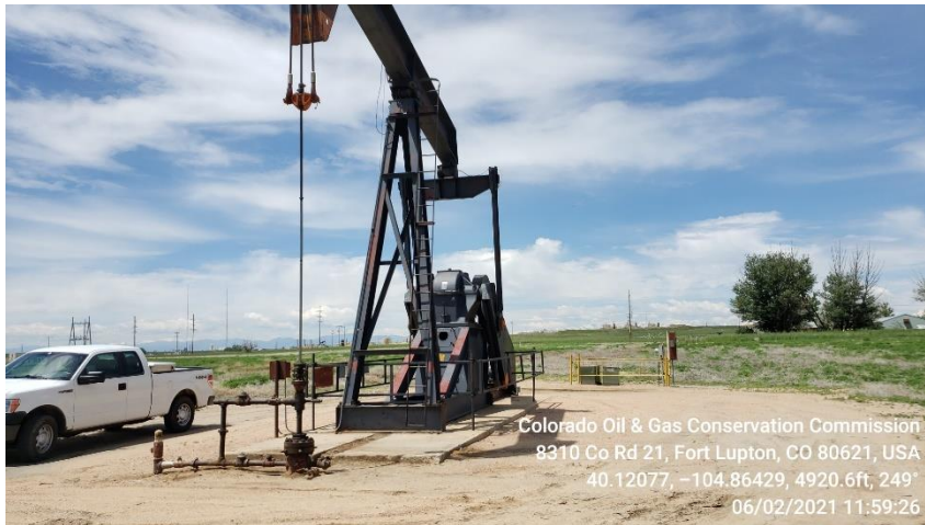
Photo 5 Pump Jack