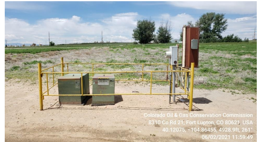
Photo 6 ancillary equipment