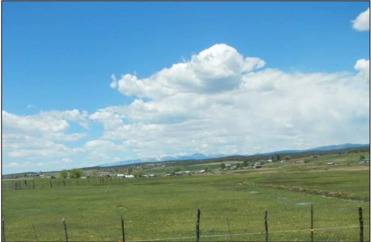
Photos 4. View of reference area, comprised of irrigated grass field.