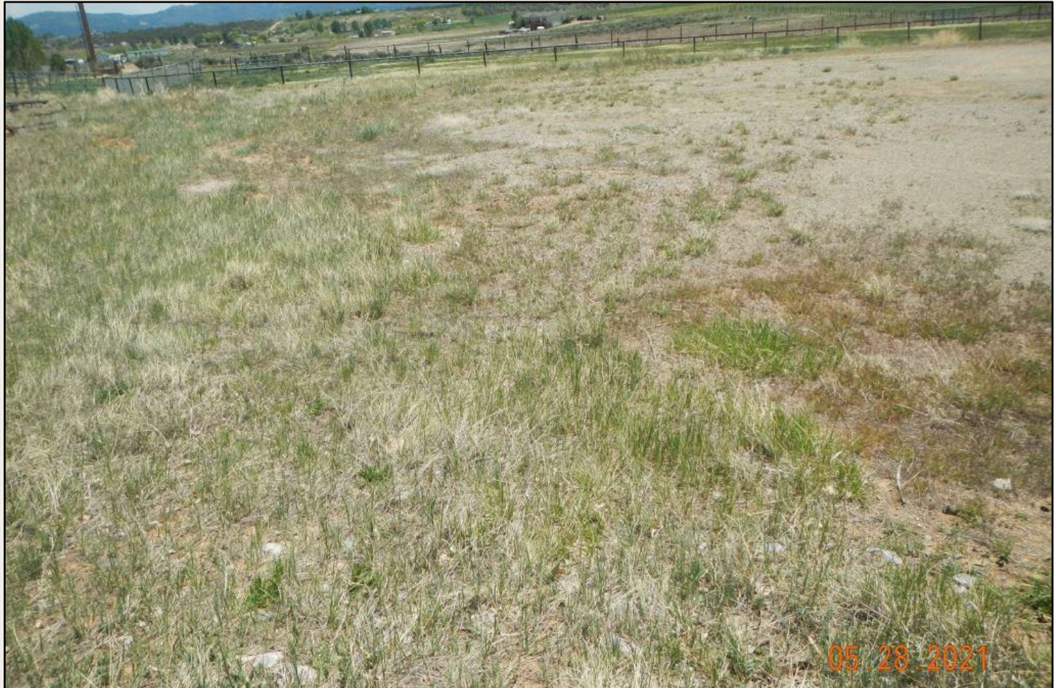
Photo 2. View of the northern project area from the northwestern corner facing eastward. Revegetation is progressing with western wheatgrass and sand dropseed.