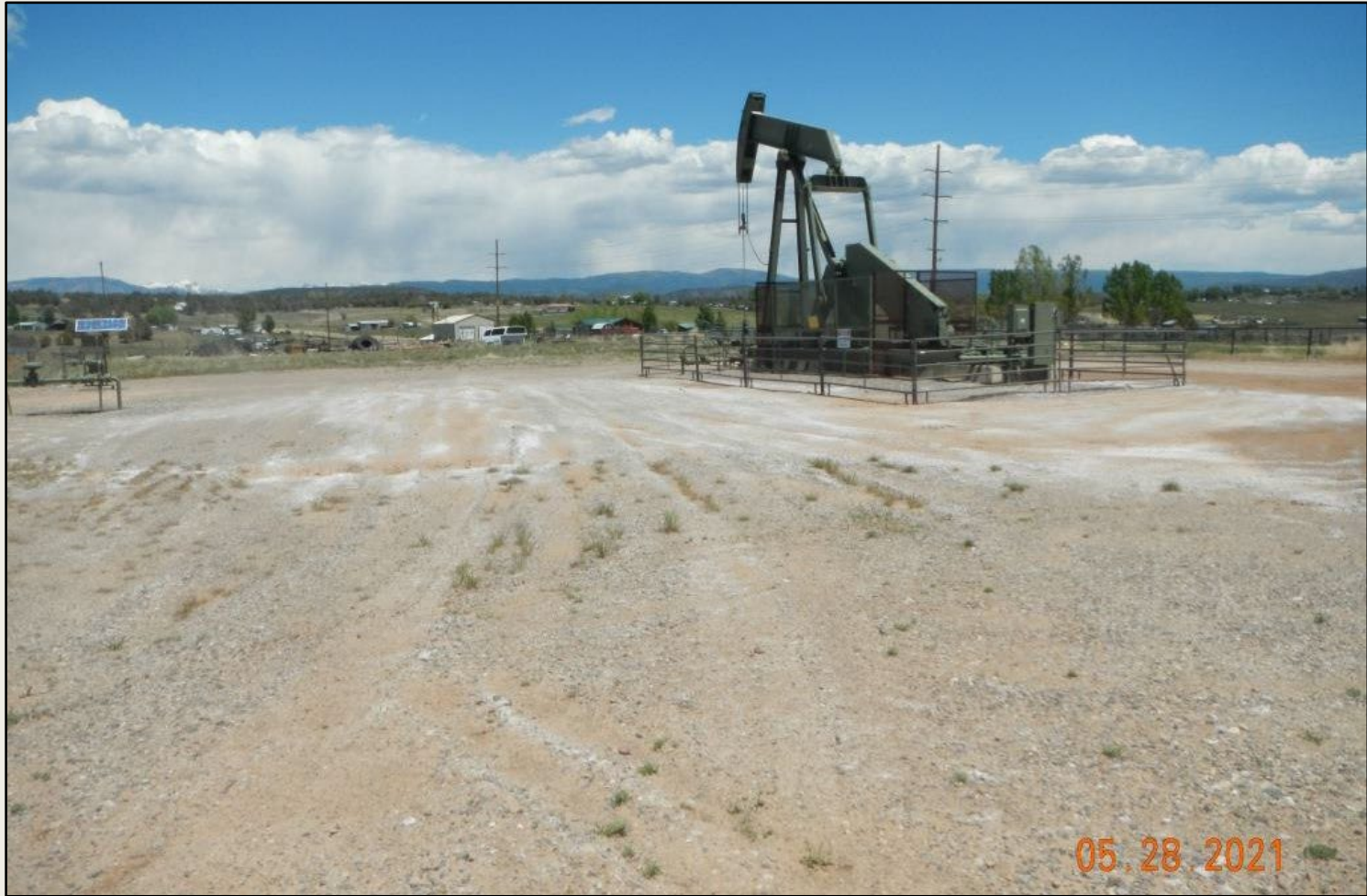
Photo 1. View of project area from the well pad entrance facing center.