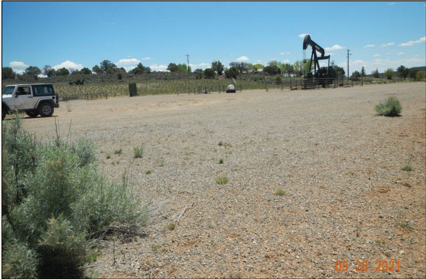
Photo 1. View of project area from the northwestern corner facing center.