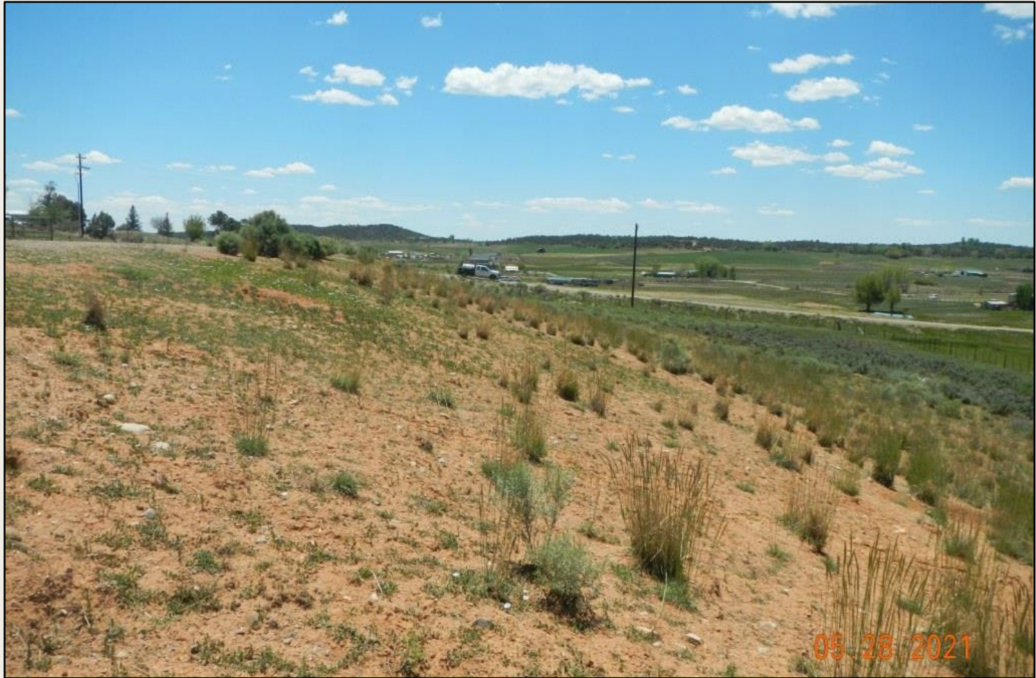
Photos 3. View of the western project area from the northwestern corner facing southward. Revgetation remains sparse and weedy in portions of the western fill slope.