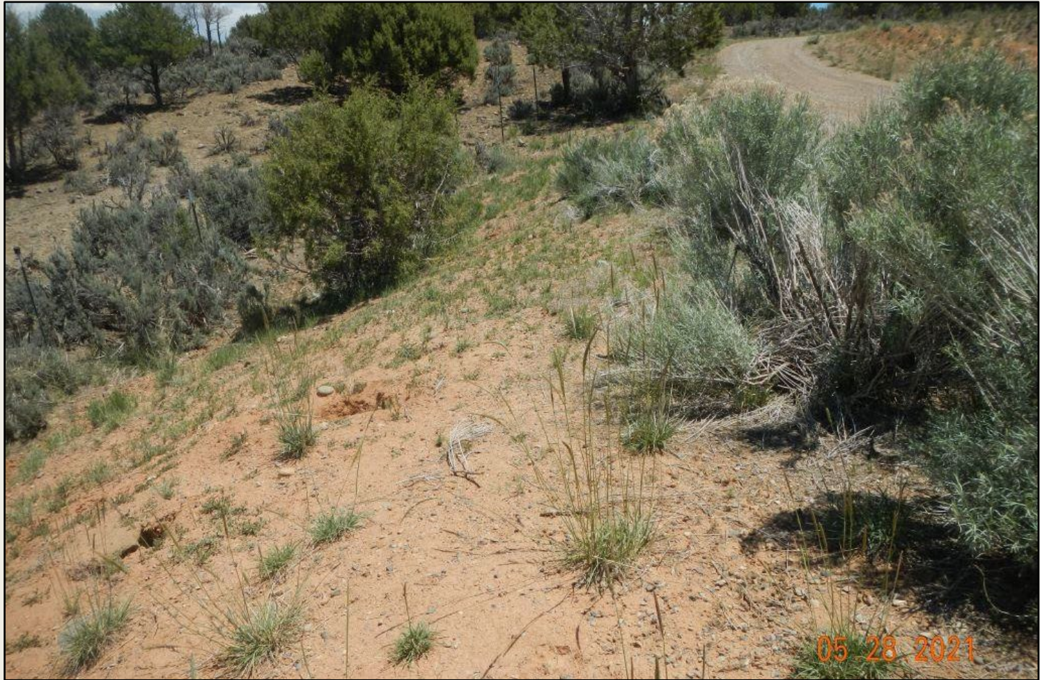
Photo 2. View of the northern project area from the northwestern corner facing eastward. Revegetation is progressing in portions with intermediate wheatgrass, crested wheatgrass, and sand dropseed.