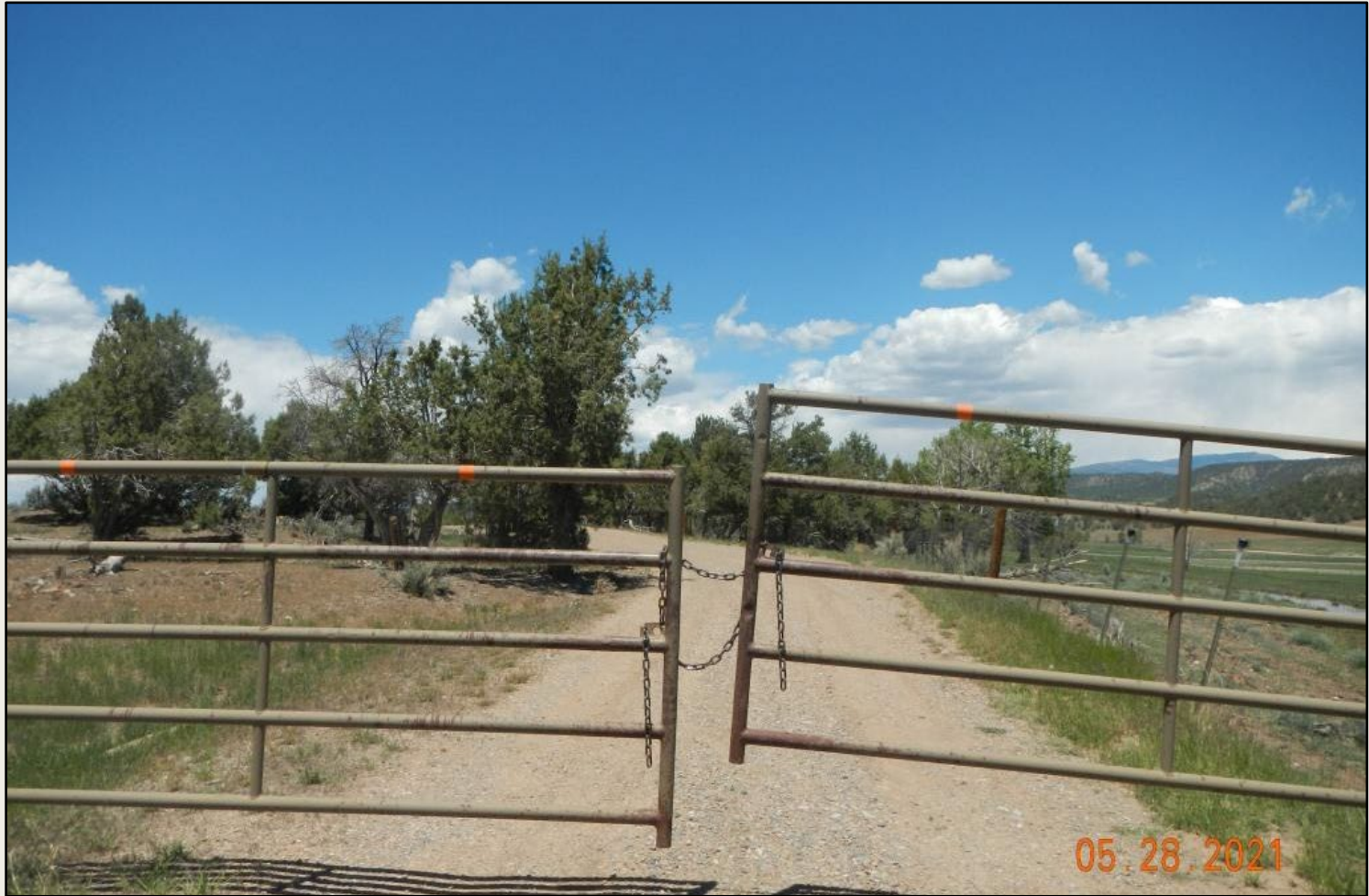
Photo 8. View of reference area vegetation comprised of sagebrush shrubland with scattered pinyon and juniper trees, as well as squirreltail, western wheatgrass, phlox, and penstemon in the understory.