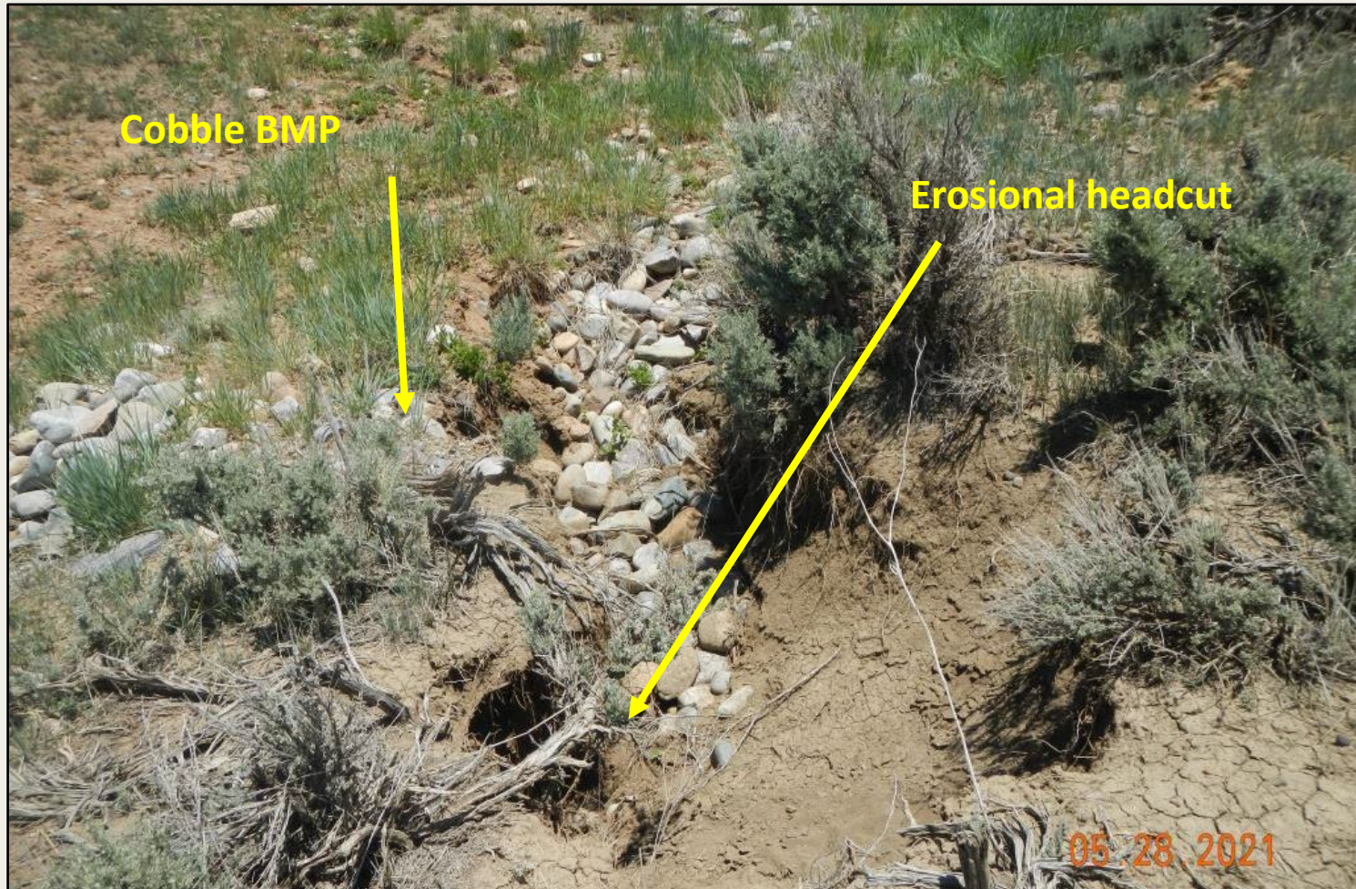
Photos 5. View of erosional headcutting within the northern project area (facing upslope). Stormwater flows are diverting around cobble BMP and forming a new channel and headcutting.