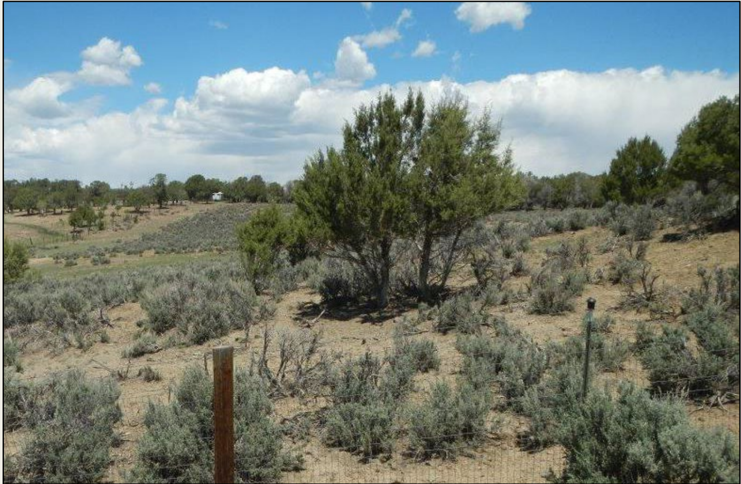
Photo 7. View of reference area vegetation comprised of sagebrush shrubland with scattered pinyon and juniper trees, as well as squirreltail, western wheatgrass, phlox, and penstemon in the understory.