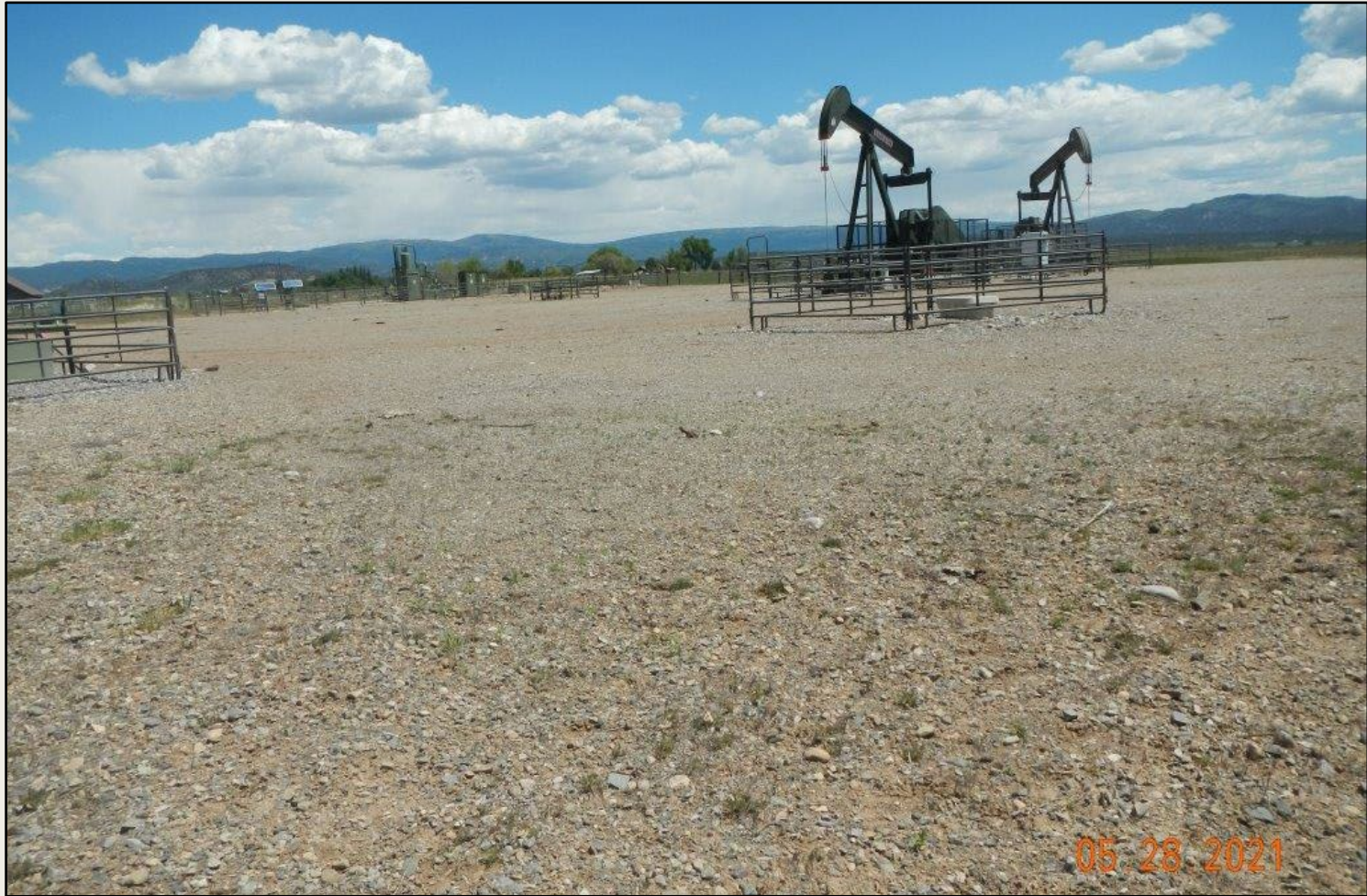
Photo 1. View of project area from the southwestern project area facing center.