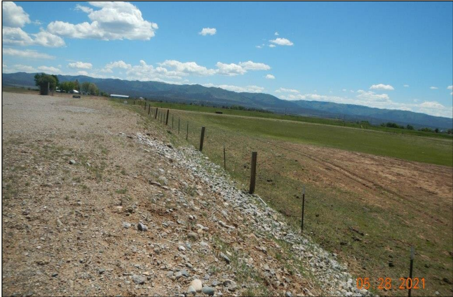
Photo 2. View of the southern project area from the southwestern corner facing eastward. Revegetation is progressing with crested wheatgrass, western wheatgrass, and smooth brome, largely in a grazed condition.