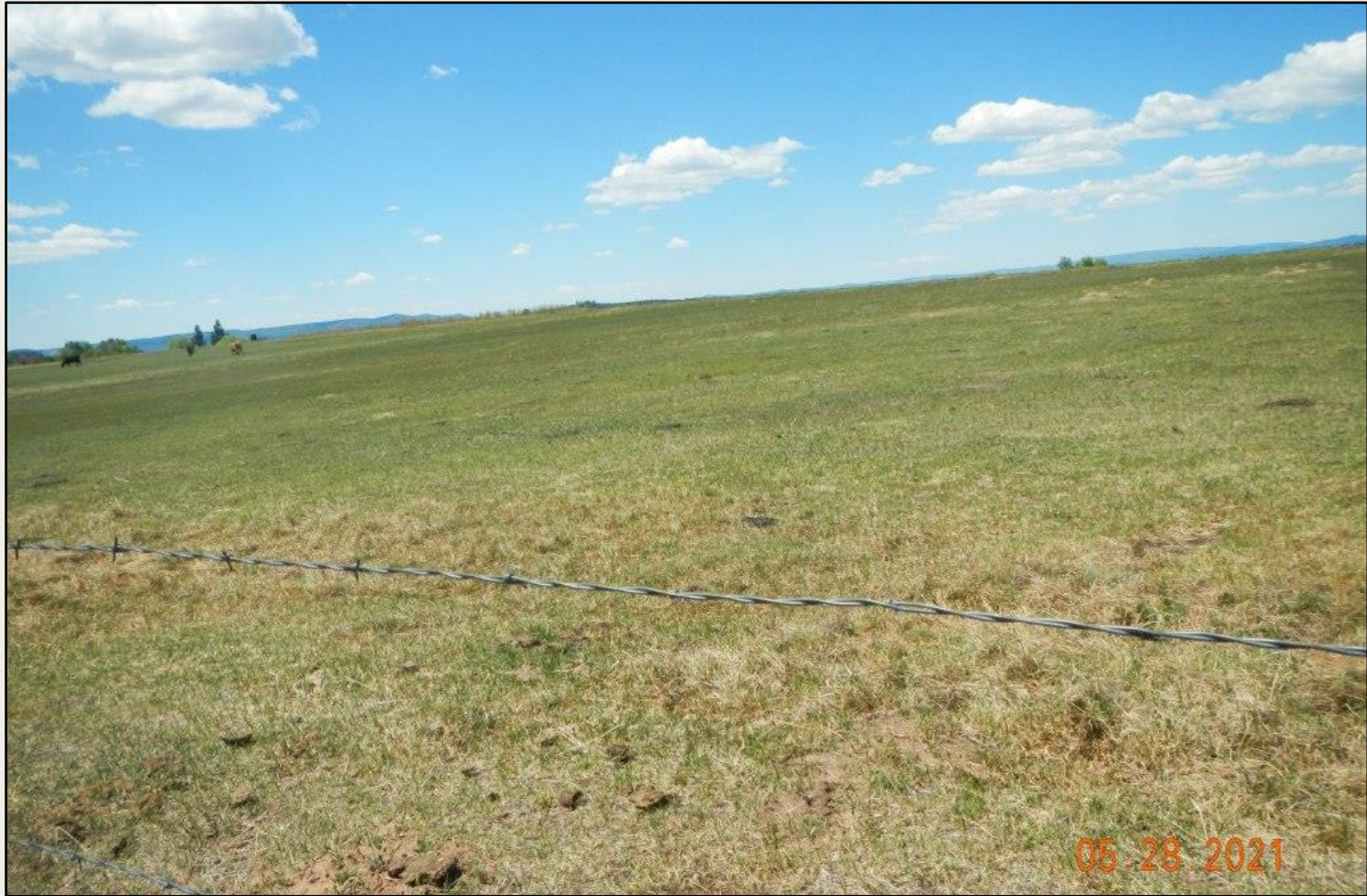
Photo 5. View of reference area vegetation comprised of irrigated grass field, largely in a grazed vegetative condition.