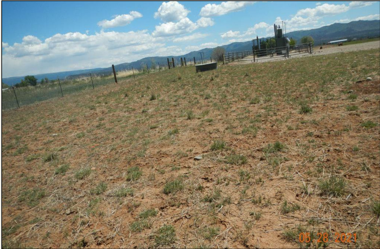
Photo 4. View of the northern project area from the northwestern corner facing eastward.