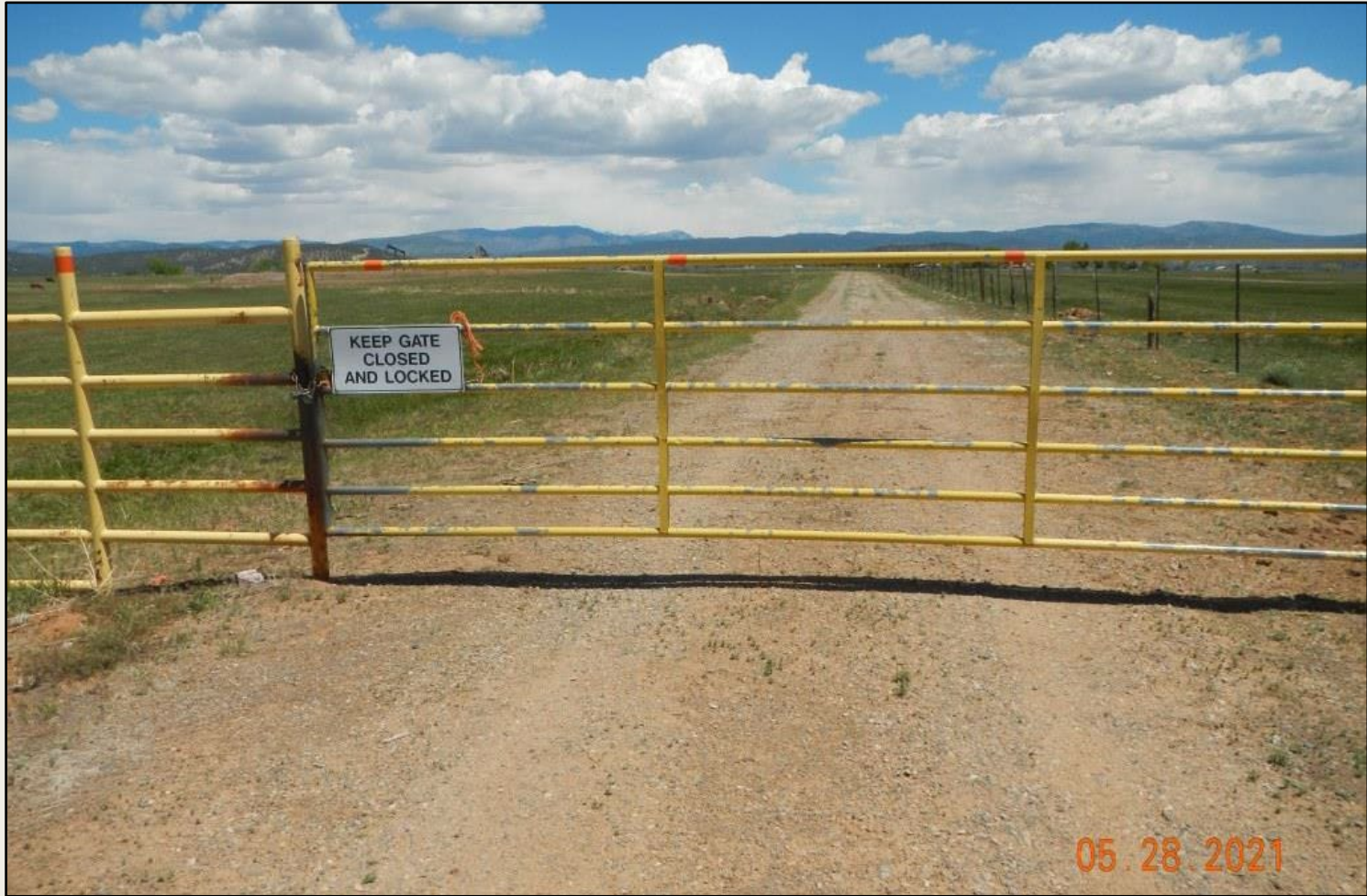
Photo 6. View of closed gate after leaving location.