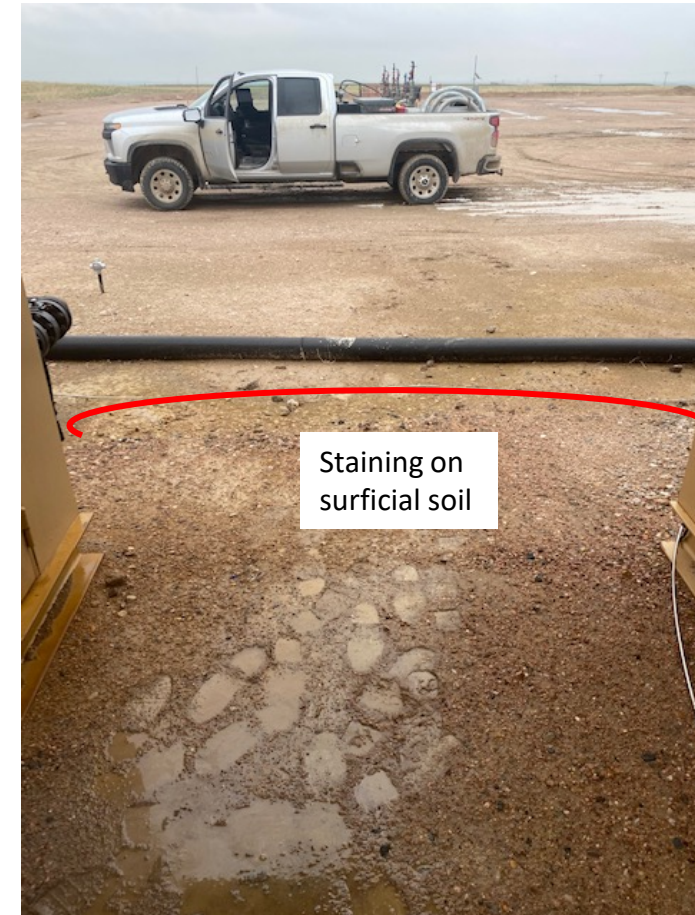
Staining on surficial soil

Soil removal was coordinated – confirmation soil samples pending collection/analysis