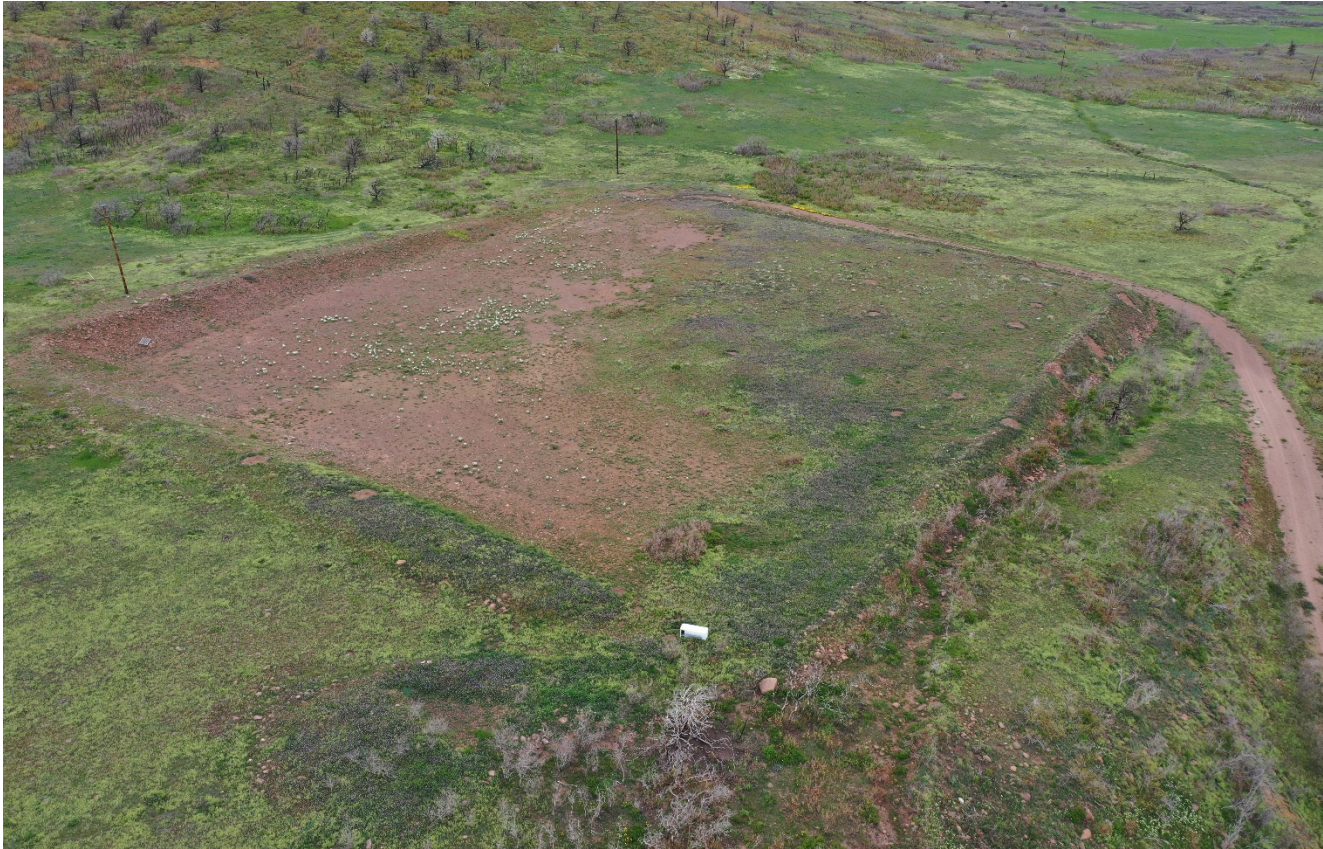
Photo 4. Facing north overlooking the location which is approximately 2.3 acres in size.