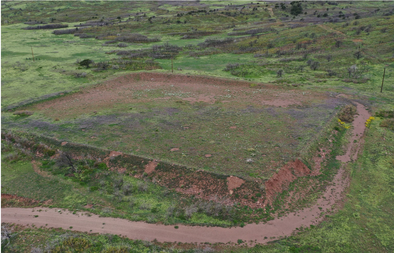
Photo 2. Aerial image of the location shows the location has not been recontoured and reclaimed.