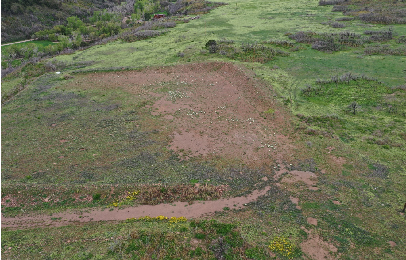
Photo 3. Facing southwest overlooking the location. Part of the location has no vegetation growth and previous inspection identified noxious weeds growing throughout the location.