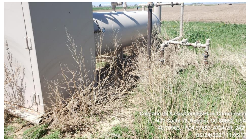
Photo 8 Dead/live weeds around Horizontal Heated Separator.