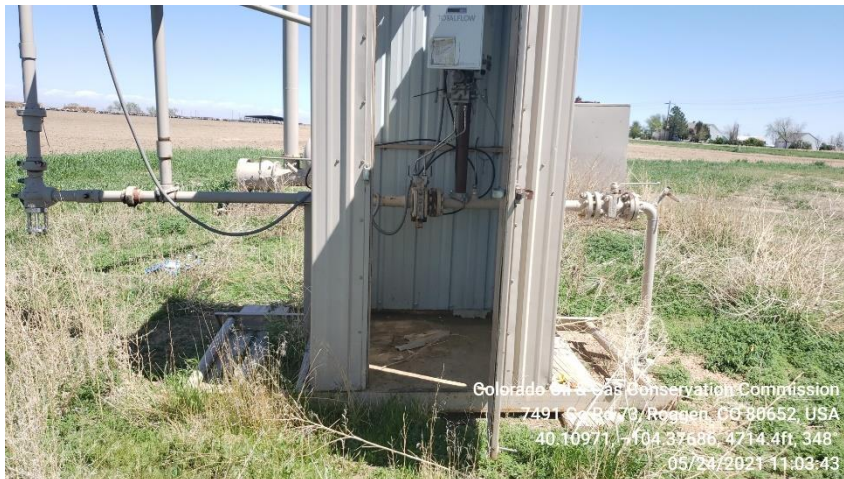
Photo 5 Gas Meter Run