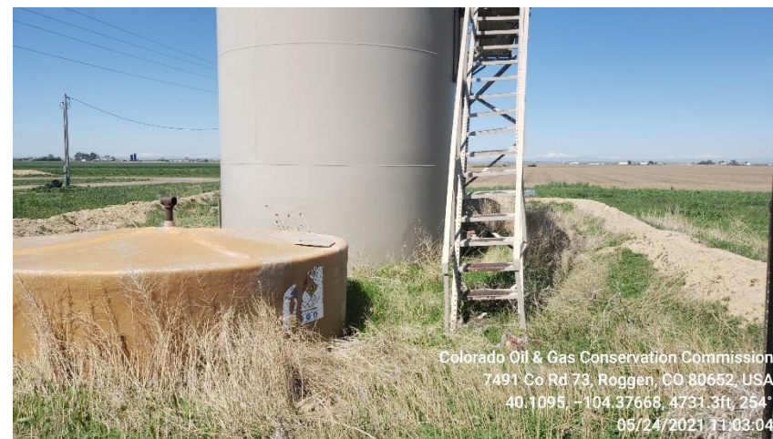
Photo 2 Dead weeds and fresh weeds throughout TB location.