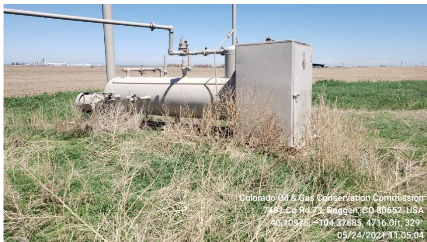
Photo 7 Dead/live weeds around Horizontal Heated Separator.