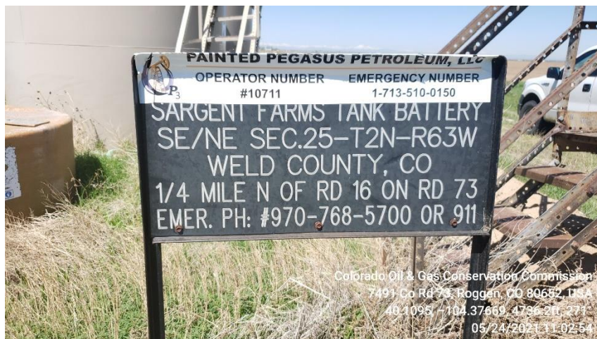
Photo 1 TB sign