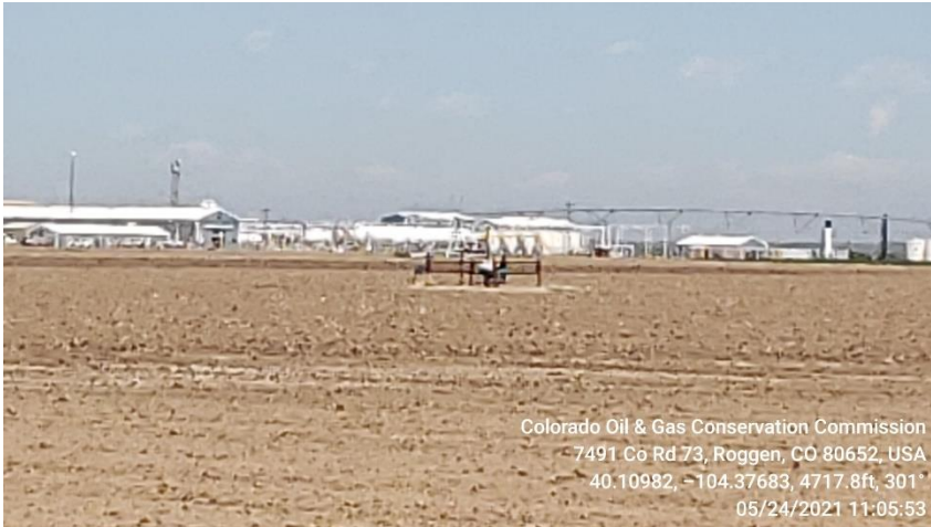
Photo 9 Wellsite in middle of planted field