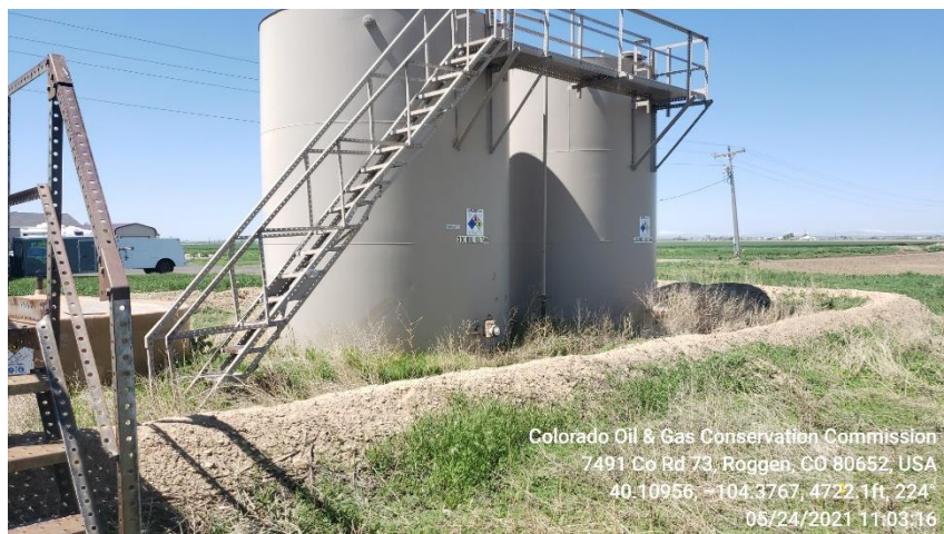
Photo 3 TB weeds inside, outside & on TB berm