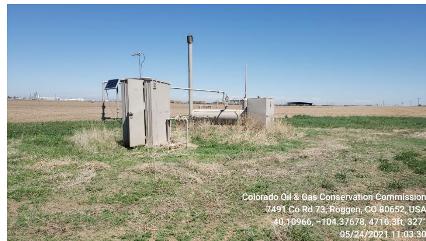
Photo 4 Dead weeds and fresh weeds throughout TB location around Gas Meter Run & Horiz. Heated Sep..