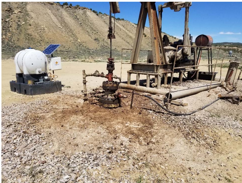
Photo 2. Stained soil around wellhead.