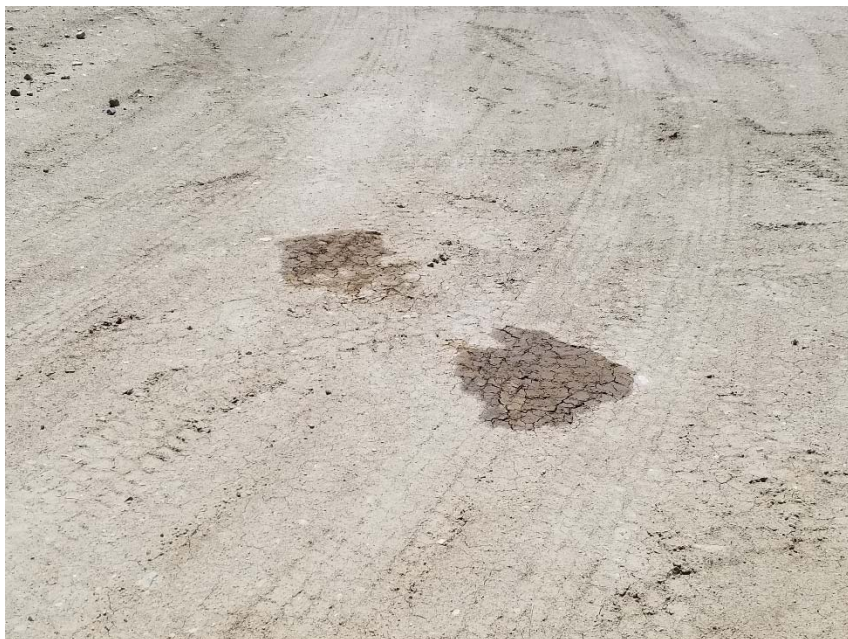
Photo 4. Example of soil staining on location.