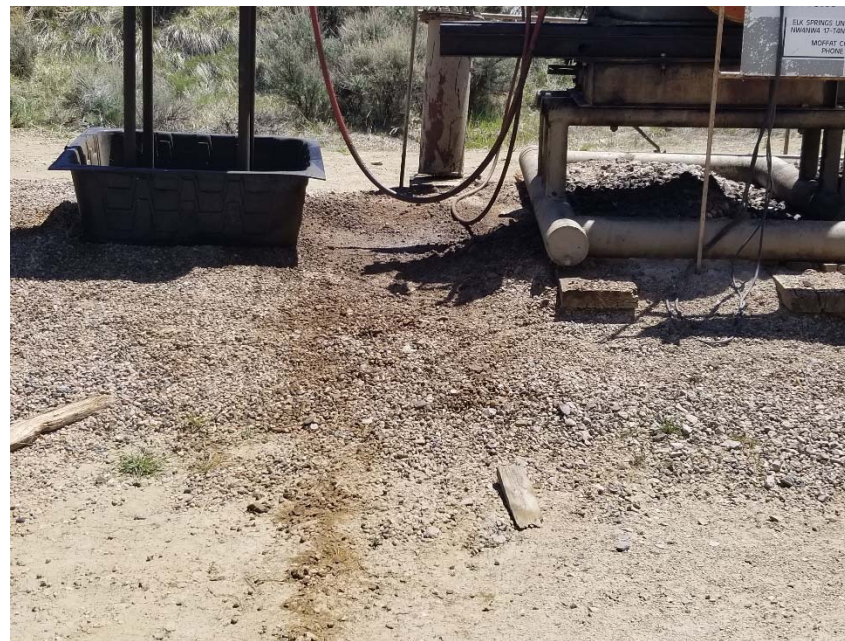
Photo 3. Stained soil at pump jack.