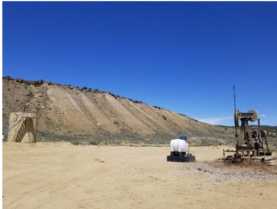
Photo 1. Overview of location taken facing east.