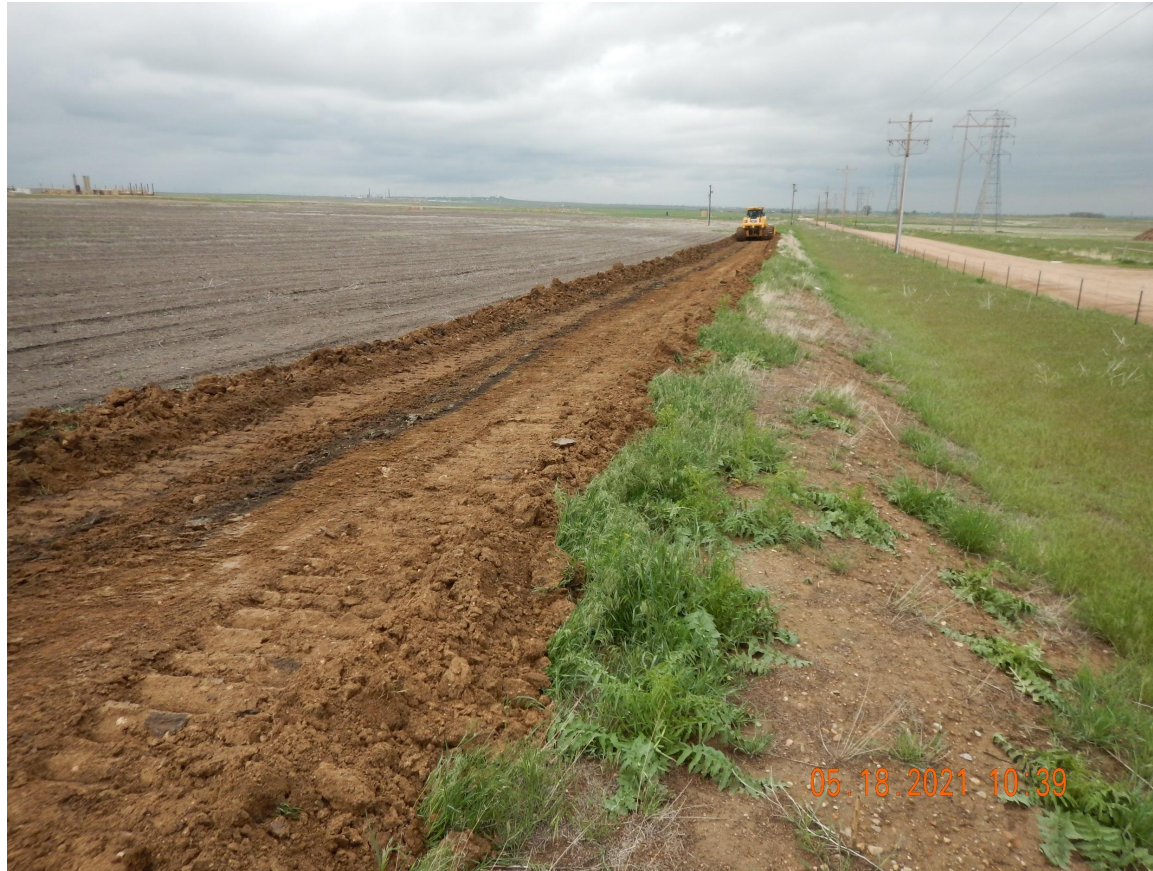
Photo 3. Photo taken from the western DFMF #1, facing South. See comments under Photo 1.