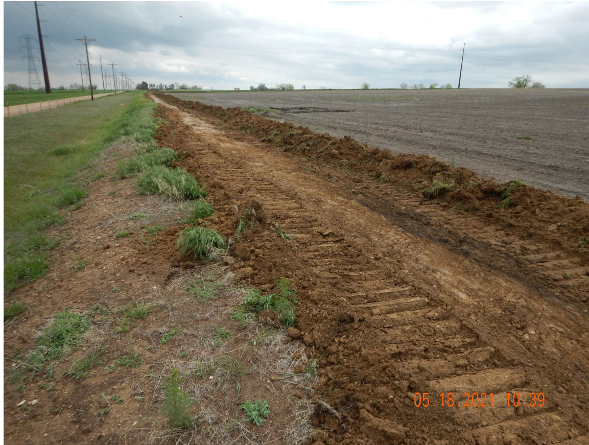
Photo 1. Photo taken from the western DFMF #1, facing North. Photo illustrates Operator is removing and reclaiming the facility berms, outfall BMP and access roads in preparation for site closure.