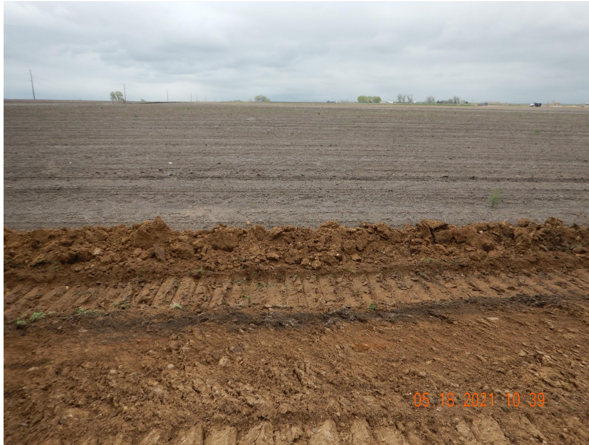
Photo 2. Photo taken from the western DFMF #1, facing East. See comments under Photo 1.