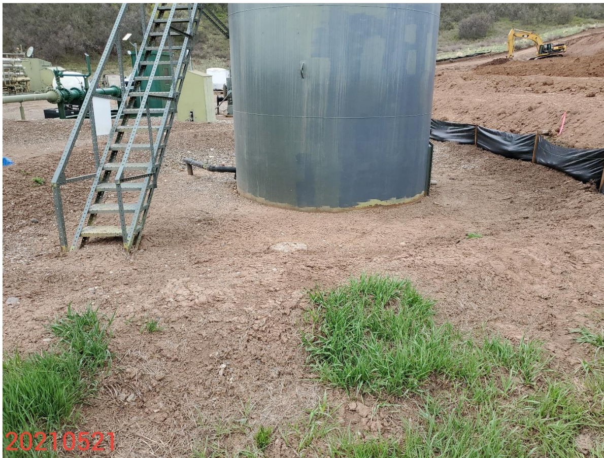
Photo 5: Photo taken from the 300 bbl produced water tank on the Location. Photo shows that the integrity of the containment berm BMP has been compromised during the construction of a silt fence.