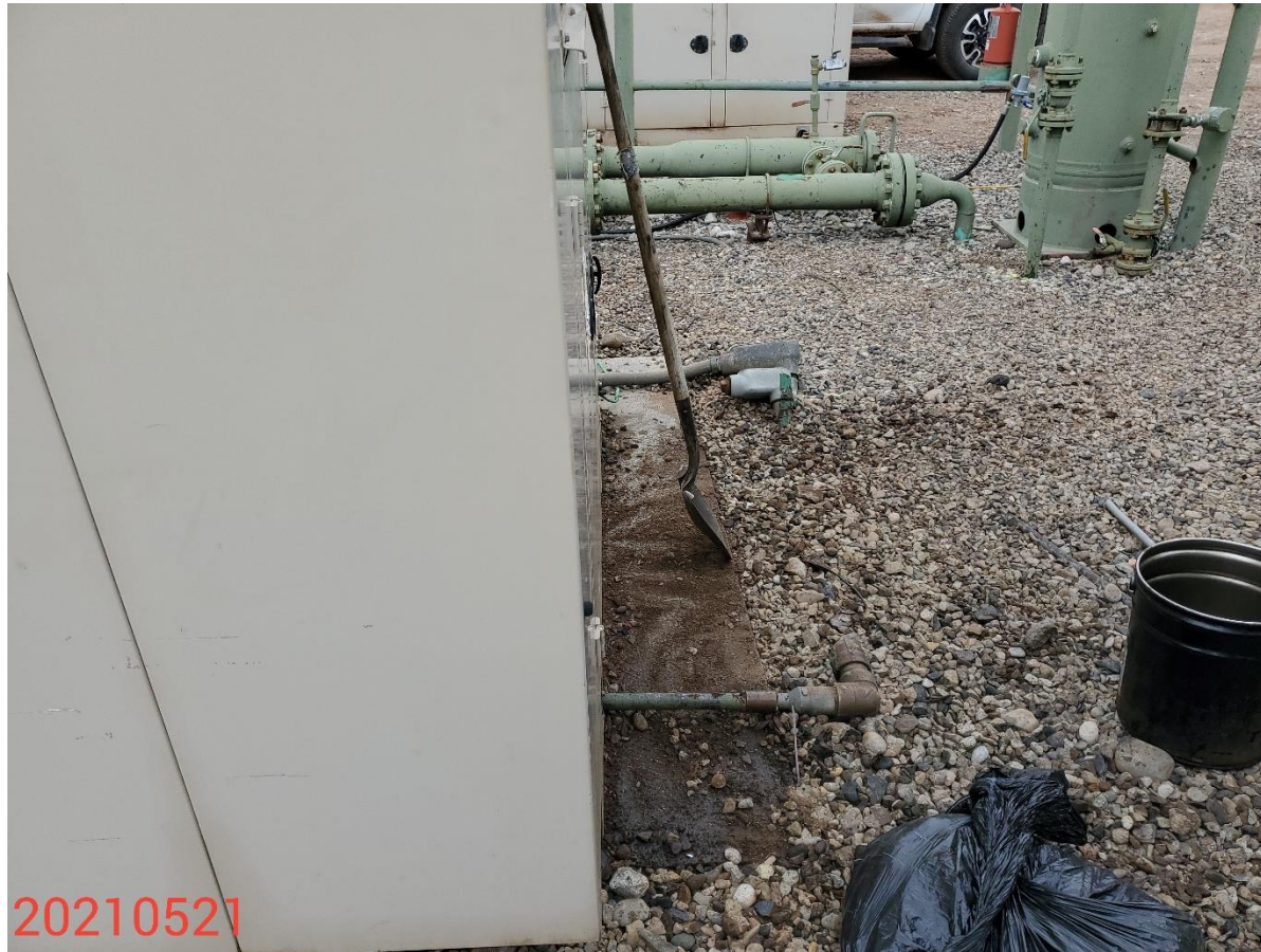
Photo 3: Photo show repair equipment and clean-up of stained soils around equipment was in process at time of inspection