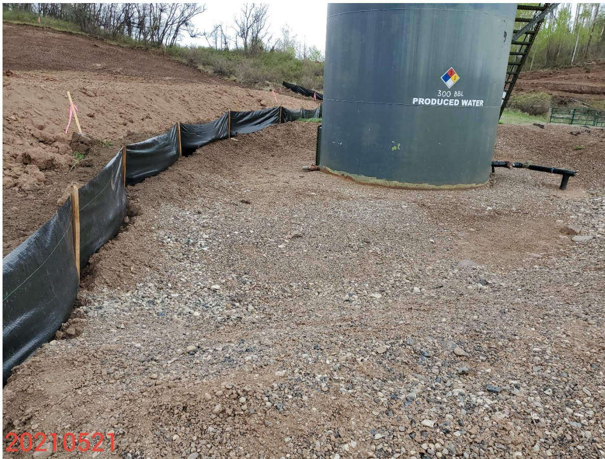
Photo 4: Photo taken from the 300 bbl produced water tank on the Location. Photo shows that the integrity of the containment berm BMP has been compromised during the construction of a silt fence.