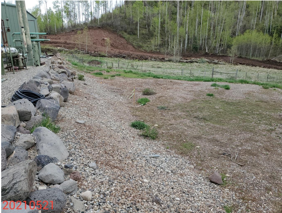
Photo 12: Photo taken from the fill slopes on the southeast end of the Location. Photo shows BMPs to protect/stabilize the fill slopes of the Location remain missing or insufficient.