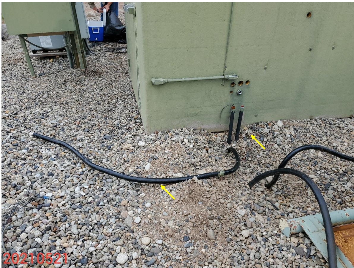
Photo 6: Photos 6-11 provide examples of various trash, debris and unused equipment remaining on the Location.