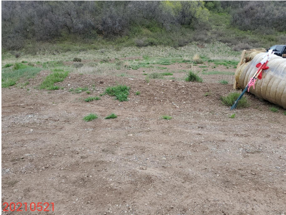
Photo 13: Photo taken from the interim areas on the west end of the Location, facing north. Desirable perennial vegetative establishment is sparse; interim areas largely bare. Vegetation observed on interim areas predominantly undesirable weedy plant species.