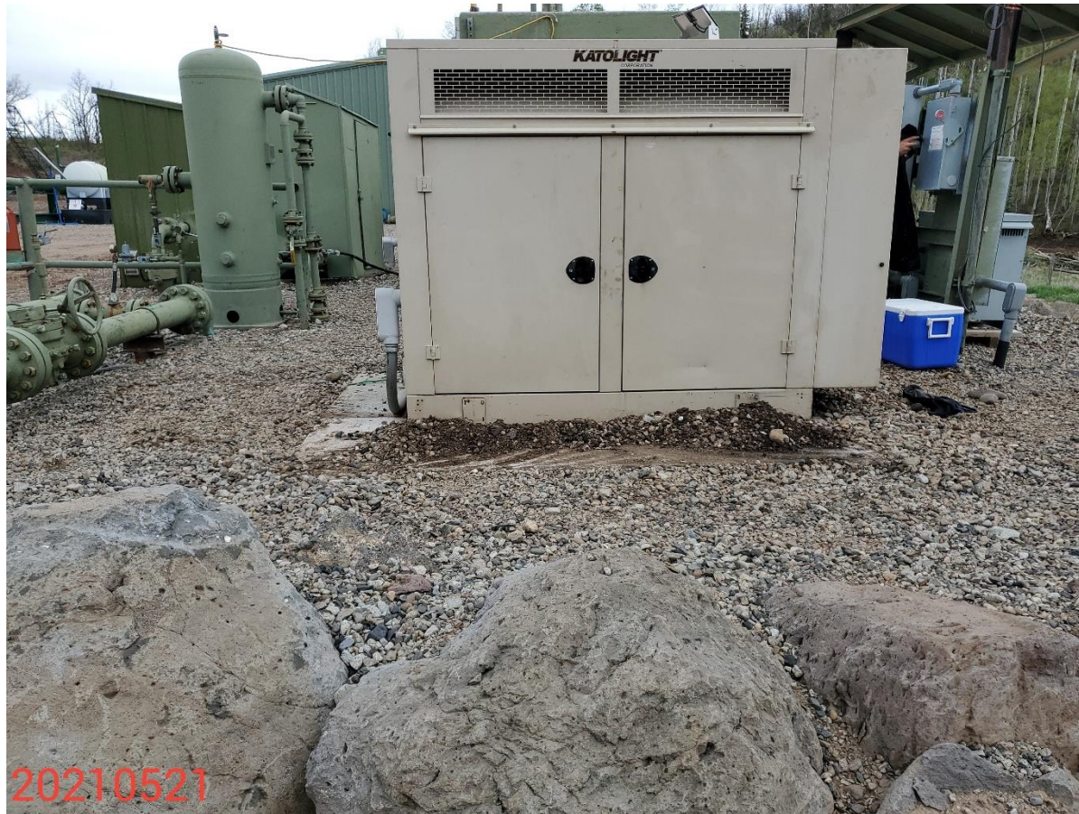
Photo 2: Photo show repair equipment and clean-up of stained soils around equipment was in process at time of inspection