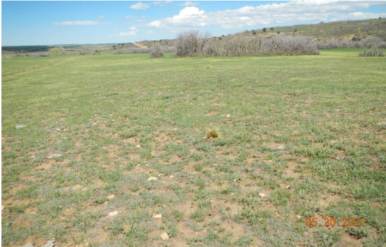
Photo 8. Facing northeast toward the surrounding undisturbed pasture which consists of perennial native vegetation.