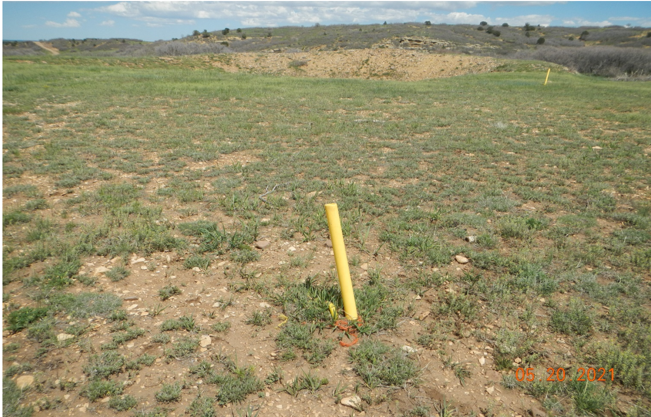
Photo 4. There are four guy line anchors that remain which should have been removed within 3 months of abandoning the well.