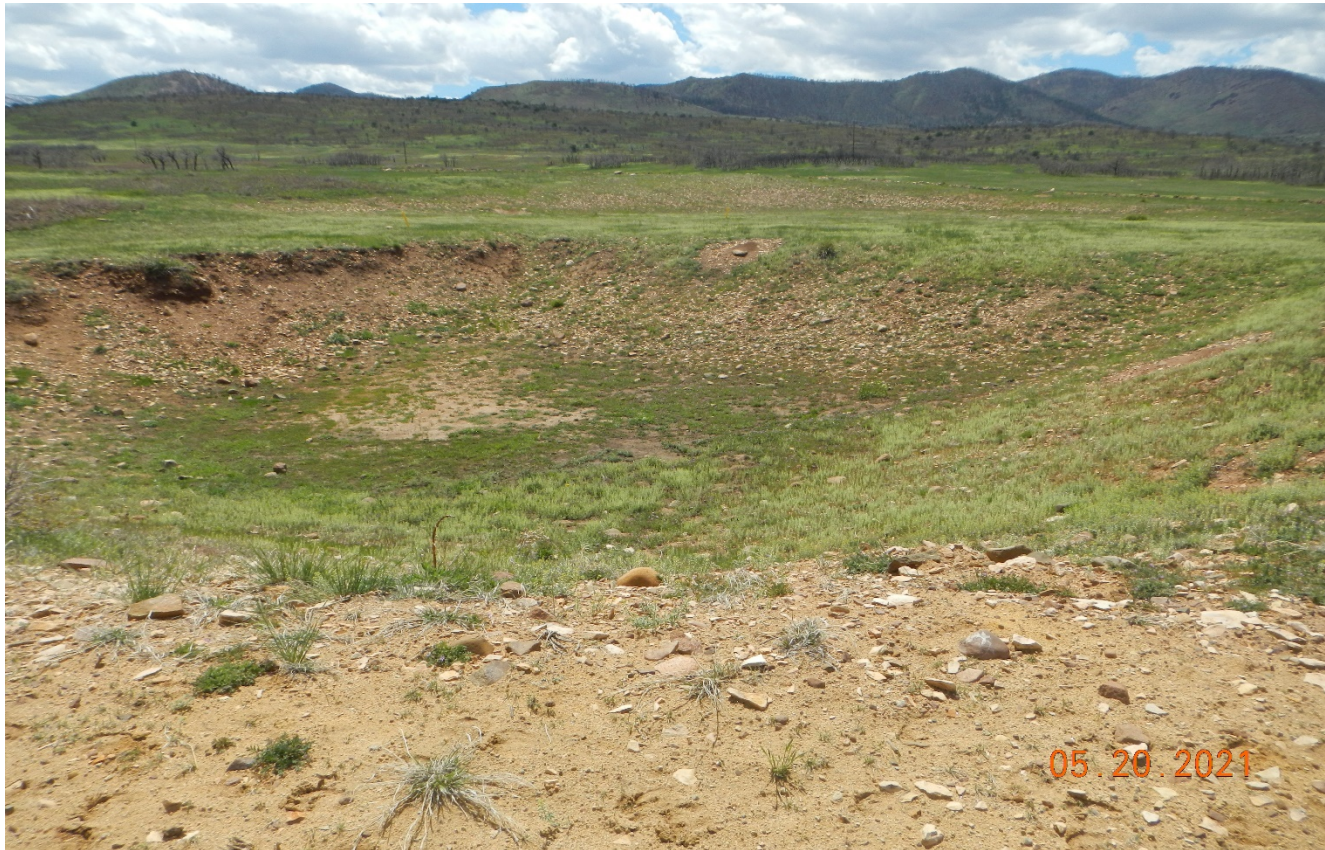
Photo 6. Facing southwest toward the pit which is approximately 100'x100' in size.