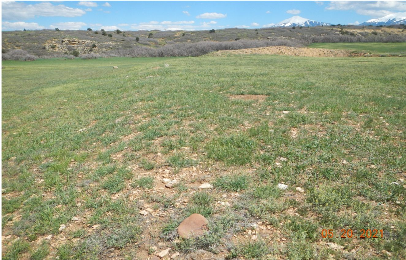
Photo 7. Facing southeast along the fill slope of the location which was never recontoured back to the original contours of the terrain.