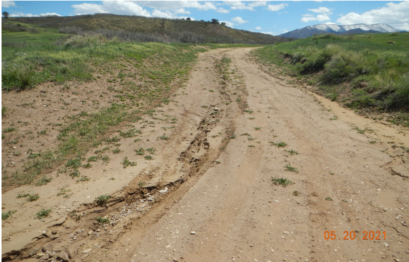
Photo 1. Facing south along the former access road which appears to be mostly pre-existing. There is erosion occurring along areas of the road which need to be stabilized.