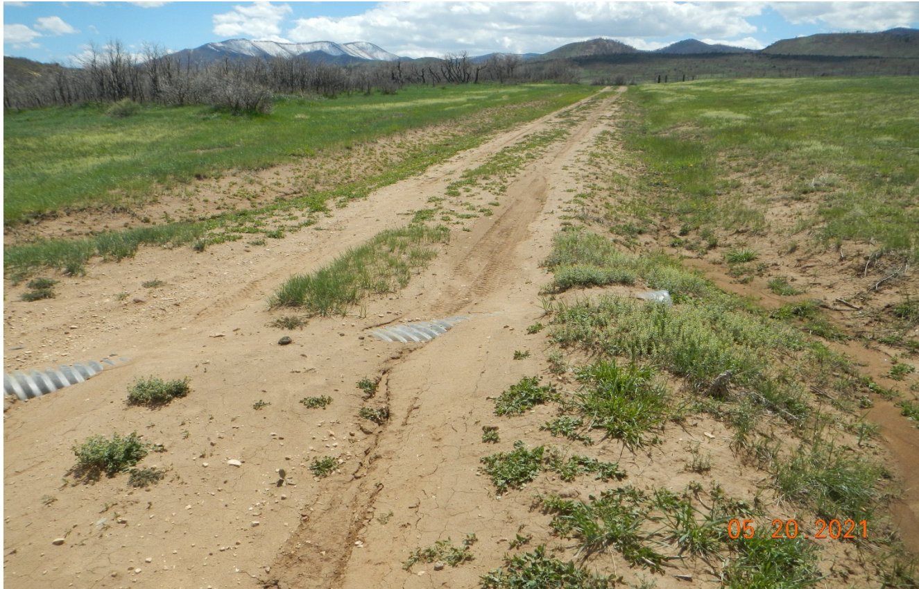
Photo 2. The culvert installed along the access road is not maintained and stormwater is bypassing the culvert. Lat/Long:37.50521,-105.07444.