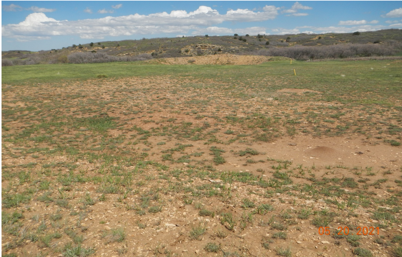
Photo 3. Facing northeast toward the location which was never recontoured and reclaimed per 1004 Rules.