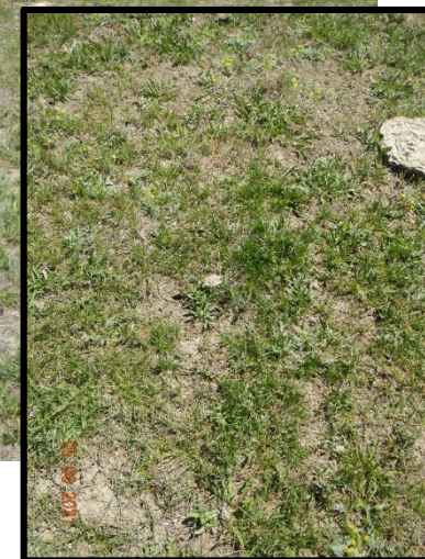
Photo#5: View over Pad to North. Insert, close up of pad vegetation.