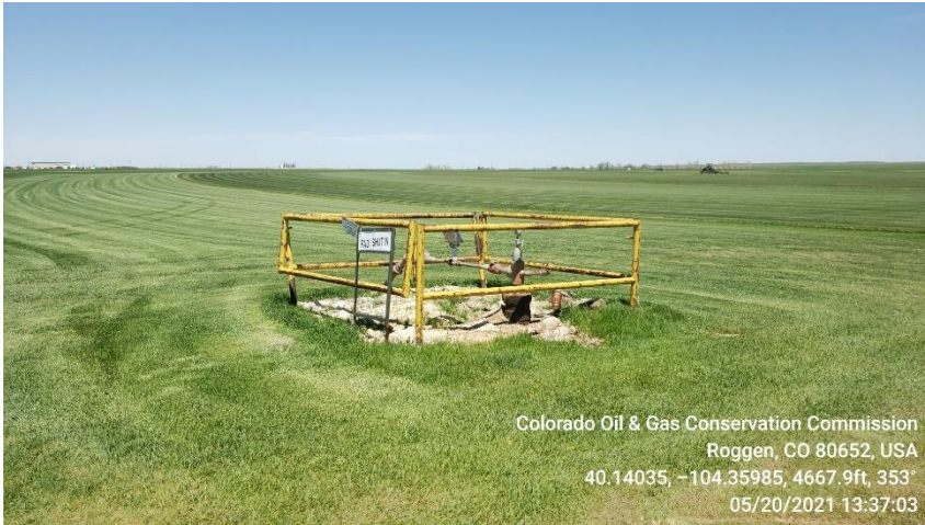
Photo 3 Weeds have been cut around WH