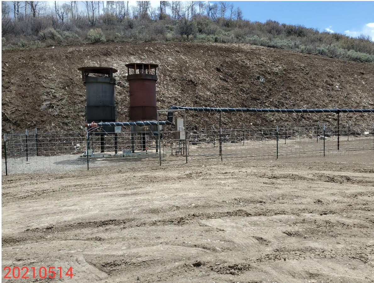
Photo 1: Photo taken from the north end of the Location, facing east. Photos 1-4 provide an overview of the production area from east, south, southwest to west.