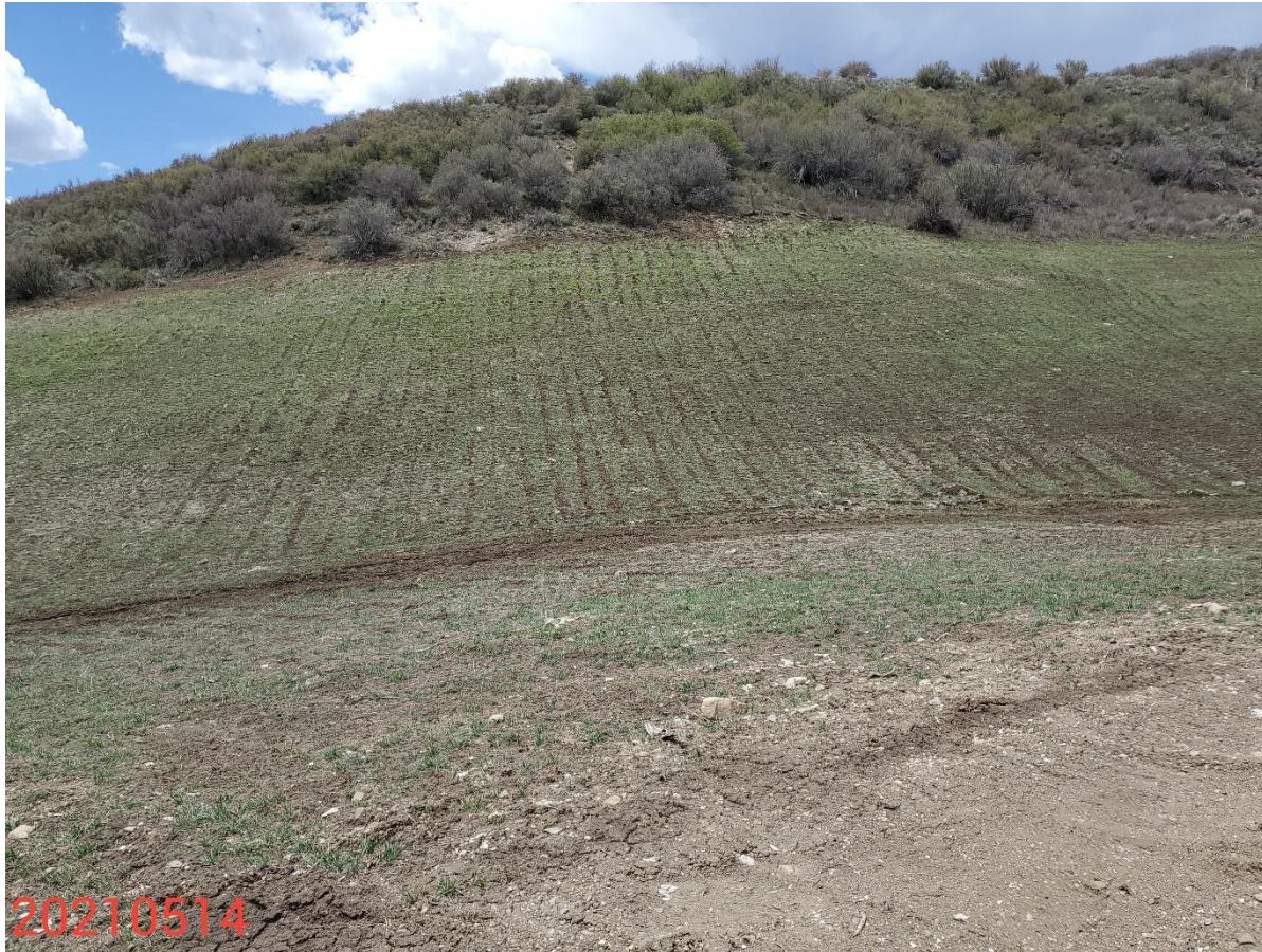
Photo 6: Photo taken from the interim areas on the southwest end of the Location, facing west. Interim reclamation in process.