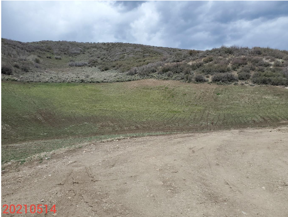
Photo 7: Photo taken from the interim areas on the southwest end of the Location, facing northwest. Interim reclamation in process.