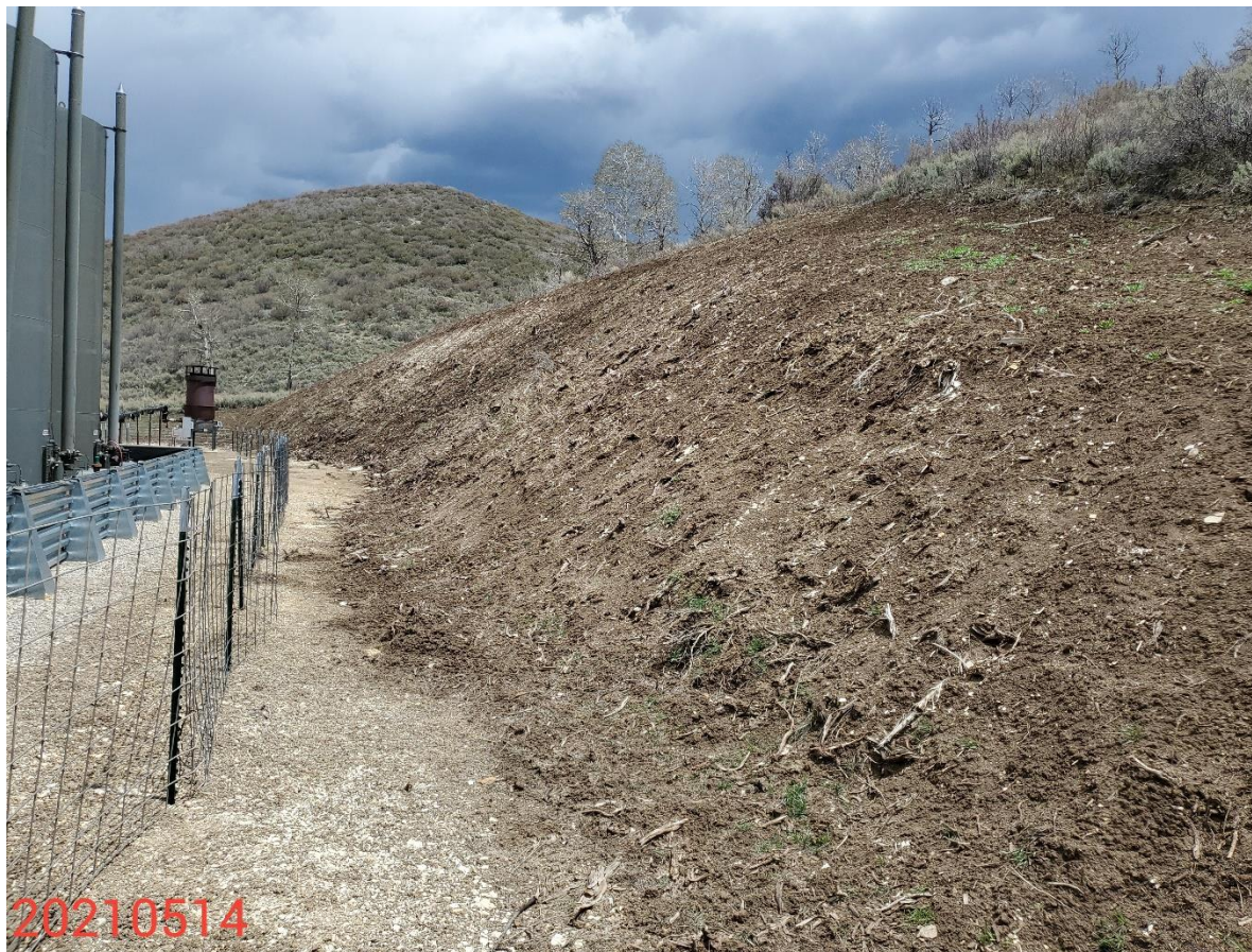
Photo 8: Photo taken from the cut slopes on the east end of the Location. Operator appears to have previously installed a hydromulch to the cut slopes; BMP is no longer in proper functioning condition; control measures to protect/stabilize cut slopes missing or insufficient.