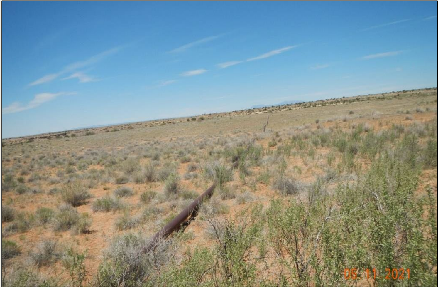
Photo 4. View of surface line remains in place, facing westward.