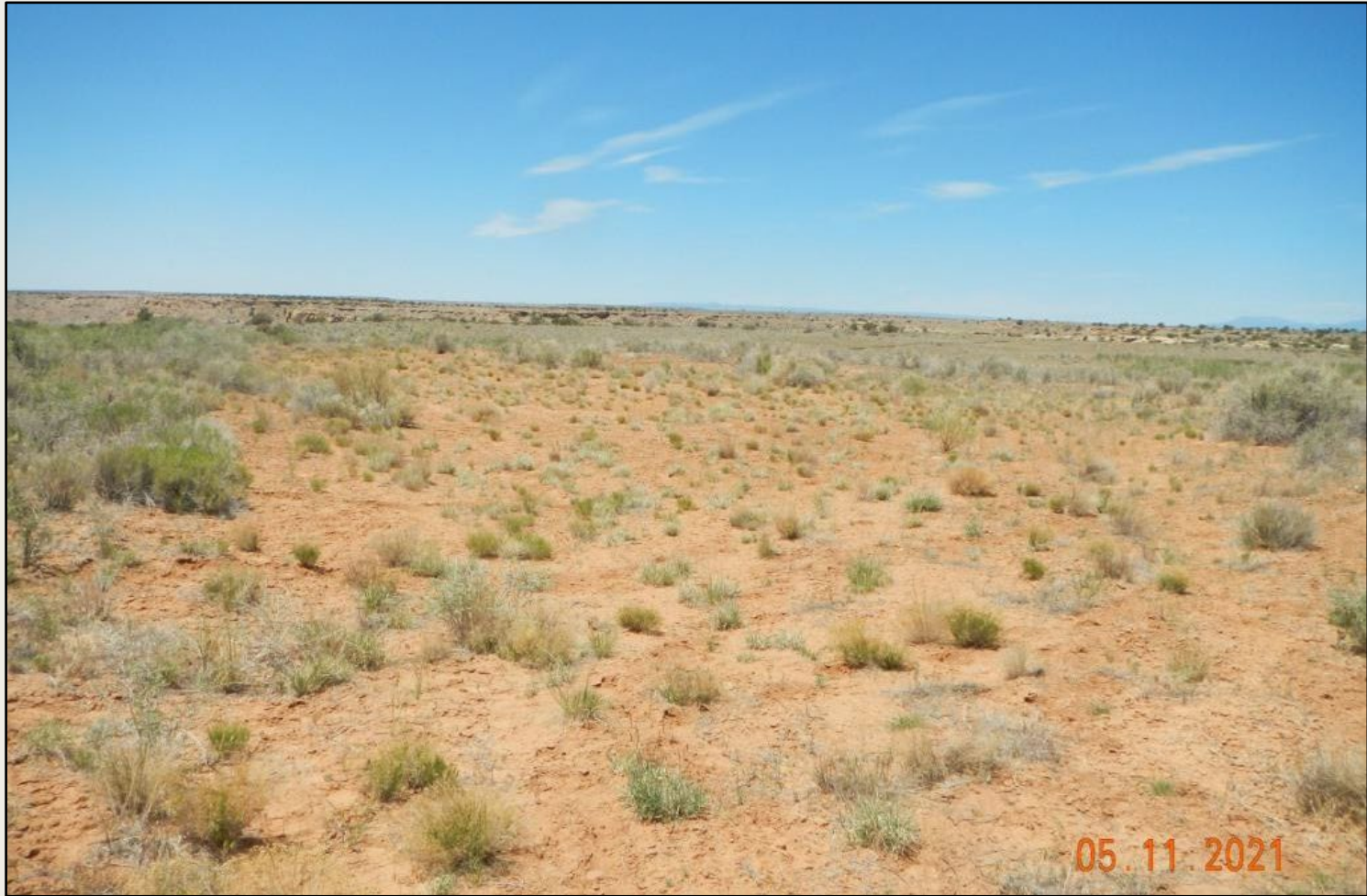
Photo 1. View of the project area from the well pad entrance facing center. Revegetation is progressing in portions of the project area with james galleta, Indian ricegrass, snakeweed, and rubber rabbitbrush.