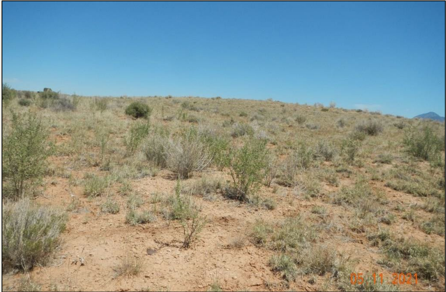
Photo 5. View of the reference area comprised of mixed james galleta grassland and wolfberry shrubland with a diversity of shrubs and herbs such as shadscale, purple threeawn, Indian paintbrush, and goldenaster.