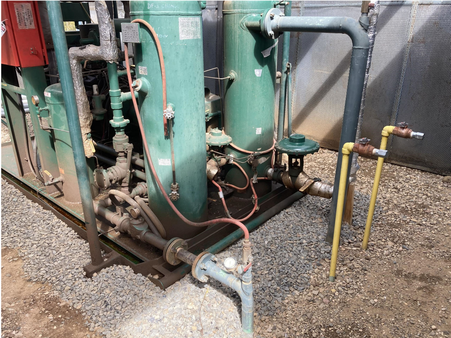
PHOTO 6: THE OIL ACCUMULATION WAS REMOVED FROM THE CONTAINMENT OF THE LIQUID RING COMPRESSOR.

APACHE CANYON 11-06 API# 05-071-08297 & APACHE CANYON 11-06V API# 05-071-09276 – TIMBER CREEK OPERATING OGCC OPERATOR NUMBER 10672 - DATE: MAY 14, 2021 CORRECTIVE ACTIONS COMPLETED REGARDING COGCC FIR DOCUMENT # 695103368