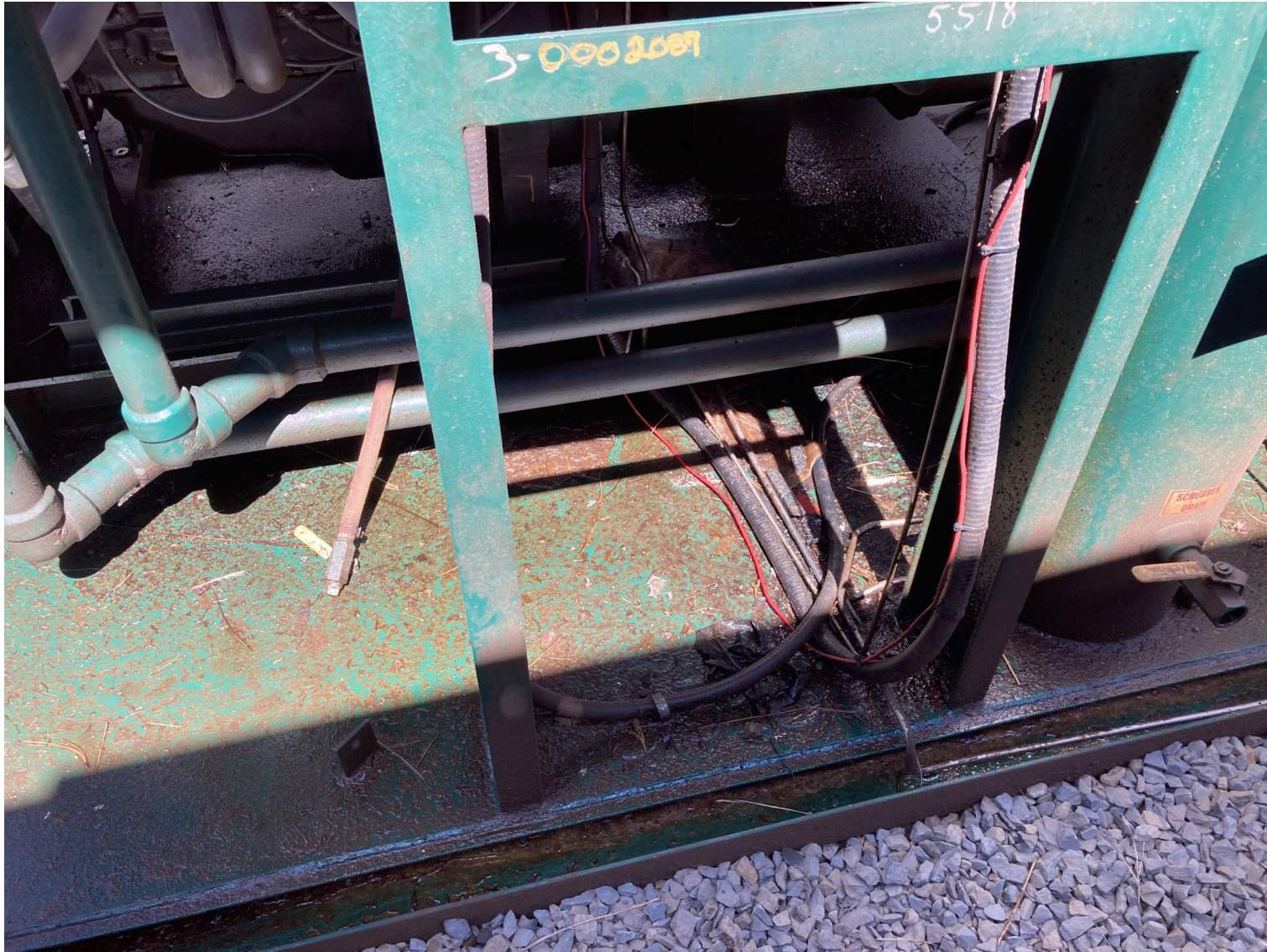
PHOTO 7: THE OIL LEAK WAS REPAIRED, ALL CONECTIONS ARE SECURELY FASTEN.

APACHE CANYON 11-06 API# 05-071-08297 & APACHE CANYON 11-06V API# 05-071-09276 – TIMBER CREEK OPERATING OGCC OPERATOR NUMBER 10672 - DATE: MAY 14, 2021 CORRECTIVE ACTIONS COMPLETED REGARDING COGCC FIR DOCUMENT # 695103368