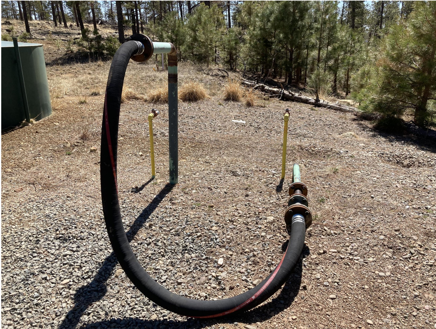
PHOTO 4: THE RISER'S ARE ACTUALLY A LOW PRESURE BY-PASS THAT ARE IN USE. EACH RISER WAS LABELED AS TO IT'S FUNCTION.

APACHE CANYON 11-06 API# 05-071-08297 & APACHE CANYON 11-06V API# 05-071-09276 – TIMBER CREEK OPERATING OGCC OPERATOR NUMBER 10672 - DATE: MAY 14, 2021 CORRECTIVE ACTIONS COMPLETED REGARDING COGCC FIR DOCUMENT # 695103368