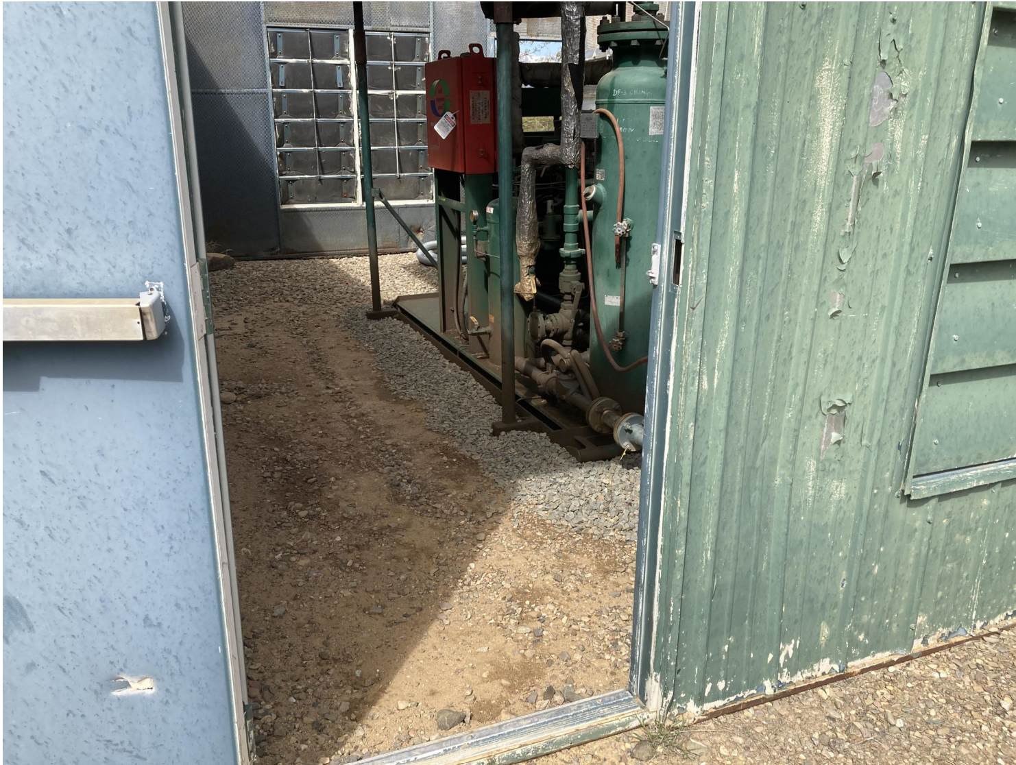
PHOTO 3: THE IMPACTED SOIL NEAR THE LIQUID RING COMPRESSOR WAS REMOVED AND PROPERLY DISPOSED IN ACCORDANCE WITH THE OGRIS OPERATING WASTE MANAGEMENT PLAN.

APACHE CANYON 11-06 API# 05-071-08297 & APACHE CANYON 11-06V API# 05-071-09276 – TIMBER CREEK OPERATING OGCC OPERATOR NUMBER 10672 - DATE: MAY 14, 2021 CORRECTIVE ACTIONS COMPLETED REGARDING COGCC FIR DOCUMENT # 695103368