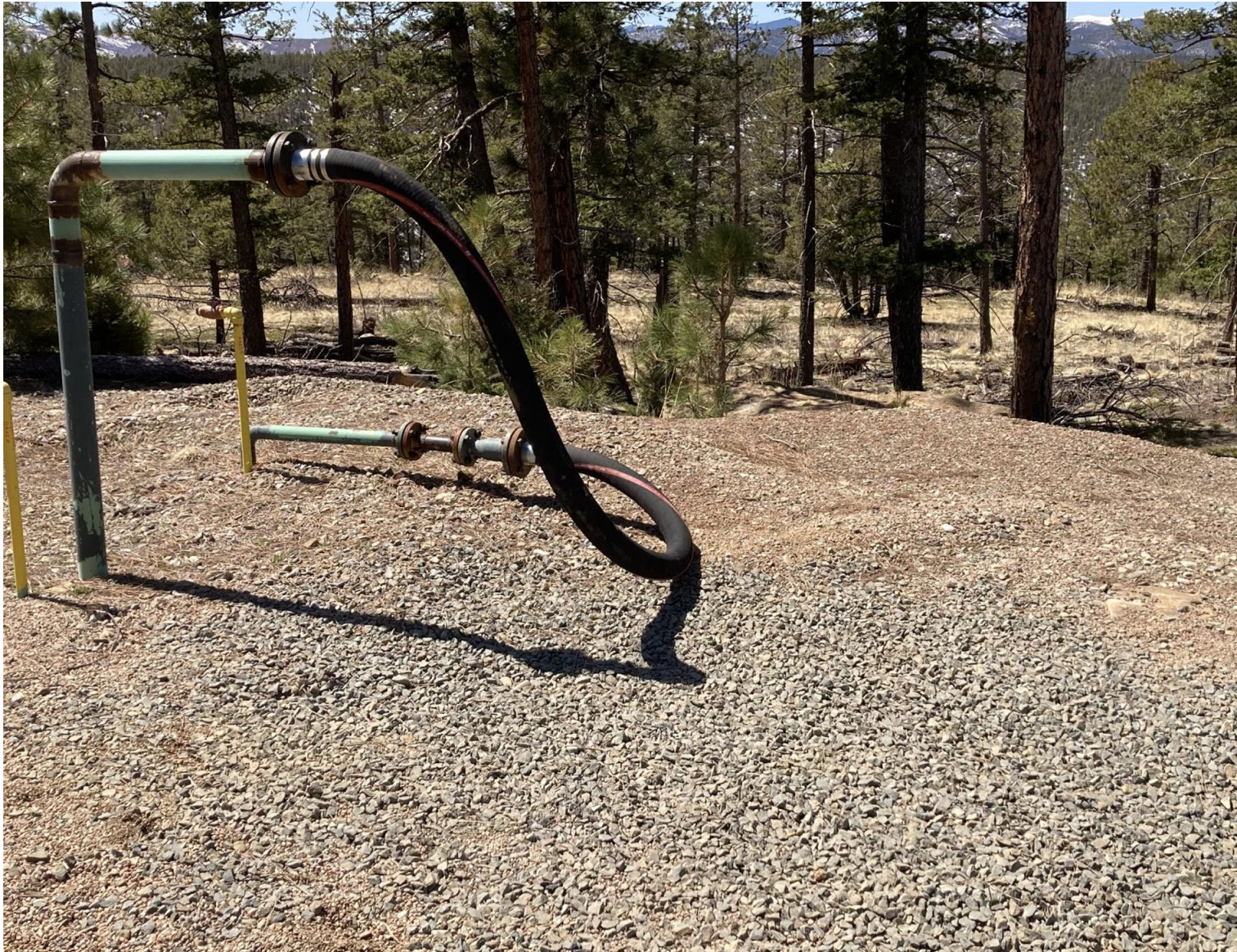
PHOTO 1: THE IMPACTED SOIL NEAR THE RISERS WAS REMOVED AND PROPERLY DISPOSED IN ACCORDANCE WITH THE OGRIS OPERATING WASTE MANAGEMENT PLAN.

APACHE CANYON 11-06 API# 05-071-08297 & APACHE CANYON 11-06V API# 05-071-09276 – TIMBER CREEK OPERATING OGCC OPERATOR NUMBER 10672 - DATE: MAY 14, 2021 CORRECTIVE ACTIONS COMPLETED REGARDING COGCC FIR DOCUMENT # 695103368