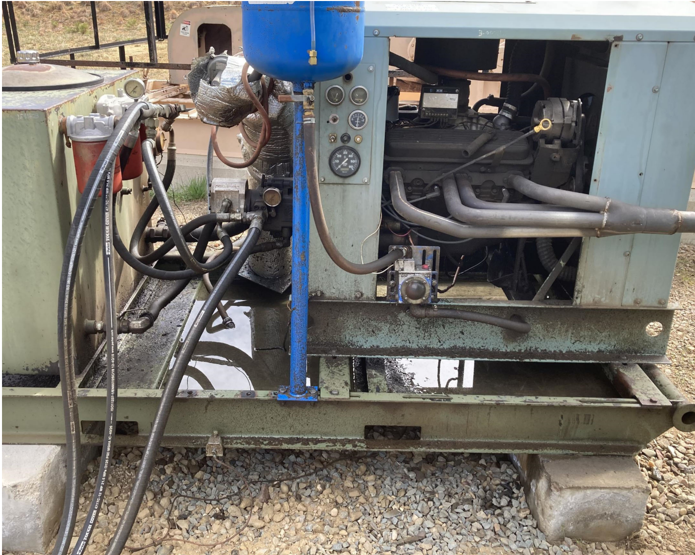
PHOTO 2: THE IMPACTED SOIL NEAR THE ENGINE SKID WAS REMOVED AND PROPERLY DISPOSED IN ACCORDANCE WITH THE OGRIS OPERATING WASTE MANAGEMENT PLAN.

APACHE CANYON 11-06 API# 05-071-08297 & APACHE CANYON 11-06V API# 05-071-09276 – TIMBER CREEK OPERATING OGCC OPERATOR NUMBER 10672 - DATE: MAY 14, 2021 CORRECTIVE ACTIONS COMPLETED REGARDING COGCC FIR DOCUMENT # 695103368