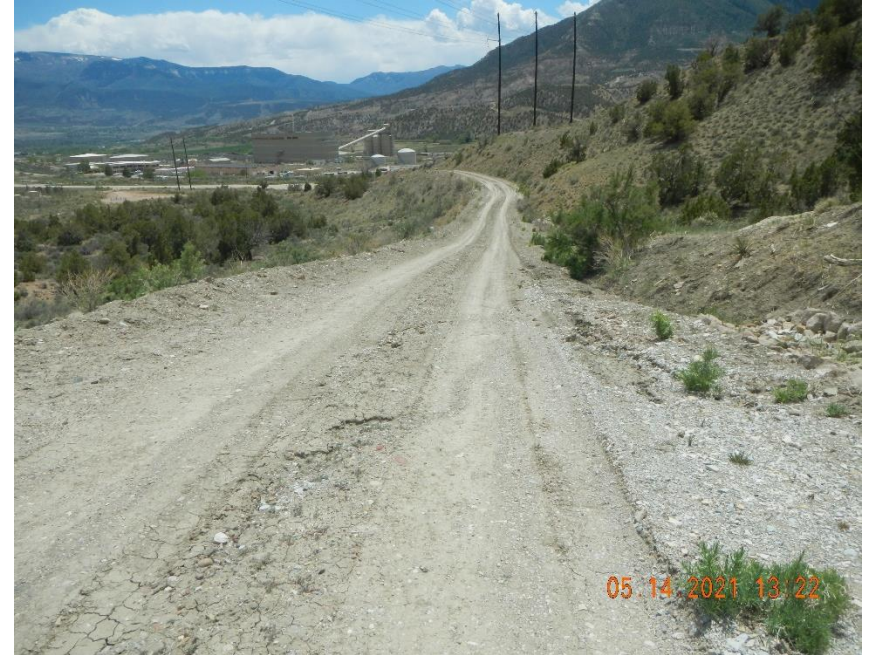
Riling along berm running to access road.