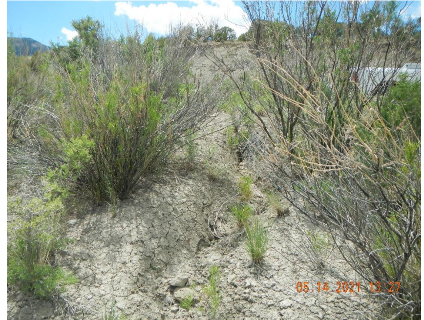
Channeling in perimeter berm.