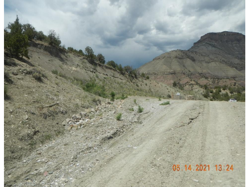
Riling from location running along ditch on access road.