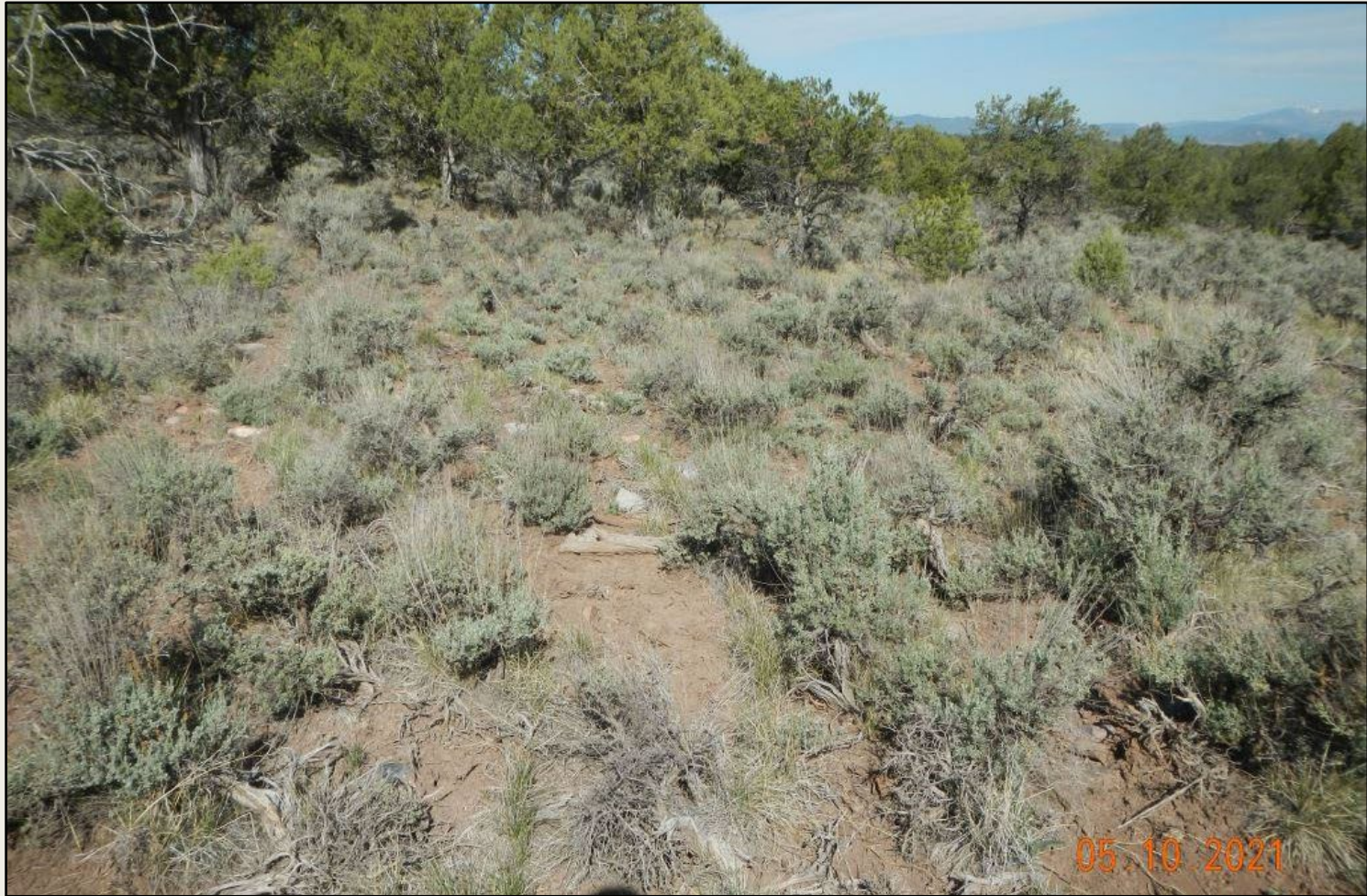
Photo 4. View of the reference area comprised of sagebrush shrubland with scattered pinyon and juniper trees, squirreltail, western wheatgrass, and forbs such as penstemon, and phlox.