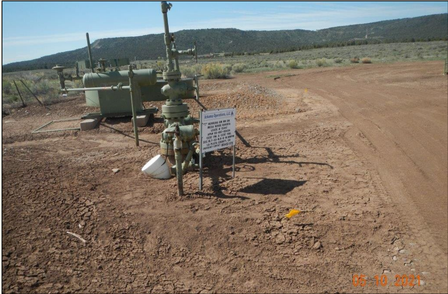
Photo 1. View of the project area from the well pad entrance facing southward.