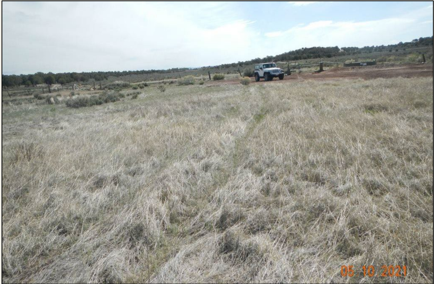
Photo 3. View of the northern project area from the northwestern corner facing eastward.