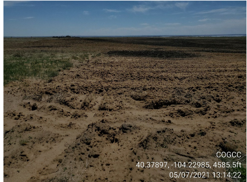
Photo 10 Northeast corner of land application site looking south