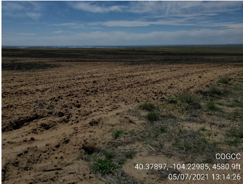
Photo 11 Northeast corner of land application site looking southwest