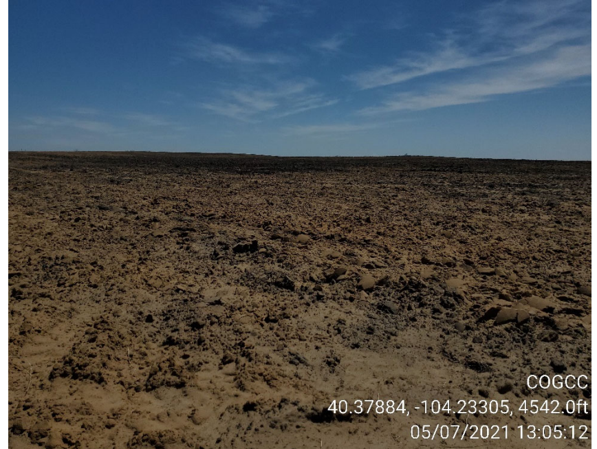
Photo 2 Northwest corner of land application site looking southeast.