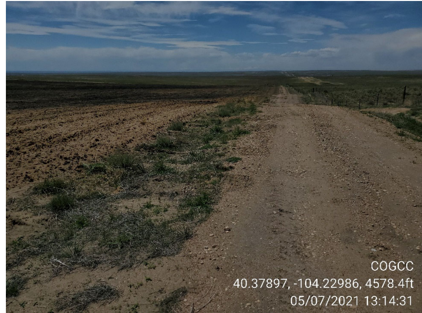
Photo 12 Northeast corner of land application site looking west