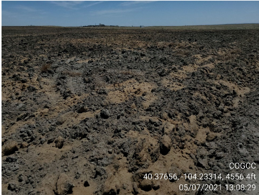
Photo 7 West side of land application site looking southeast.