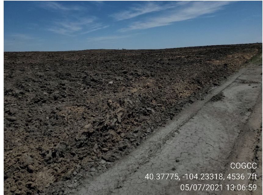
Photo 6 West side of land application site looking southeast.