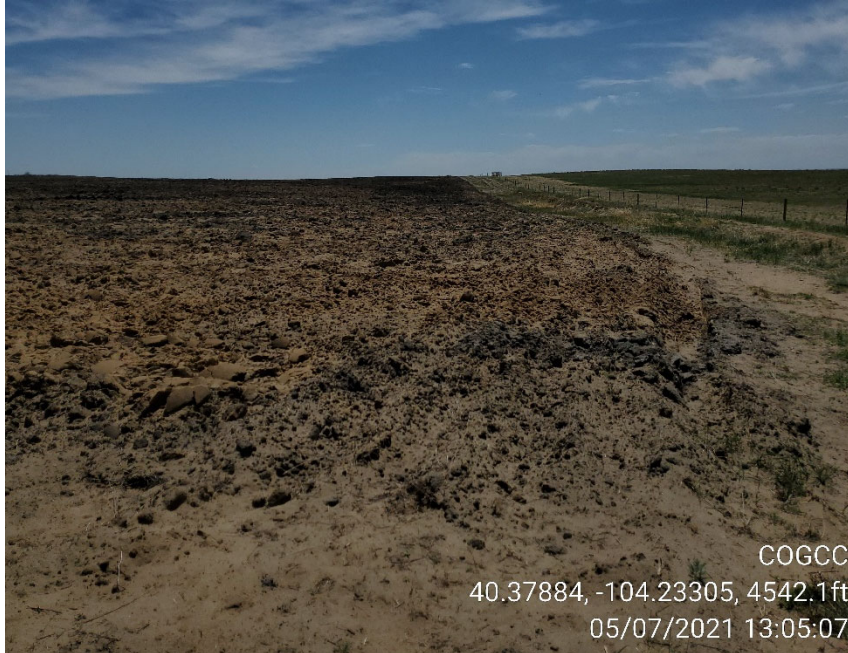
Photo 1 Northwest corner of land application site looking south.