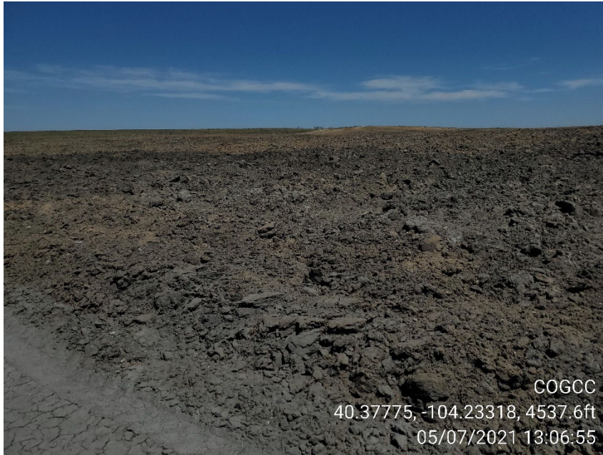
Photo 5 West side of land application site looking northeast.