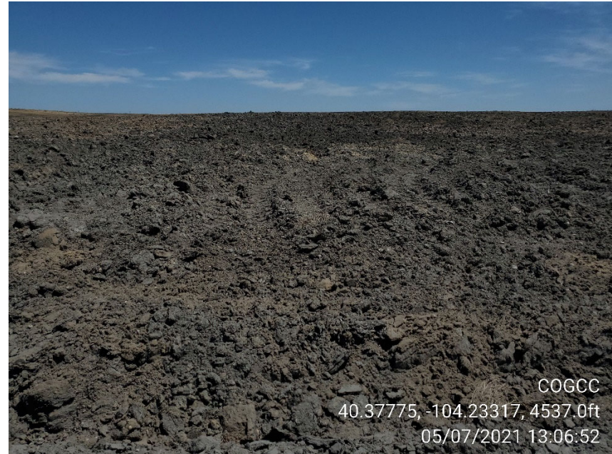
Photo 4 West side of land application site looking east.