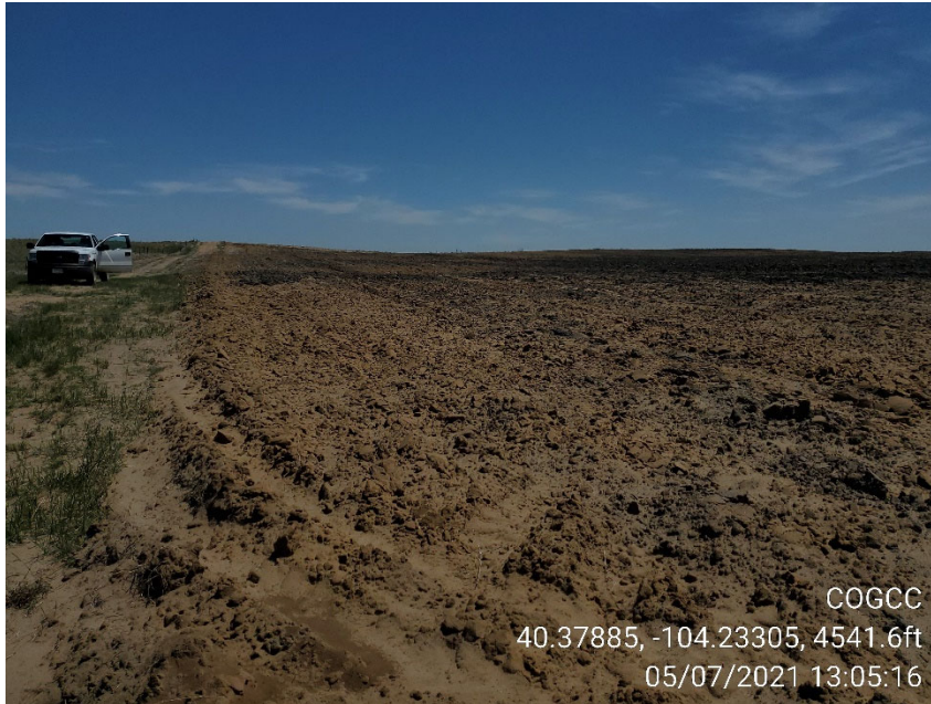
Photo 3 Northwest corner of land application site looking east.