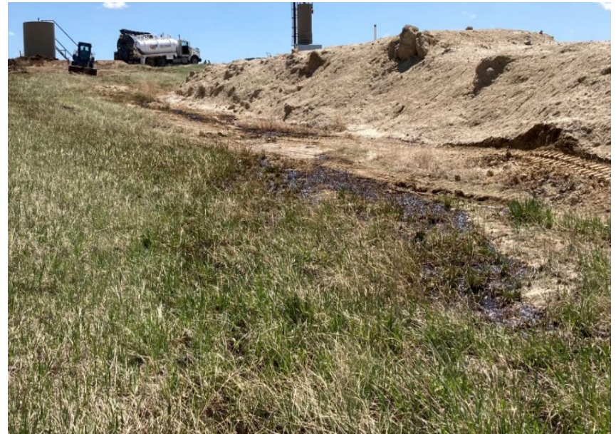
Nnorth of Bobcat along spill path. Photo looking SSW. Pit berm on right.