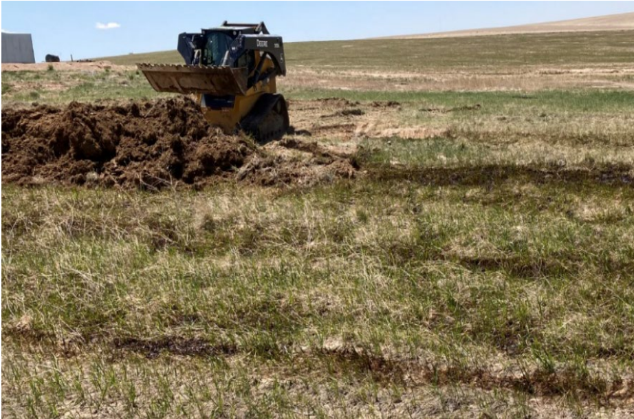
Photo looking west along spill path. Bobcat scraping to remove spill material.

Location Name: Cordes #3 Tank Battery – Spill/Release Inspection (Spill Point #479951) NESW Section 7 – Township 1 South - Range 57 West Adams County