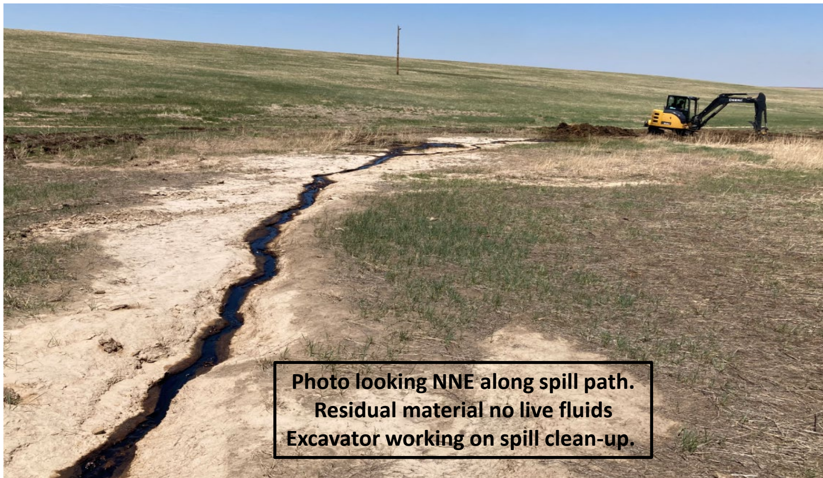
Photo looking NNE along spill path. Residual material no live fluids Excavator working on spill clean-up.

Location Name: Cordes #3 Tank Battery – Spill/Release Inspection (Spill Point #479951) NESW Section 7 – Township 1 South - Range 57 West Adams County