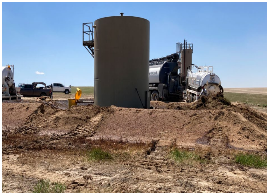
Tank. Photo looking east