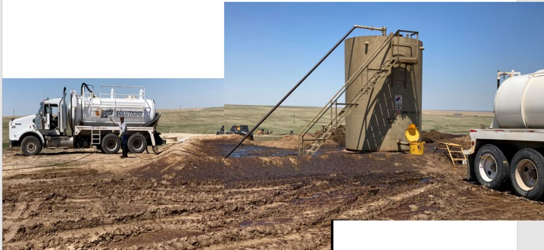
Fluid removal. Photo looking north

Location Name: Cordes #3 Tank Battery – Spill/Release Inspection (Spill Point #479951) NESW Section 7 – Township 1 South - Range 57 West Adams County