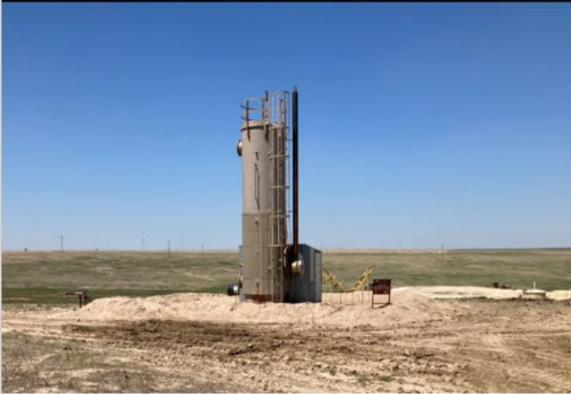
Photo looking due north to treater.