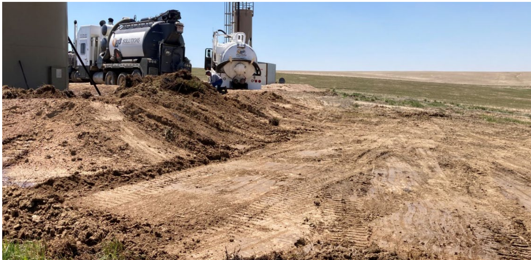
Location of berm failure on NE side of containment. Foreground scraped to remove spill material. Photo looking west.

Location Name: Cordes #3 Tank Battery – Spill/Release Inspection (Spill Point #479951) NESW Section 7 – Township 1 South - Range 57 West Adams County