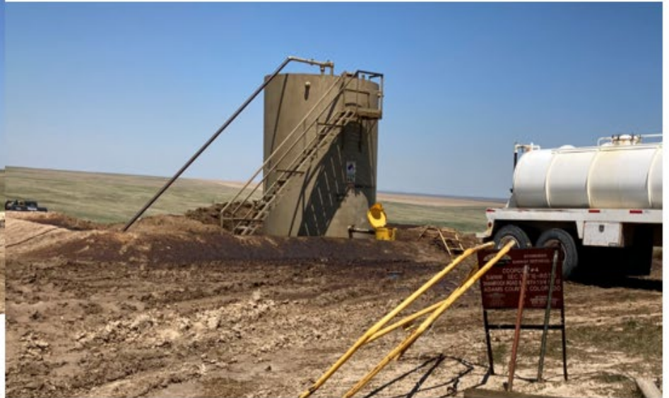
Photo looking north - tank