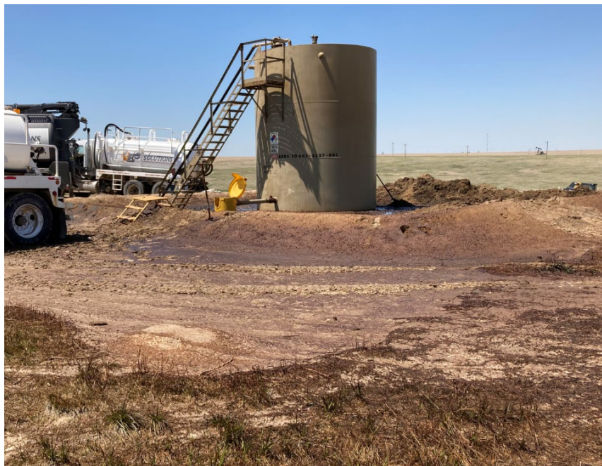
Tank. Photo looking NNE

Location Name: Cordes #3 Tank Battery – Spill/Release Inspection (Spill Point #479951) NESW Section 7 – Township 1 South - Range 57 West Adams County