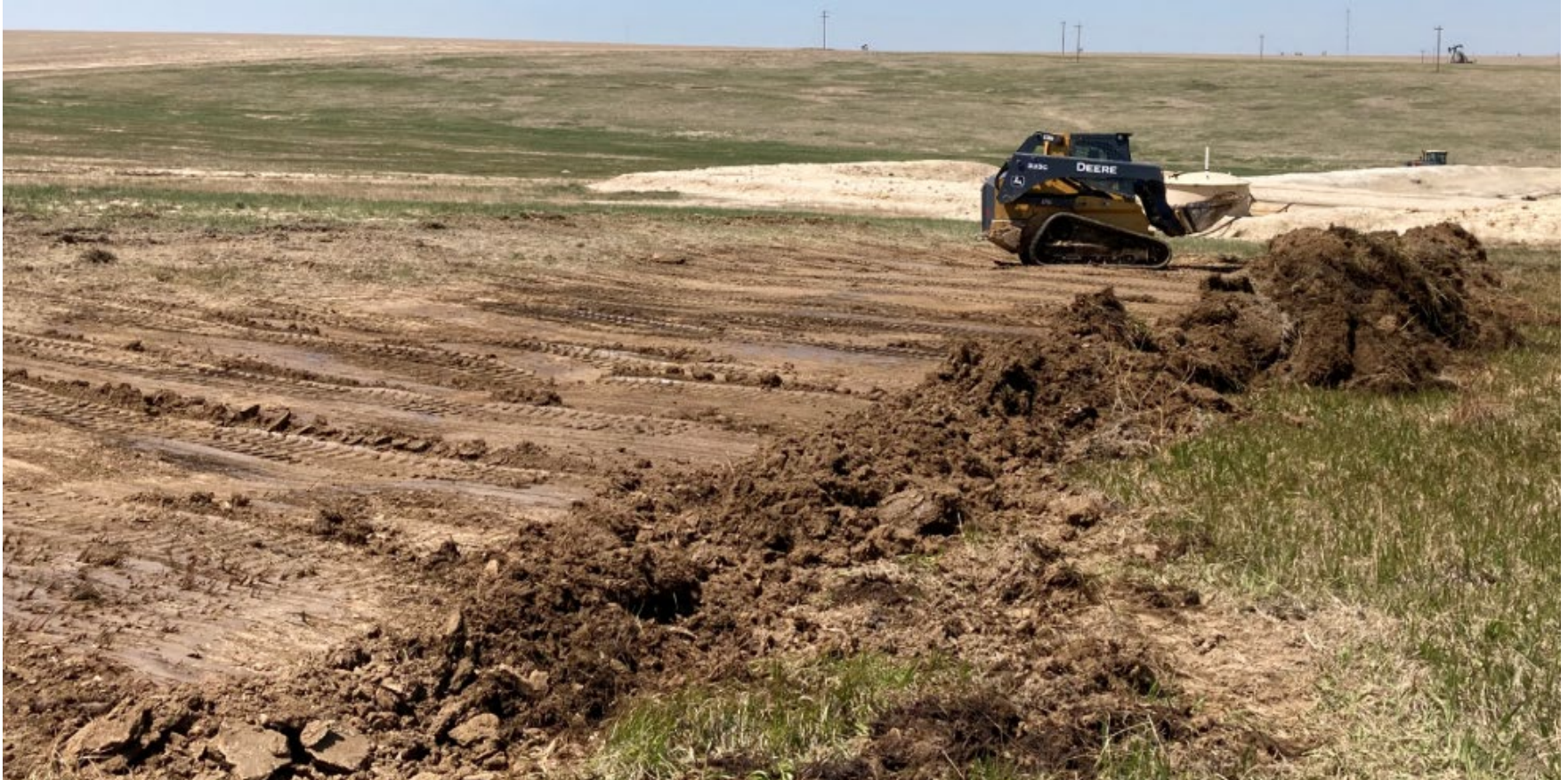
Photo looking north along spill path. Foreground scraped to remove spill material. Pit berm in background

Location Name: Cordes #3 Tank Battery – Spill/Release Inspection (Spill Point #479951) NESW Section 7 – Township 1 South - Range 57 West Adams County