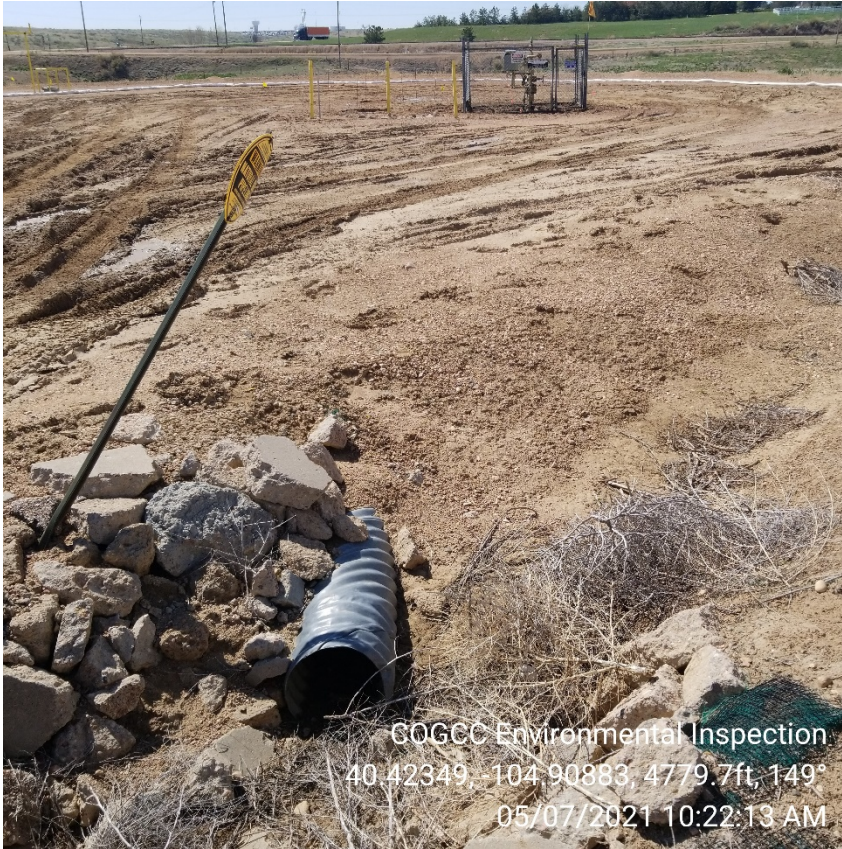
Photo 5 – Stormwater diversions designed to carry rainwater from the wellhead/spill area.