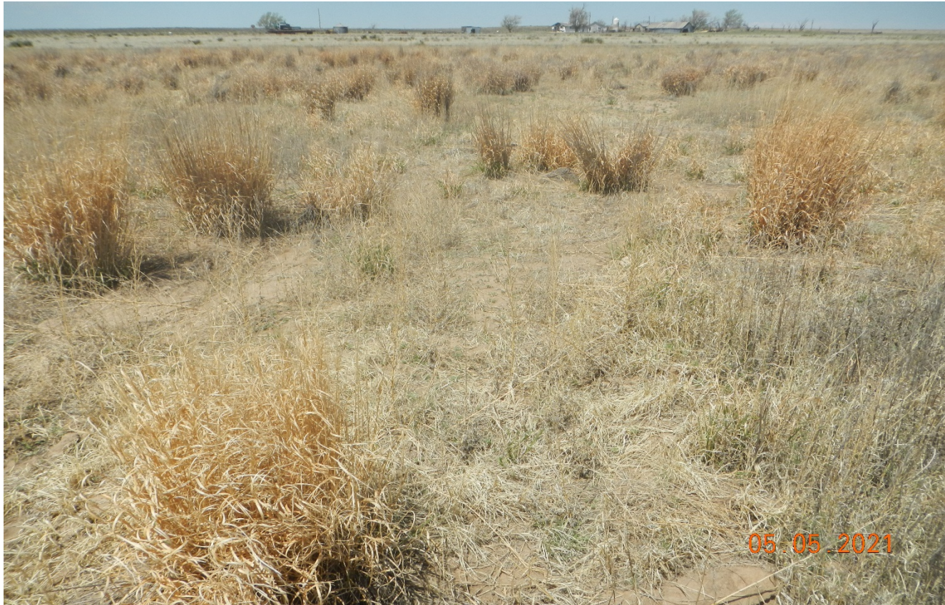
Photo 5. Facing toward the surrounding reference area.