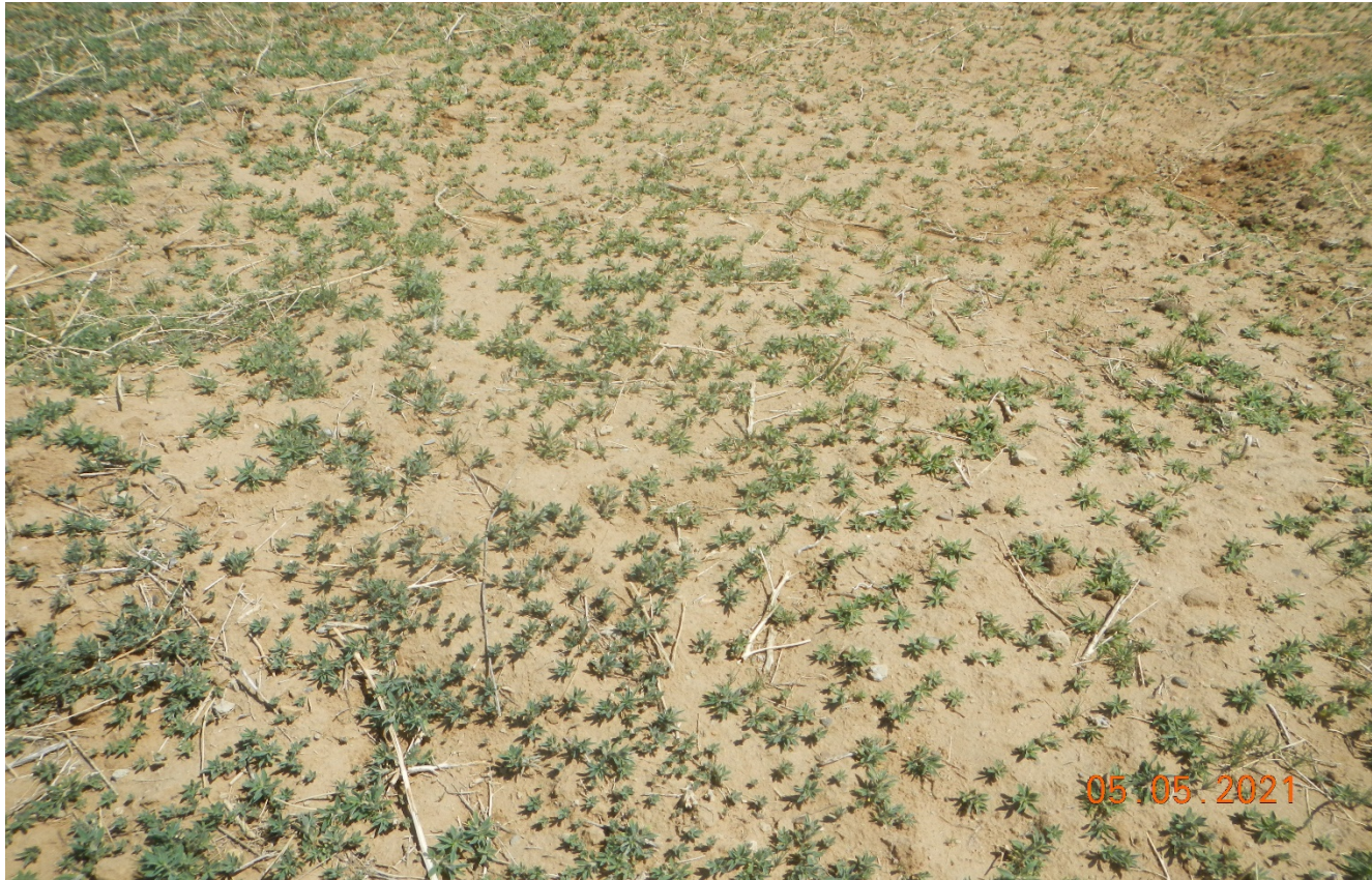
Photo 4. View of ground cover shows undesirable weeds establishing (Kochia).