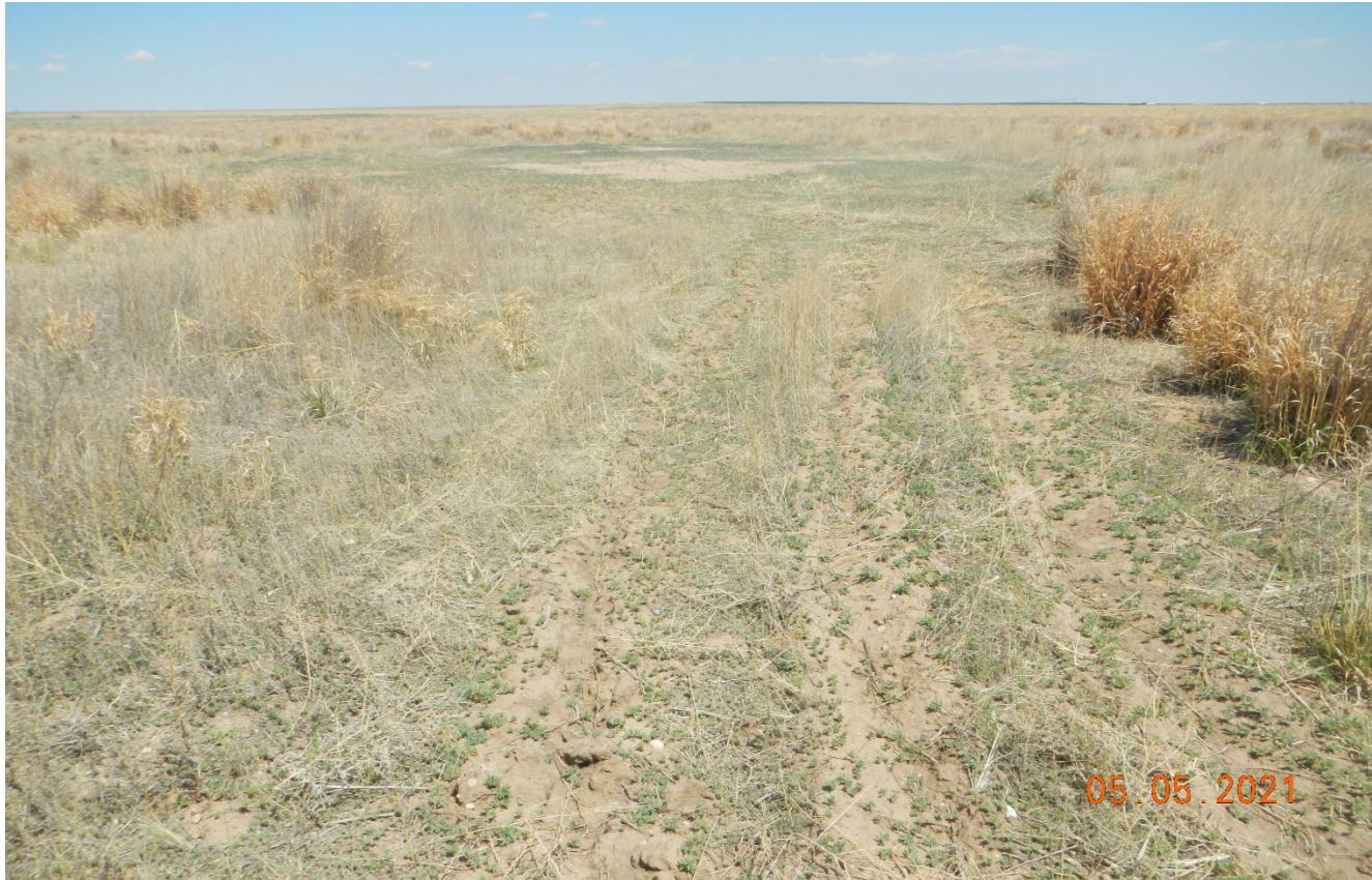
Photo 1. Facing north along the former access road.