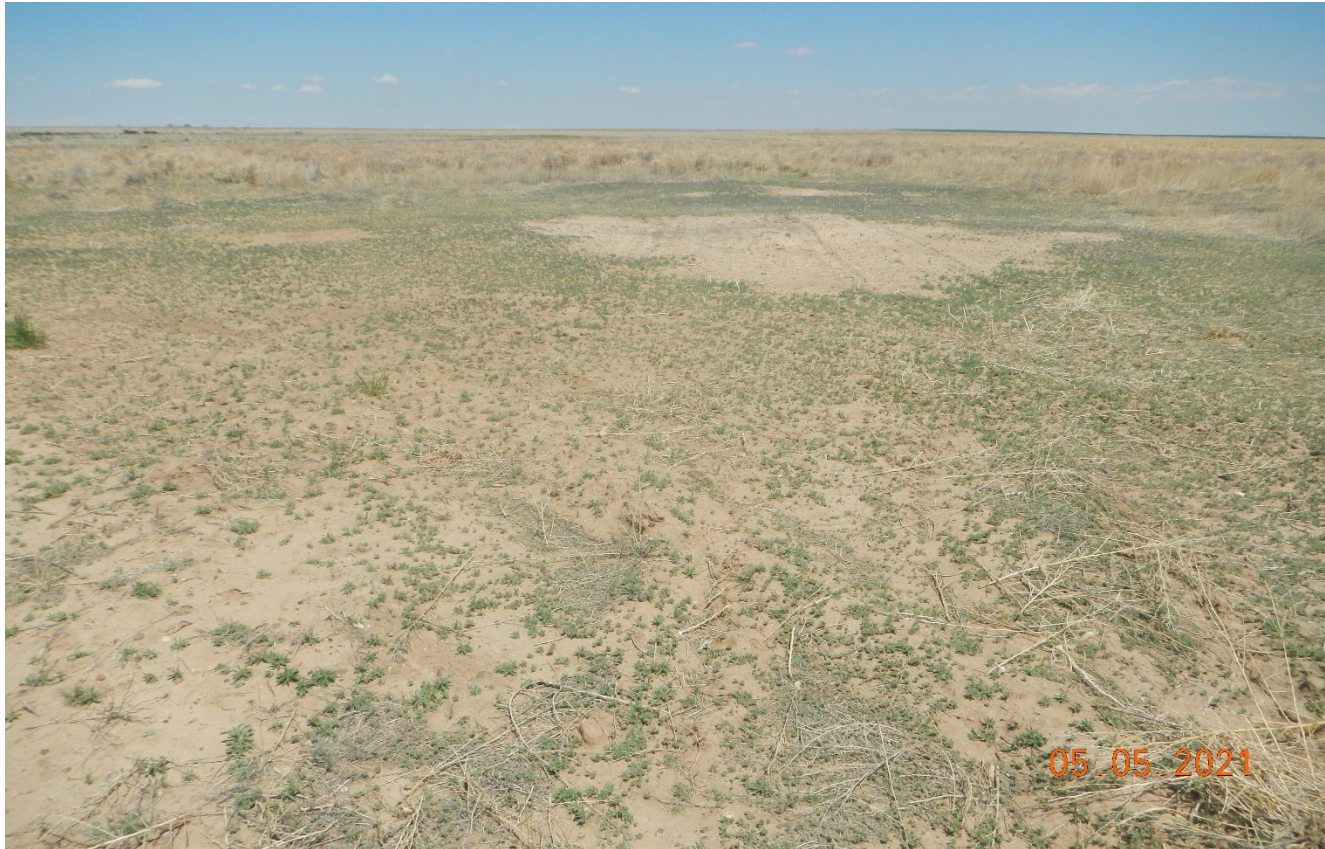
Photo 2. Facing north toward the location. Desirable vegetation cover has not established at the location.