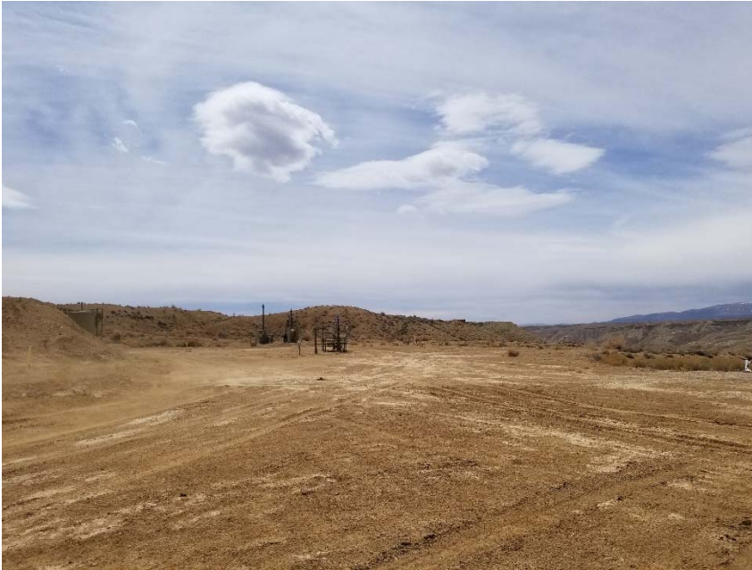
Photo 1. Overview of location taken facing south.