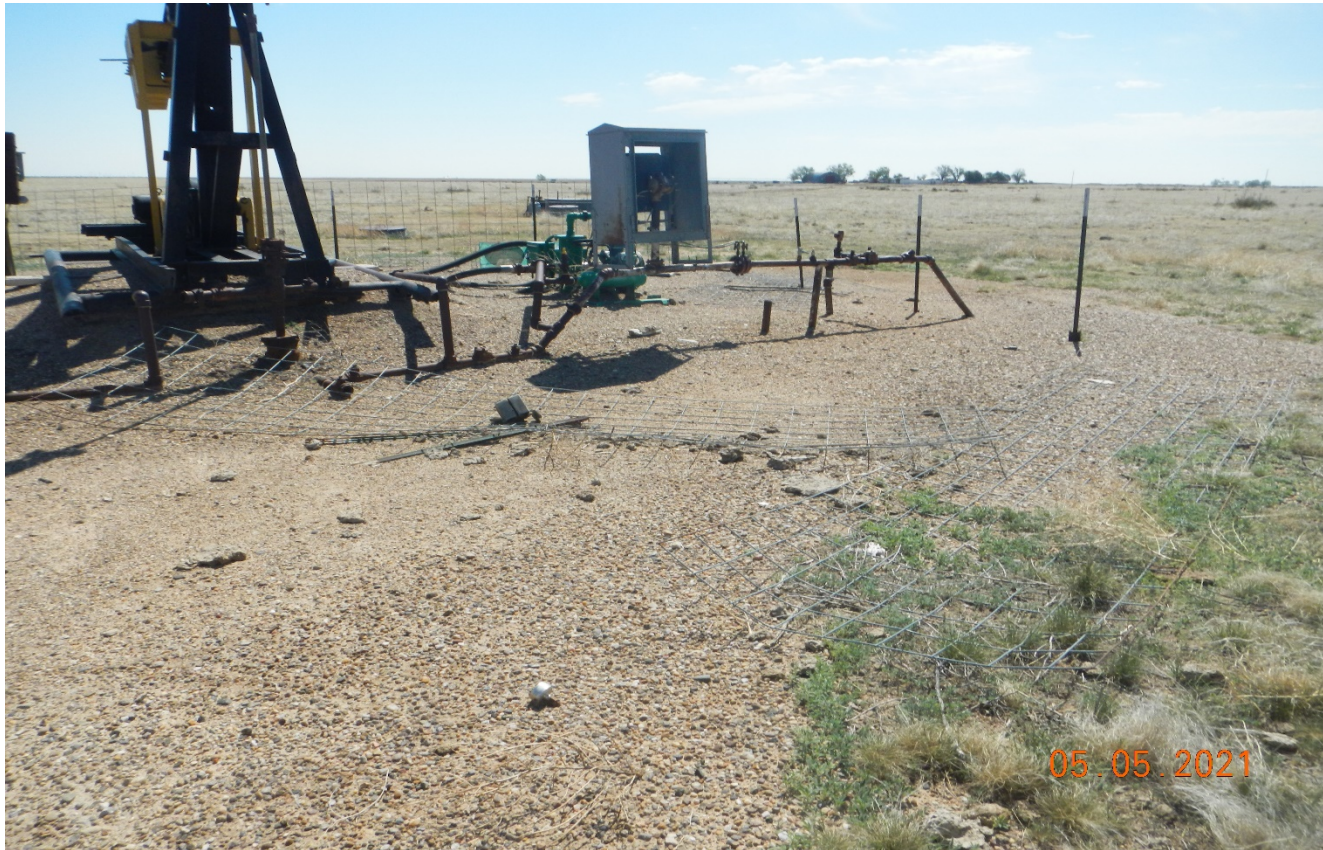
Photo 3. The fencing around the pump jack is not maintained and is laying on the ground.