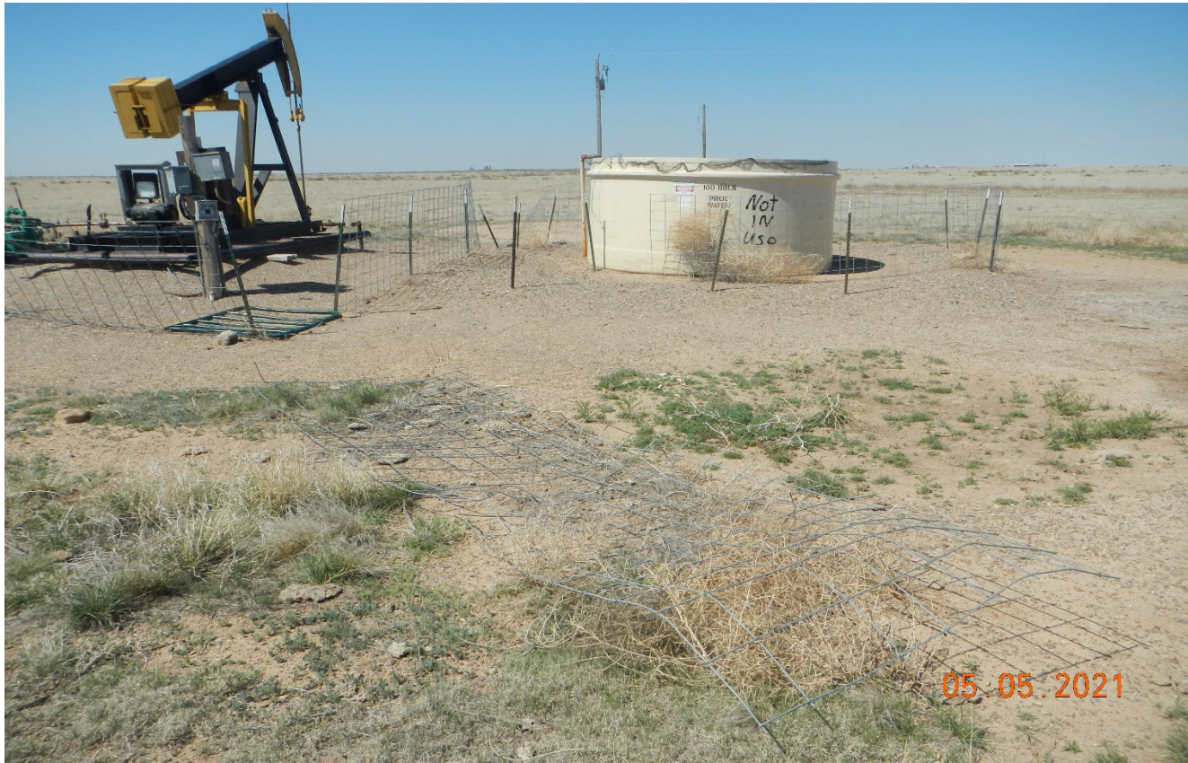
Photo 4. The tank is marked as not in use and labeled Produced Water. Next photo shows fluids inside the tank which apparently the tank is in use. Secondary containment is inadequate to contain 150% of the volume of the tank.