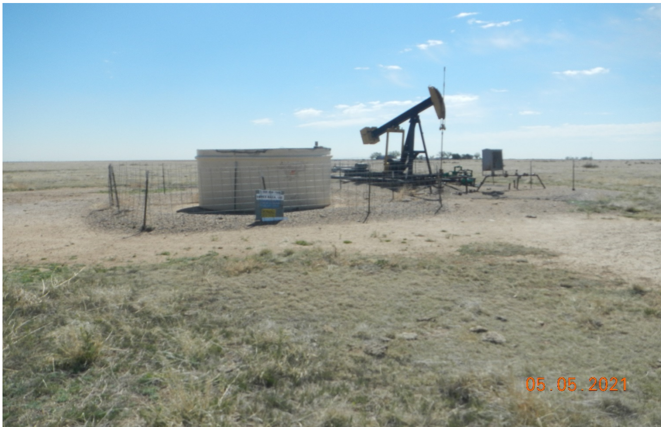
Photo 1. Facing east toward the location..