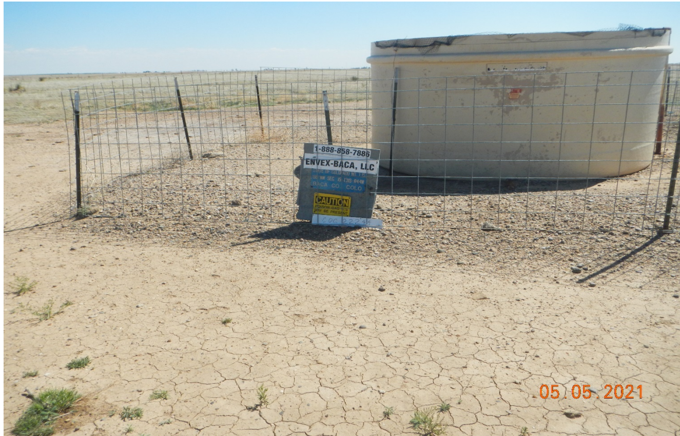
Photo 2. The well sign does not comply with 605. Incorrect Operator name and missing information. Missing tank NFPA labeling and missing INFO.