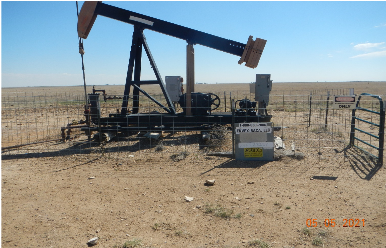
Photo 5. The well sign does not comply with 605. The gate and fence around the pumpjack has been repaired.