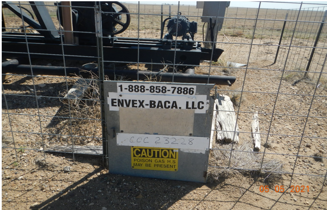
Photo 6. The well sign does not comply with 605. Incorrect Operator name and missing information.