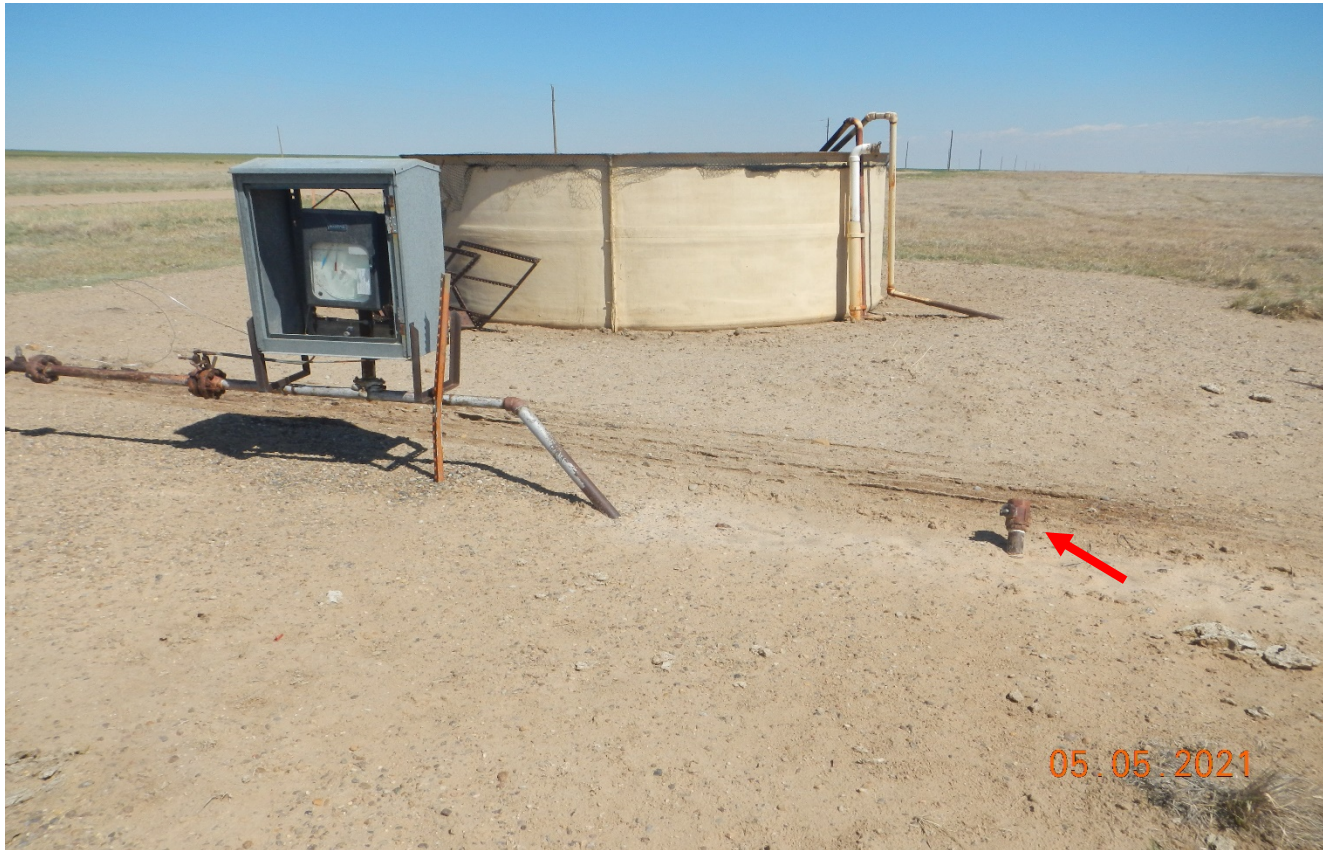
Photo 4. The unused pipe has been removed. There is a pipe riser shown at red arrow with no LOTO.