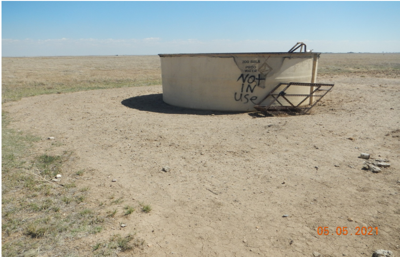
Photo 2. The tank is marked as not in use and labeled Produced Water. Next photo shows oily fluids inside the tank which apparently the tank is in use. Secondary containment is inadequate to contain 150% of the volume of the tank.