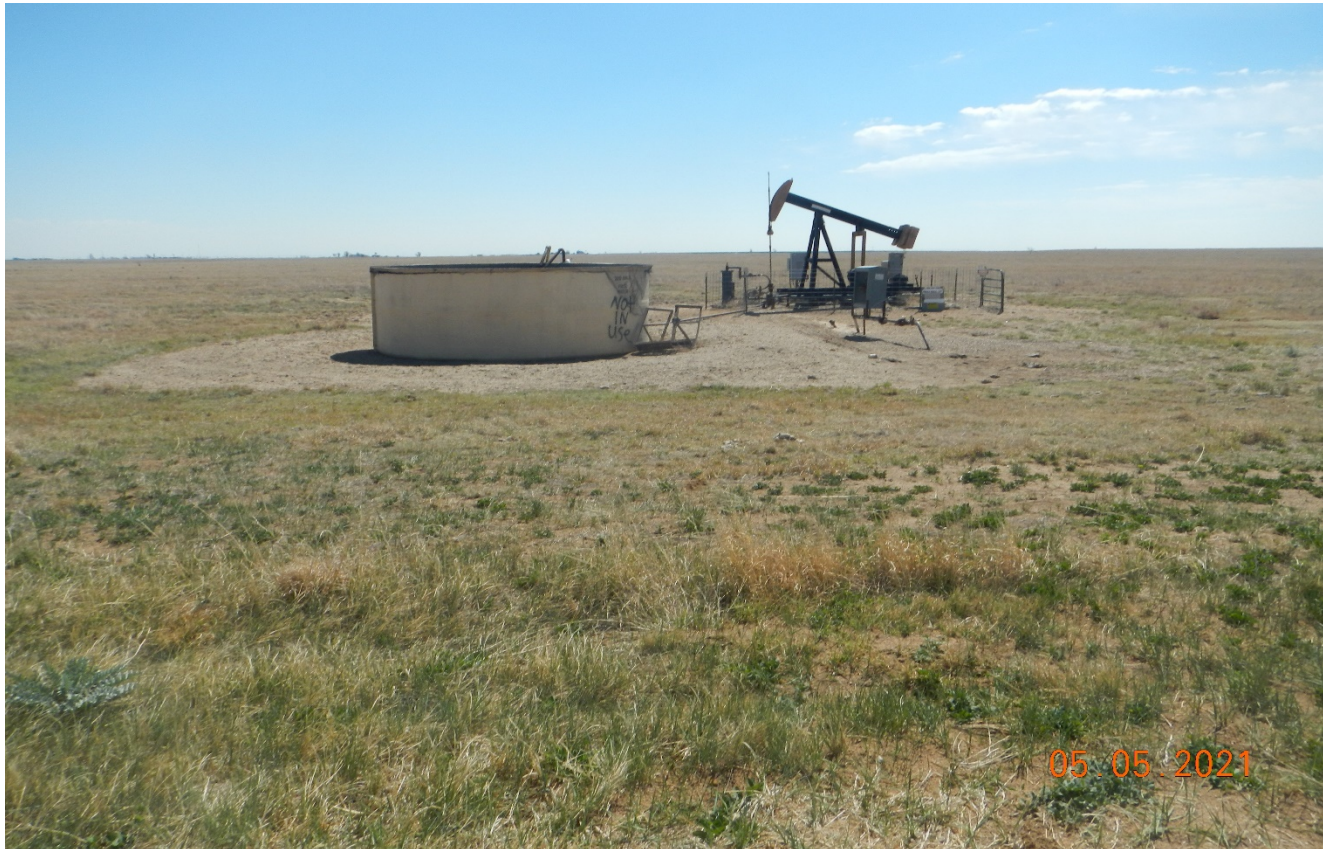
Photo 1. Facing east toward the location..