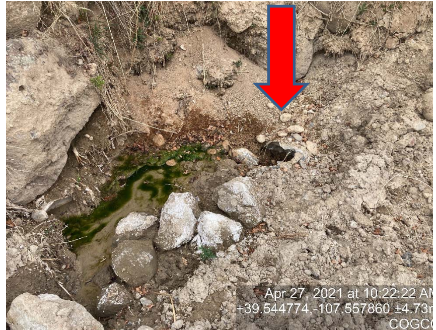
Inlet side of culvert on access road. Culvert is depicted by arrow