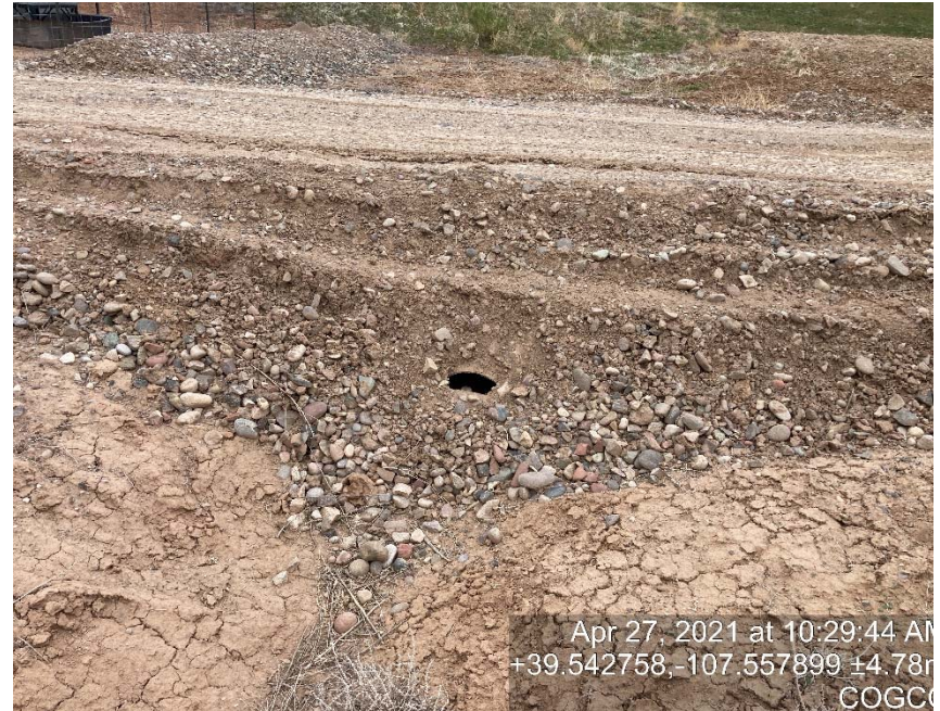
Outlet side of culvert on location