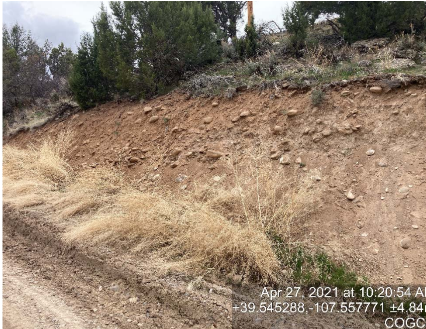
Cut slope on access road lacks stabilization