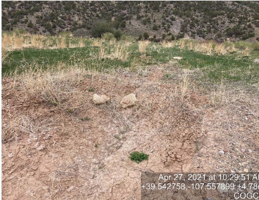
Sediment trap on outlet side of culvert on location