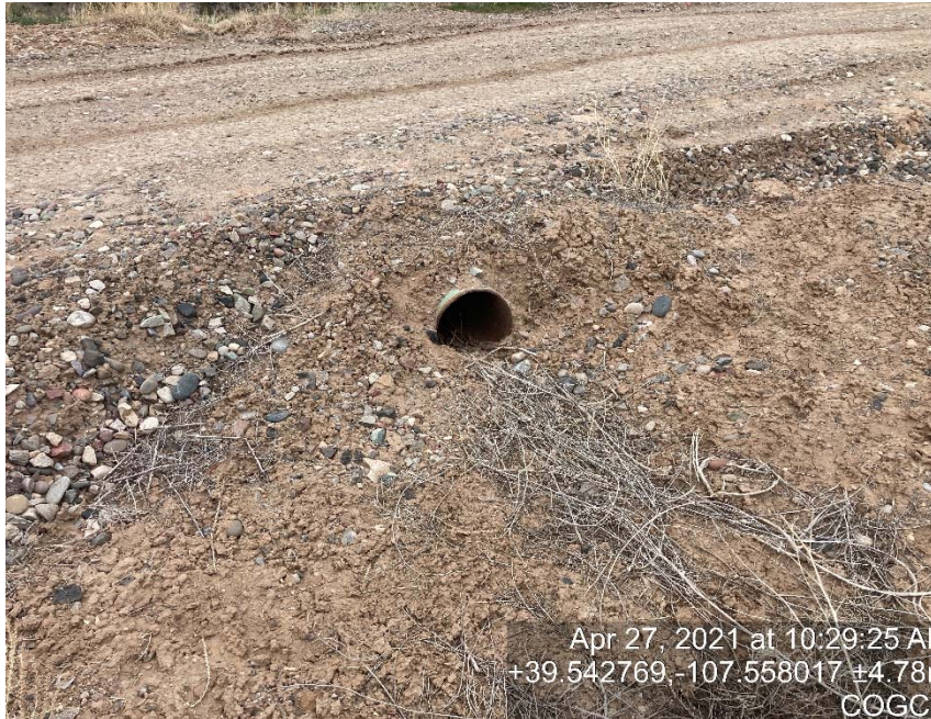
Inlet side of culvert on location