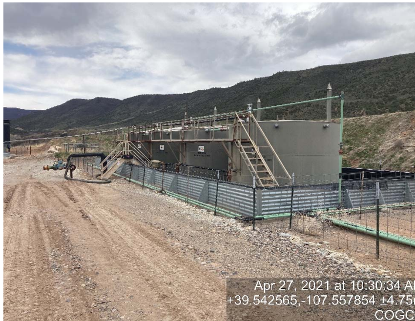
Location/ No battery signage