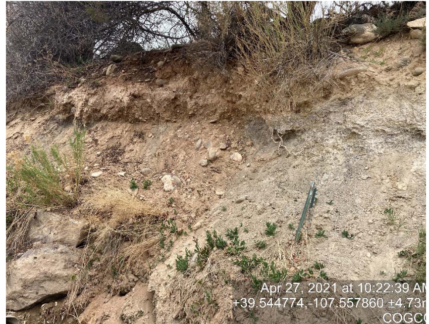
Cut slope on access road lacks stabilization. This photo is above culvert in next photos.