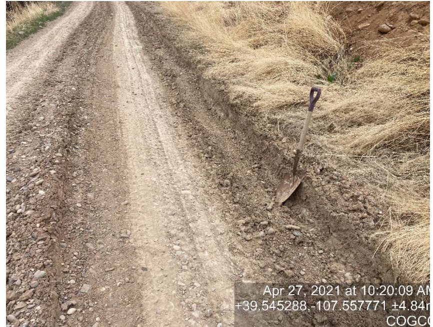
Lack of stabilization/compaction on access road