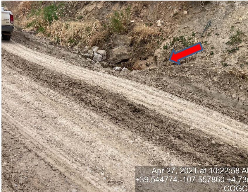
Inlet side of culvert on access road and lack of stabilization/compaction. Culvert is depicted by arrow