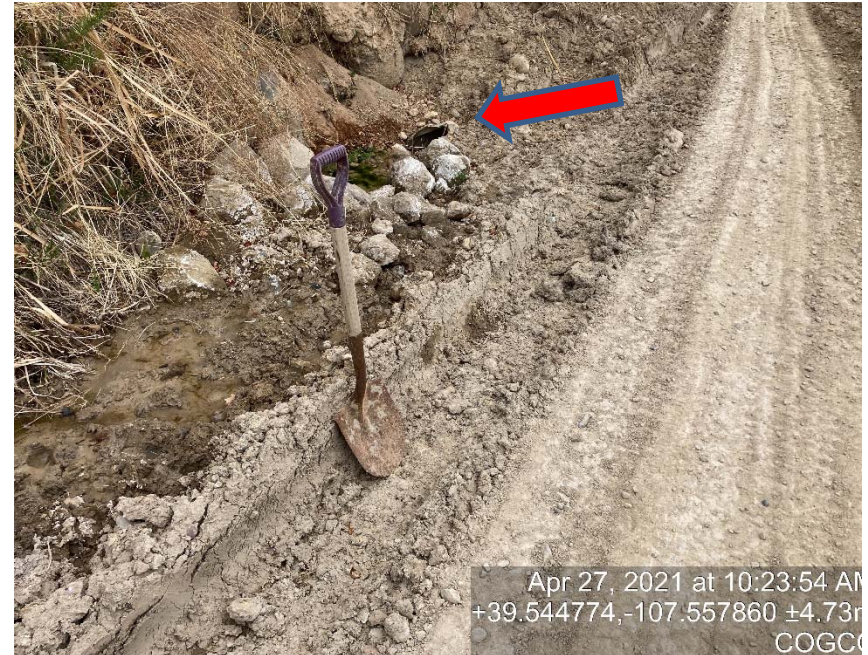
Inlet side of culvert on access road and lack of stabilization/compaction. Culvert is depicted by arrow