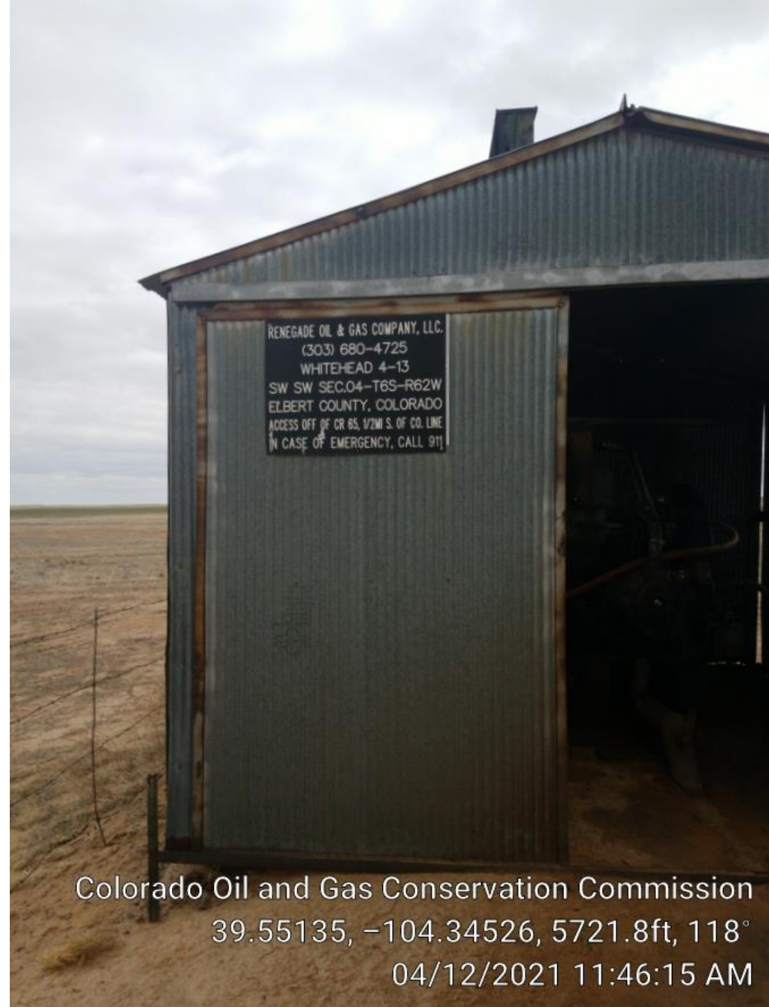
Colorado Oil and Gas Conservation Commission 39.55135, -104.34526, 5721.8ft, 118° 04/12/2021 11:46:15 AM