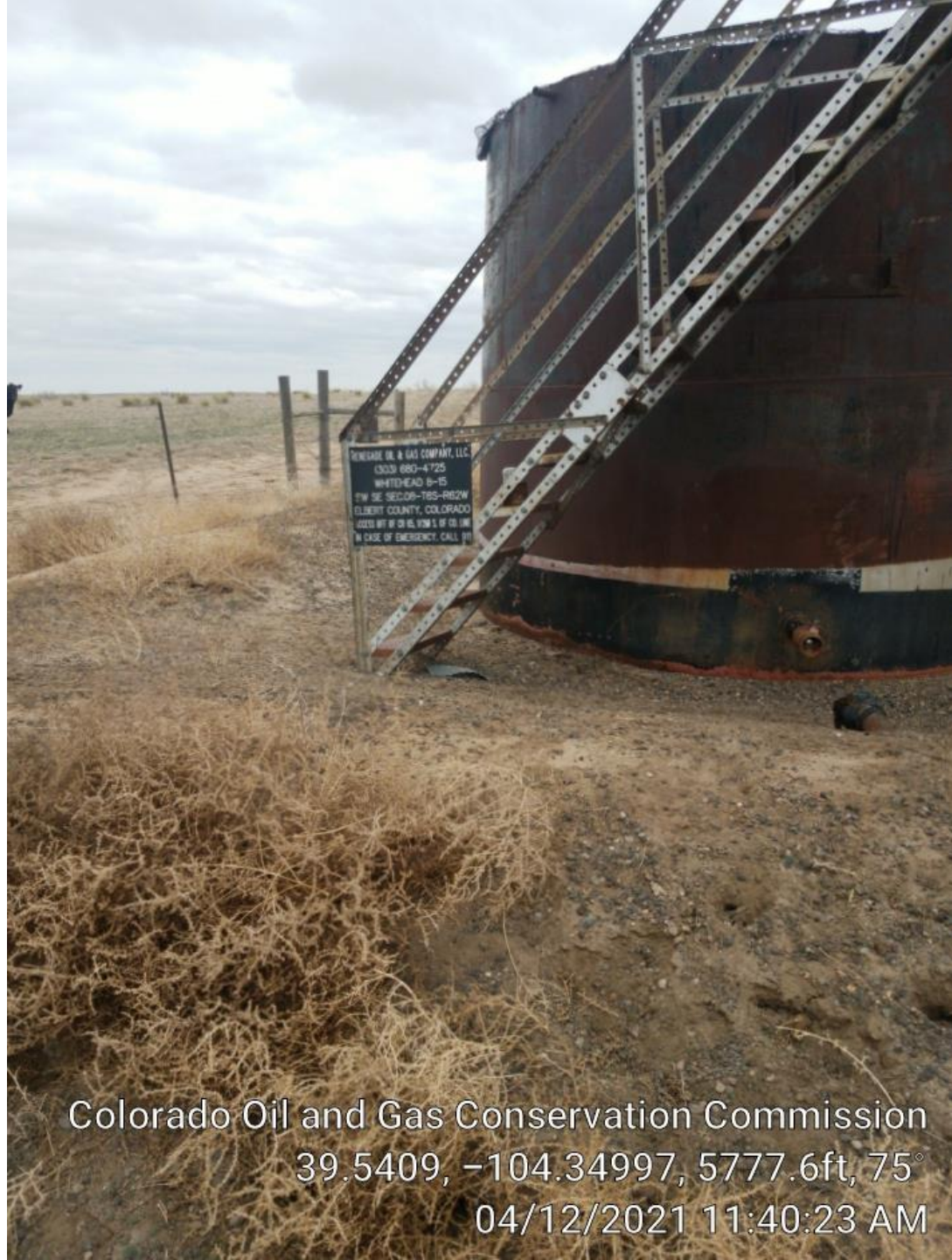
Colorado Oil and Gas Conservation Commission 39.5409, -104.34997, 5777.6ft, 75° 04/12/2021 11:40:23 AM