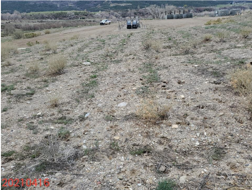
Photo 5: Photo taken from the interim areas on the north end of the Location, facing south. Photo shows desirable perennial vegetative establishment is not progressing towards 1003 reclamation standards; green vegetation observed in photo is predominantly undesirable weedy annual plant species such as cheat grass