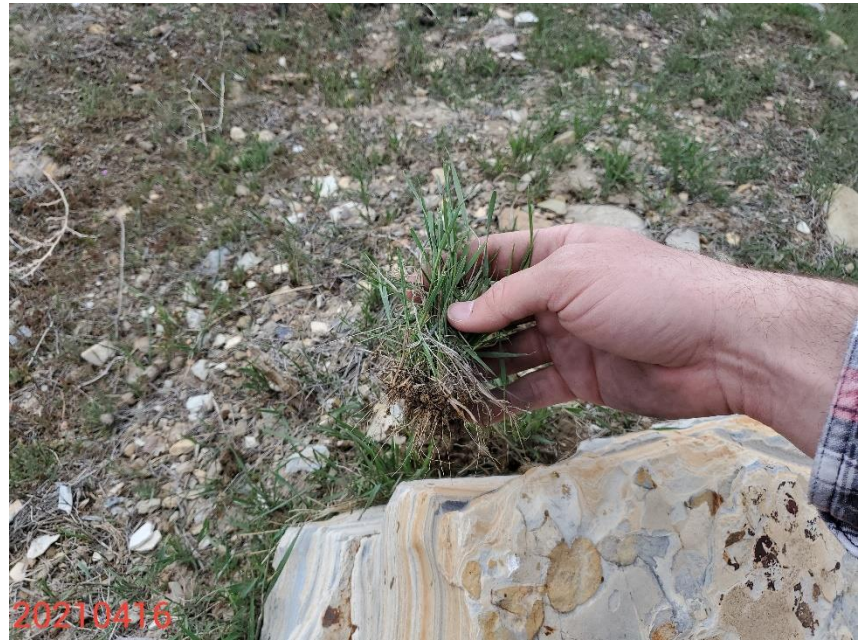
Photo 10: Continued from photo 7. Photo shows vegetation observed is predominantly undesirable weedy annual plant species such as cheat grass