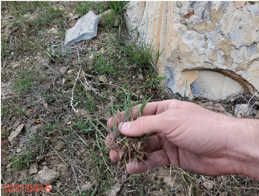
Photo 9: Continued from photo 7. Photo shows vegetation observed is predominantly undesirable weedy annual plant species such as cheat grass