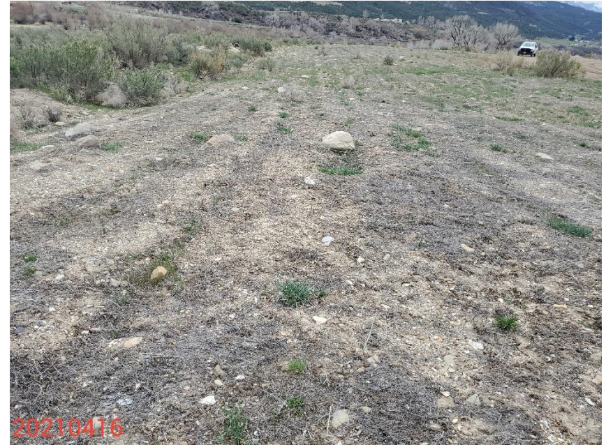
Photo 4: Photo taken from the interim areas on the northeast end of the Location, facing south. Photo shows desirable perennial vegetative establishment is not progressing towards 1003 reclamation standards; vegetation predominantly undesirable weedy annual plant species such as cheat grass