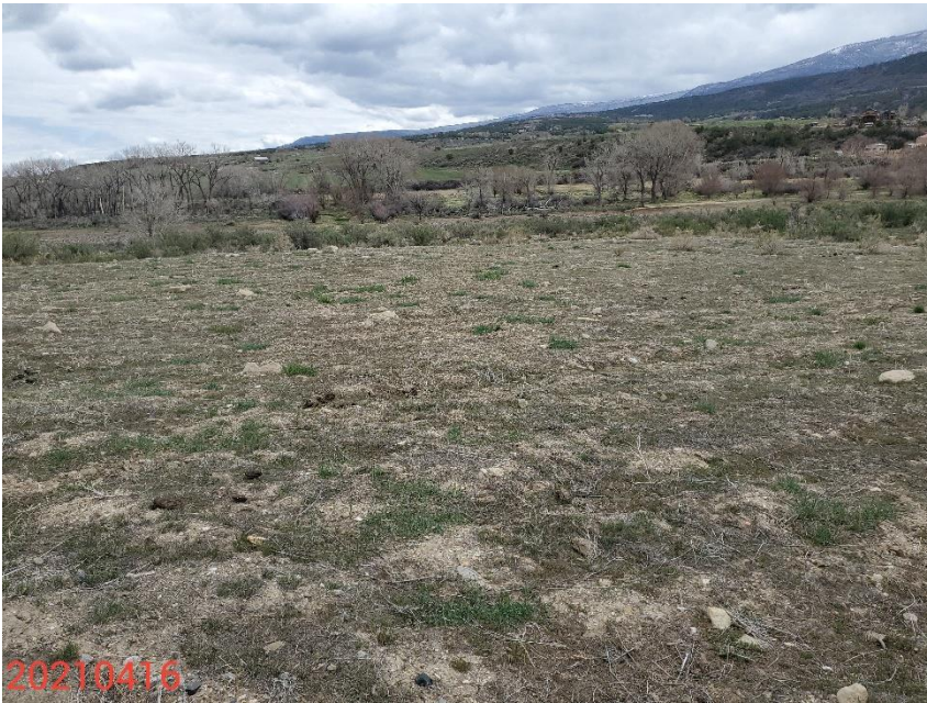
Photo 1: Photo taken from the interim areas on the southeast end of the Location, facing southeast. Photo shows desirable perennial vegetative establishment is not progressing towards 1003 reclamation standards; vegetation predominantly undesirable weedy annual plant species such as cheat grass