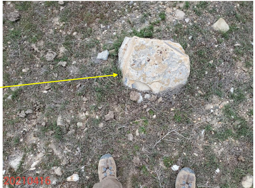
Photo 8: Continued from photo 7. Photo shows vegetation observed is predominantly undesirable weedy annual plant species such as cheat grass