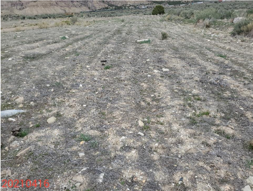
Photo 3: Photo taken from the interim areas on the southeast end of the Location, facing northeast. Photo shows desirable perennial vegetative establishment is not progressing towards 1003 reclamation standards; vegetation predominantly undesirable weedy annual plant species such as cheat grass