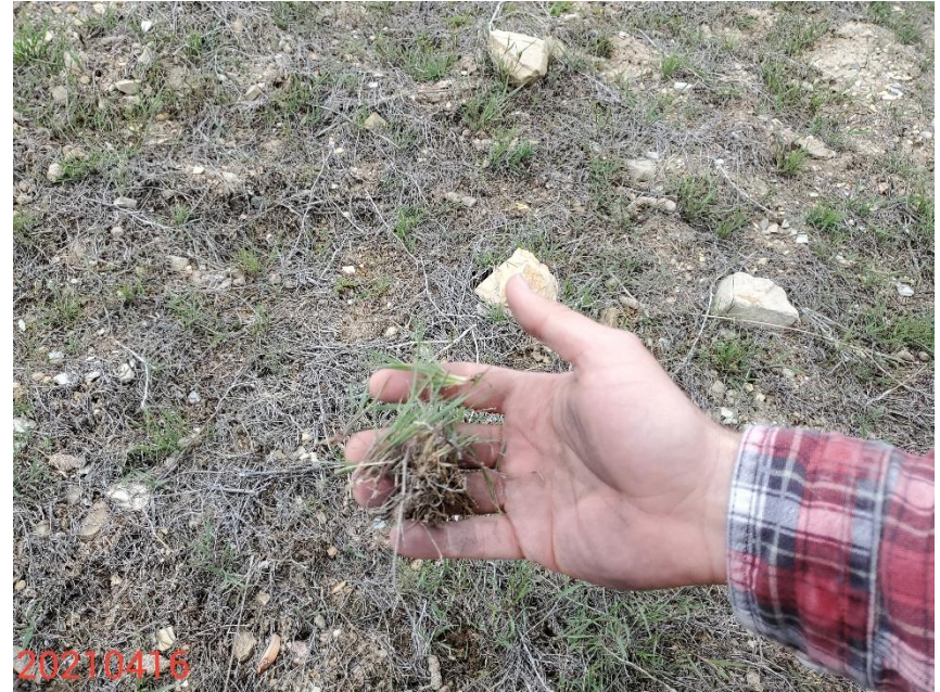
Photo 6: Continued from photo 5. Photo shows vegetation observed is predominantly undesirable weedy annual plant species such as cheat grass