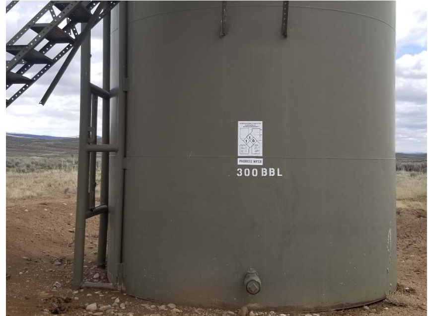
Photo 4. Tank label incomplete/inaccurate.