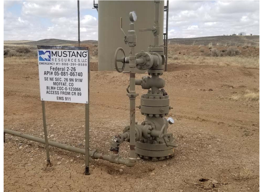
Photo 2. Wellhead sign incomplete/inaccurate. No bradenhead access apparent.