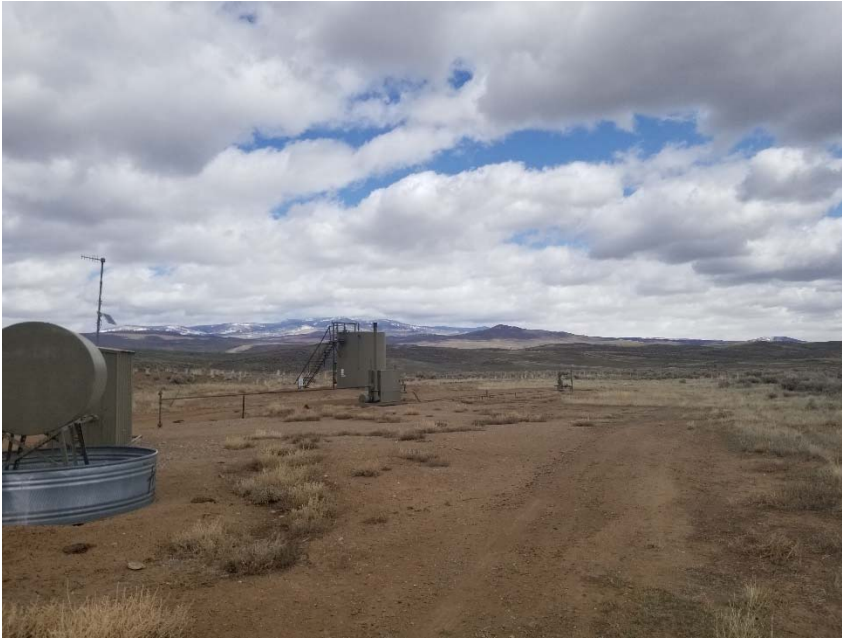
Photo 1. Overview of location taken at entrance facing southeast.