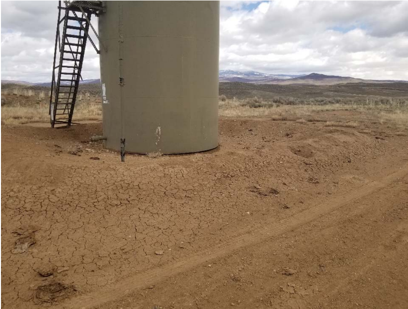
Photo 5. Animal burrows in berm.