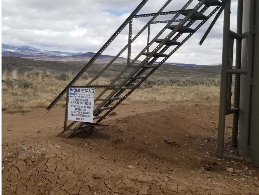
Photo 3. Battery sign incomplete/inaccurate.